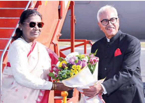
President Droupadi Murmu being welcomed by Manipur Governor Ajay Kumar Bhalla on her arrival in Imphal on Thursday