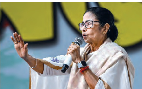
West Bengal Chief Minister Mamata Banerjee addressing a public meeting, in Krishnagar in West Bengal on Thursday

"They will take away the rights of mothers and sisters in the name of SIR and then they will bring police from Delhi during the election and intimidate the people of Bengal mothers and sisters, if your names are struck off, you