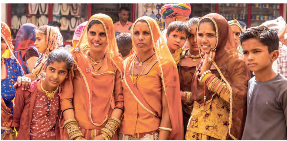
Women at the Pushkar market

The November 2025 round of the survey was conducted after the GST rate rationalisation announced on 3 September 2025, during the festival season, and against the backdrop of sharp moderation in rural inflation and food deflation. As per the NABARD survey, 42.2 per cent of rural households reported to have experienced an increase in