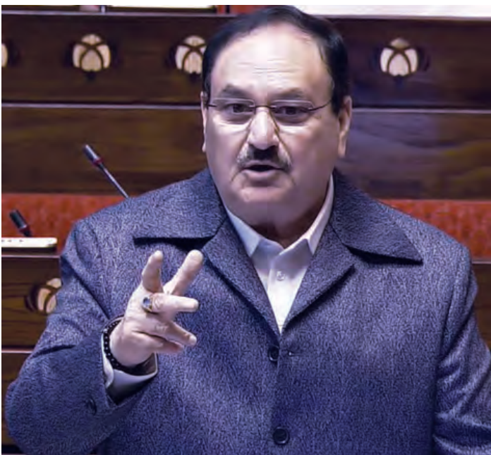
Union Minister of Health and Family Welfare JP Nadda speaking in the Rajya Sabha during the Winter session of Parliament in New Delhi on Thursday

"I want to say with a sense of full responsibility that the respect and status that Vande Mataram was to be accorded, it did not receive the same and those in power at the time are fully