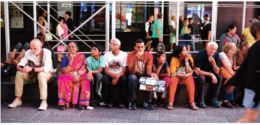
An Indian family eating in the middle of Times Square, New York City

"As of December 15, the Department of State will conduct an online presence review for all H-1B applicants and their dependents... Due