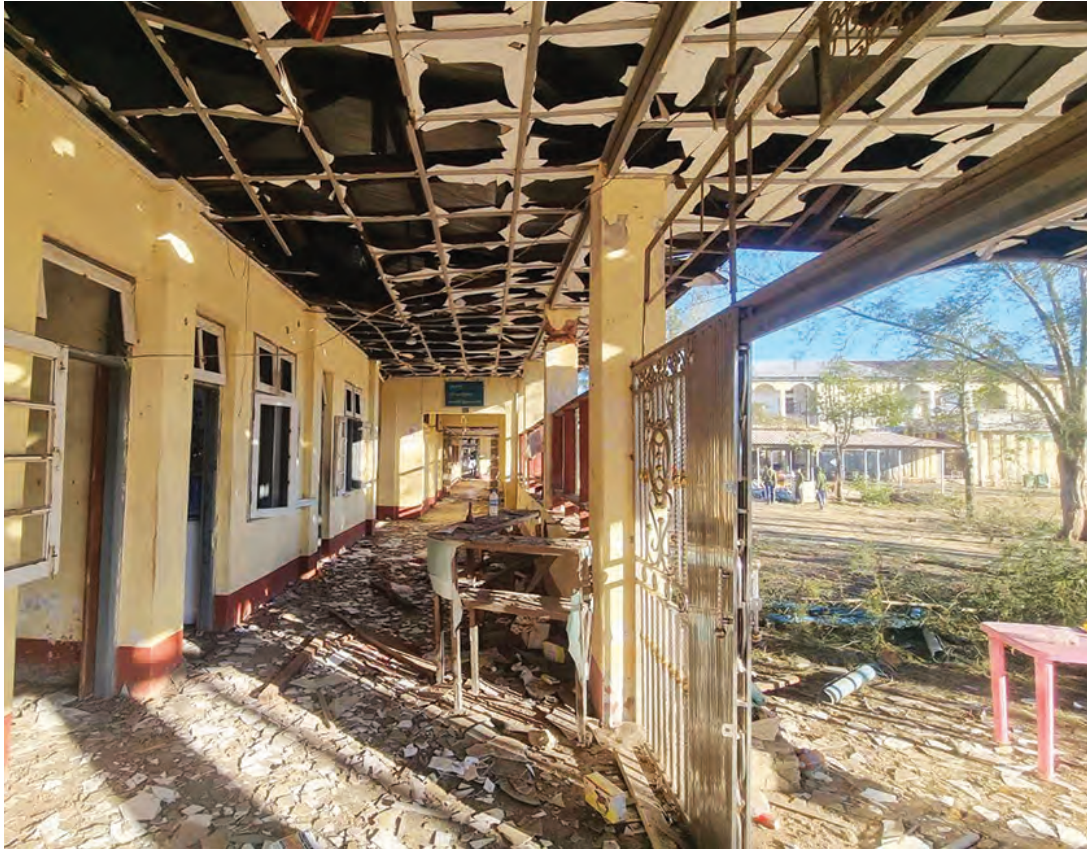
Damaged building is seen at the hospital that was allegedly hit by a military air strike in Mrauk-U township in Rakhine state, Myanmar

Rakhine-based online media posted photos and videos showing damaged buildings and debris, including medical equipment. The hospital has been the main source of health care for people in Rakhine, where most hospitals have closed because of