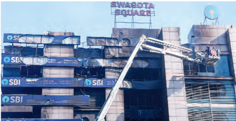
Firefighters dousing a fire that broke out at Swagata Square Complex on Wednesday in Guwahati

"Accordingly, we contacted the DCS of Anjaw and Teju for confirmation. Both the DCS said that rescue teams have so far recovered several bodies and found one person alive. Some more persons are still missing," he added.