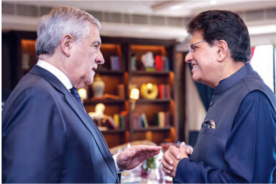
Union Minister Piyush Goyal during a meeting with the Deputy Prime Minister and Minister of Foreign Affairs of Italy Antonio Tajani in Mumbai on Thursday.

“Obviously, it takes time. Obviously, we have a lot of things to consider. You need to crystal gaze into the future, you need to ensure that sensitivities on both sides are protected, and you need to grab the low-hanging fruit so that businesses and people on both sides can benefit,” Goyal said, adding that negotia-