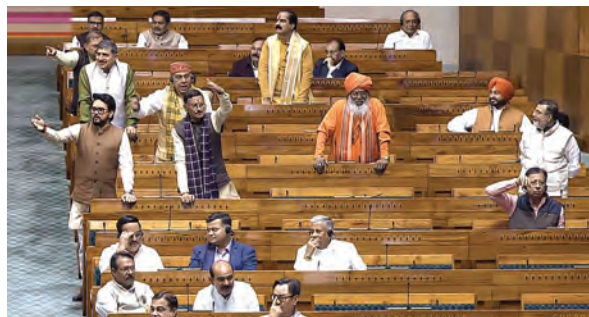
Union Minister of State Sanjay Seth with BJP MPs Anurag Thakur, Jagdambika Pal and others in the Lok Sabha

During the Question Hour, Thakur asked the Lok Sabha Speaker if e-cigarettes, which are banned in the country, have been allowed in the House, alleging, "The TMC member has been constantly smoking in the House for