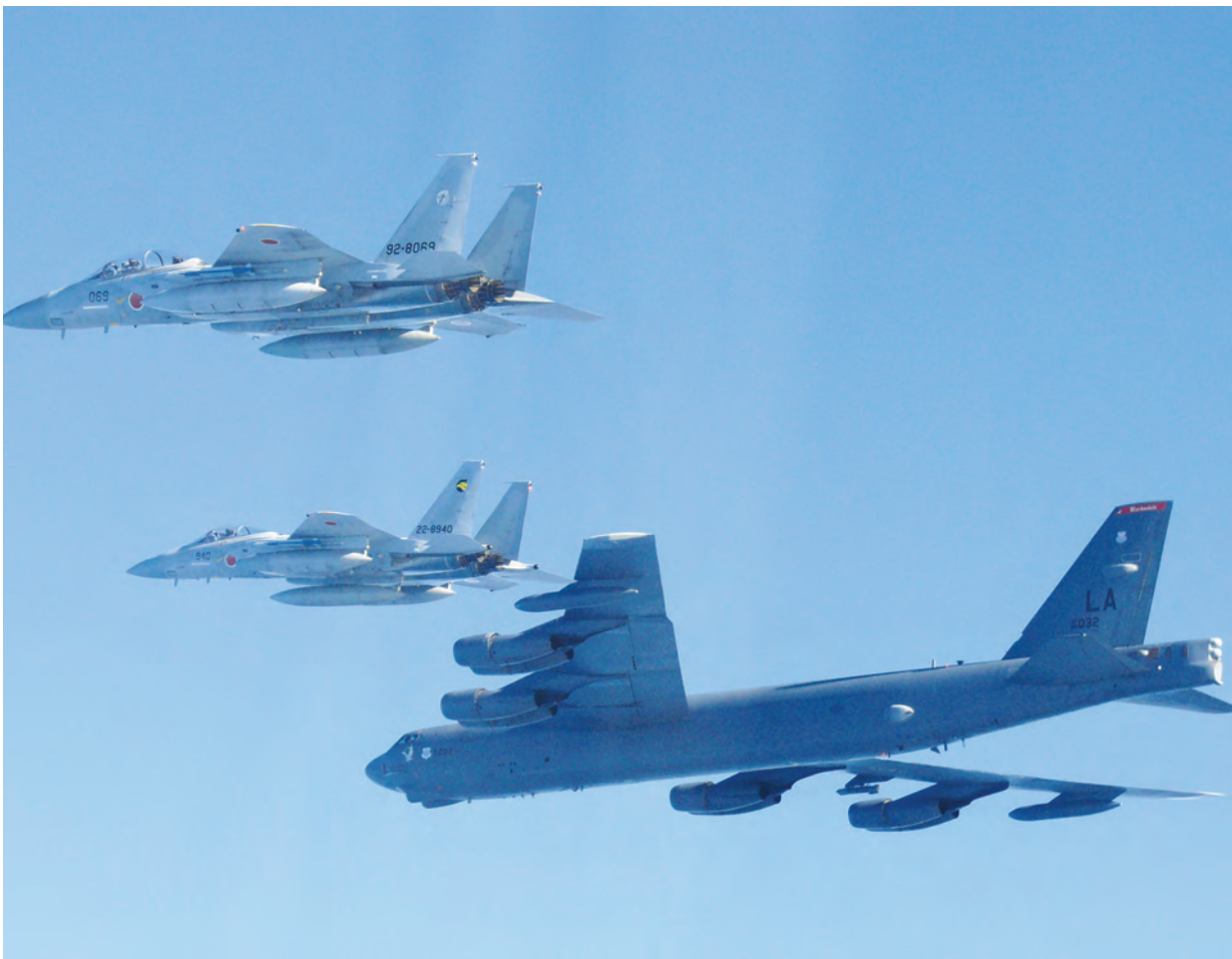
Japan Air Self-Defense Force's F-15 fighters holding a joint military drill with the US B-52 bomber in the vicinity of Japanese airspace

The row escalated over the weekend when separate Chinese drills involving a carrier near southern Japan prompted Tokyo to scramble jets and to protest that Japanese aircraft were target-