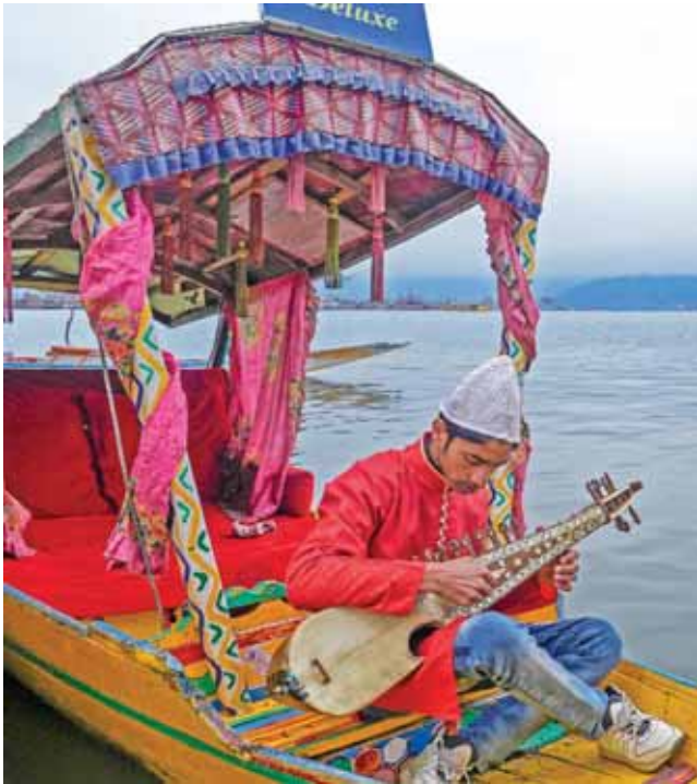
A young boy plays Rabaabon a Shikara in Dal Lake as weather remains pleasant in Kashmir Valley.

(The author is DGP and Head, Haryana State Narcotics Control Bureau. Views are personal)