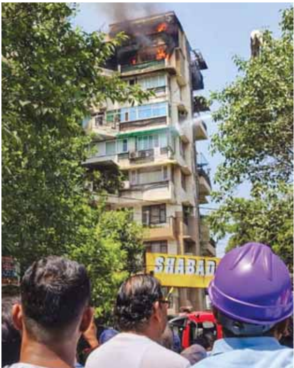
Locals gather after a fire broke out in a residential building, at Dwarka, in New Delhi