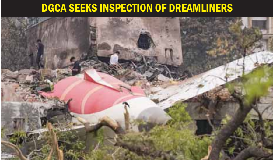
Remains of the crashed Air India plane lie on a building in Ahmedabad

In a letter to Air India, the Directorate General of Civil Aviation (DGCA) on Friday ordered enhanced safety inspection of Air India’s Boeing 787 Dreamliner fleet