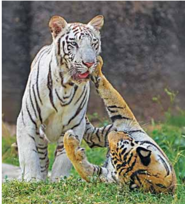
White Tiger Bheem and Bengal Tiger Skandi play at the Nahargarh Biological Park, in Jaipur.

(The author is a political analyst. Views are personal)