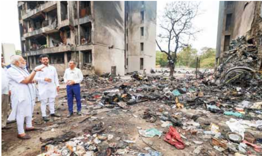
Prime Minister Narendra Modi with Civil Aviation Minister Rammohan Naidu visiting the site of the Air India plane crash in Ahmedabad on Friday

PM Modi arrived at the Sardar Vallabhbhai Patel Airport on Friday morning and drove straight to the crash site, officials said. He spent around 20 minutes inspecting the site, where the Boeing 787 Dreamliner aircraft (AI171) crashed into a complex of BJ Medical College in the Meghaninagar area shortly