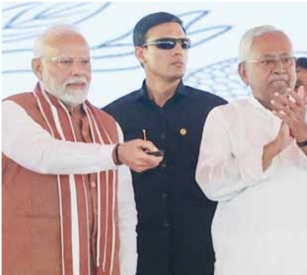
Prime Minister Narendra Modi and Bihar Chief Minister laying foundation stone for Darbhanga AIIMS in November 2024

The issue has now become a matter of sentiments for peo-