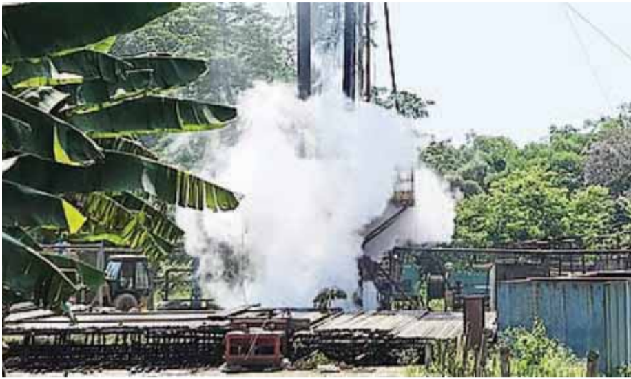
Sivasagar factory blow out

The blowout took place on June 12 at Well No RDS 147 of Rig No SKP 135 of Rudrasagar oil field of Oil and Natural Gas Corporation