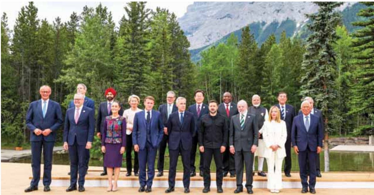
Canada’s Prime Minister Mark Carney (centre) smiles as he stands with G7 leaders and outreach countries, international organisations and invited guests at the G7 Summit

Zelenskyy had been set to meet with Trump while world leaders were gathering in the Canadian Rocky Mountain resort of Kananaskis, but that