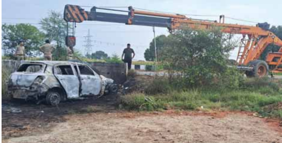
Charred remains of a car being removed after it caught fire following a collision in Bulandshahr on Wednesday.