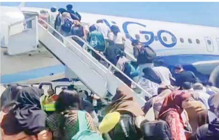
Students and their family members board a plane at the Doha airport ahead of their return to India under an evacuation operation from Iran facilitated by the Government of India

Trump initially distanced himself from Israel's surprise attack on Friday that triggered the conflict, but in recent days has hinted at greater American involvement, saying he wants something "much bigger" than a ceasefire. The US has also sent more military aircraft and warships to the region. Khamenei dismissed the "threatening and absurd