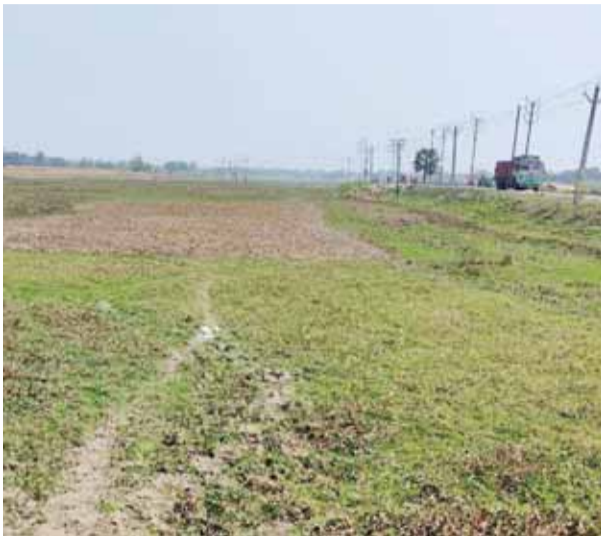
The land identified by the Saharsa administration in Gauravgarh near airport in the district.