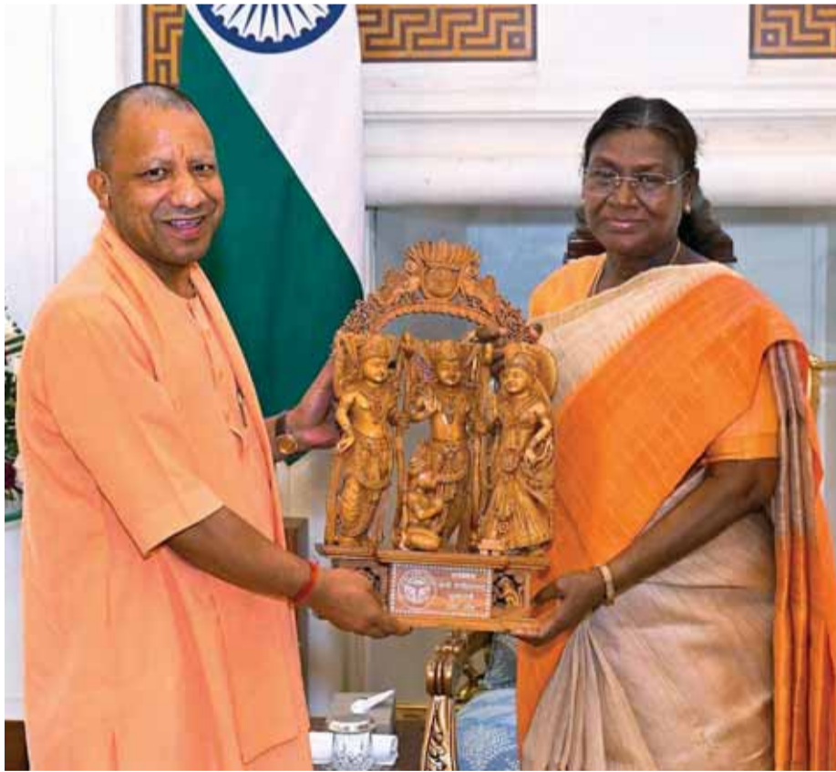
President Droupadi Murmu with Uttar Pradesh Chief Minister Yogi Adityanath during a meeting at Rashtrapati Bhavan in New Delhi.

Bihar. The onset of monsoon in the state brought some much-needed relief on Wednesday from the parched and hot weather conditions, with temperature in most parts hovering above the 40-degree Celsius mark. Meanwhile, the state government has advised residents to exercise caution as the arrival of the monsoon typically leads to an increase in the frequency and intensity of lightning strikes. The meteorological department has also warned of potential damage to dilapidated buildings, kutcha houses, and huts due to heavy rain and lightning. The district administration has been advised to make preparations and remain on alert given the recent weather forecast, relief department officials said.