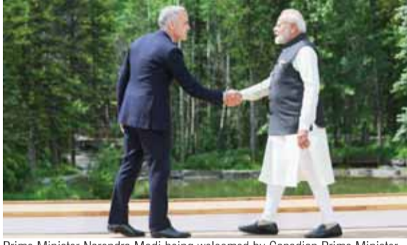
Prime Minister Narendra Modi being welcomed by Canadian Prime Minister Mark Carney as he arrives for the G7 Summit at Kananaskis