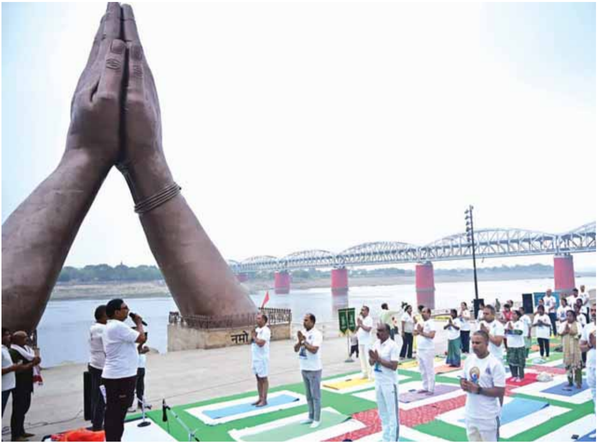
CRPF personnel, others practicing yoga at Namo Ghat in Varanasi on Wednesday.

NCL's extensive awareness drive includes a range of community-oriented programmes: Yoga awareness rallies - to bring yoga's benefits to every corner of the community including all employees, contractual workers, students and surrounding stakeholders. Essay writing and poster making competitions - to enable local children and youth of Singrauli region to creatively reflect on yoga's role in health and well-being. Public yoga sessions - following the Common Yoga Protocol (CYP) for all, including children and senior citizens. Workshops in schools and colleges - designed to foster a habit of yoga from a young age. On the International Yoga Day over 10,000 people will participate in yoga session across the company in all its areas and units.