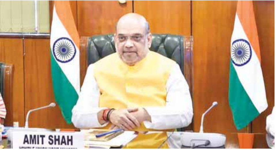
Union Home Minister Amit Shah

Of this, ₹1,504.80 crore will be the Central share from the recovery and reconstruction funding window under the NDRF, it added.