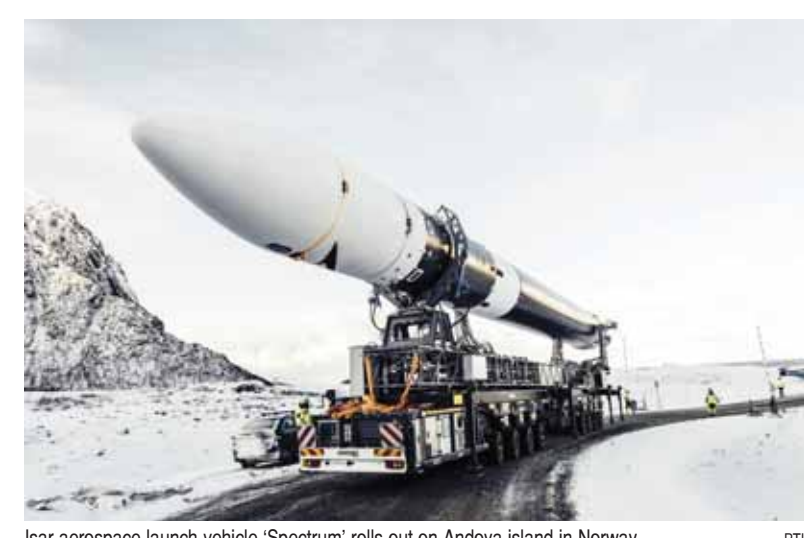
Isar aerospace launch vehicle 'Spectrum' rolls out on Andoya island in Norway

He also pointed out that those who meet Khan make political statements outside the jail in violation of the rules.