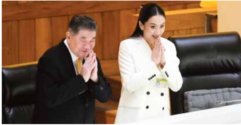
(Left)Thailand's Deputy PM Phumtham Wechayachai and (right) PM Paetongtarn Shinawatra greet lawmakers before a no-confidence debate in Bangkok

Thaksin has been at the heart of nearly two decades of deep political divisions pitting a mostly poor, rural majority that supported him against royalists, the military and their urban backers, who accuse