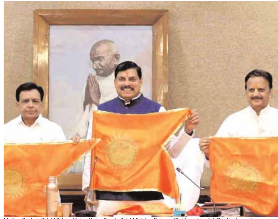
Madhya Pradesh Chief Minister Mohan Yadav, Deputy Chief Ministers Rajendra Shukla and Jagdish Devda release the Vikramaditya flag and the booklet 'India's New Year Vikram Samvat' in the state assembly in Bhopal on Monday.

Places Given the summer season, CM Dr. Yadav directed continuous monitoring of drinking water availability in rural and urban areas and the implementation of appropriate measures as needed. He instructed officials to set up drinking water kiosks (Pyaau) at public places and ensure the availability of water for animals. He also emphasized the proper maintenance of wells, stepwells, ponds, and other water sources, encouraging public participation in the Jal Ganga campaign. Chief Minister Dr. Yadav acknowledged reports of crop damage due to a recent hailstorm in over 400 villages. He instructed officials to conduct a survey and ensure swift disaster relief for the affected farmers.