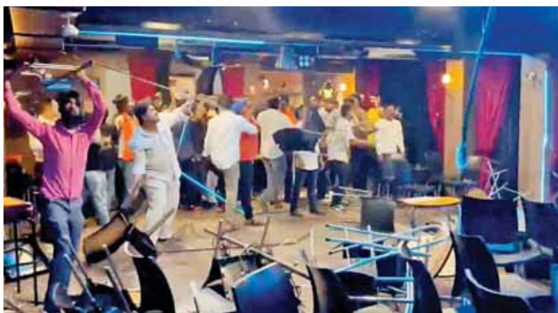
Shiv Sena (Shinde) workers vandalise the venue of comedian Kunal Kamra's show after his remarks on Maharashtra Dy CM Eknath Shinde in Khar area in Mumbai

Fadnavis, who is also the state Home Minister, said that Kamra had displayed the same red-coloured Constitution book