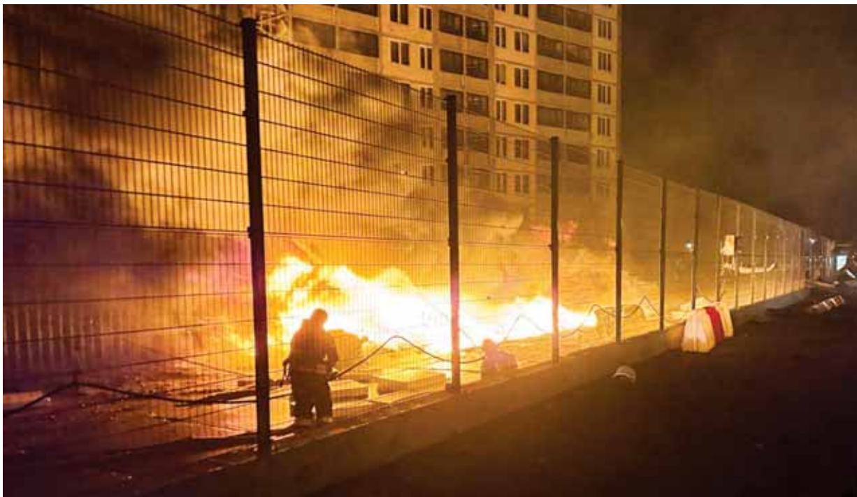
Firefighters put out the fire following a Russian attack near Kyiv, Ukraine

Grigory Karasin, head of the foreign affairs committee in the Russian parliament's upper house and a participant in Monday's talks, told the Interfax news