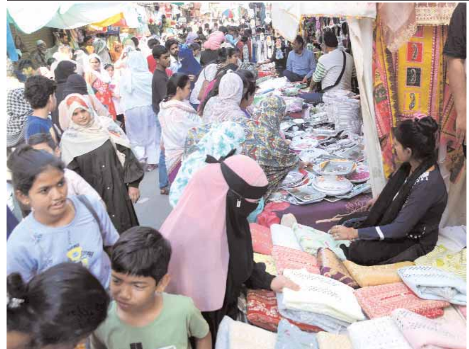
People shop in the market ahead of the Eid-ul-Fitr festival in Bhopal on Monday.