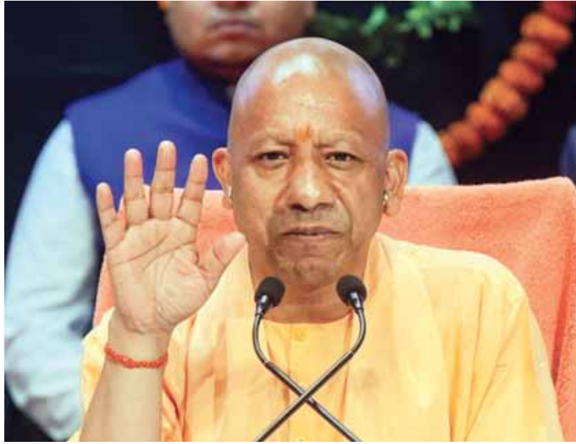
Uttar Pradesh Chief Minister Yogi Adityanath during a press conference on the completion of eight years of the state government in Lucknow

Janata Party's (BJP) influence in Uttar Pradesh. His unexpected selection for the top post was initially met with skepticism, but he has since emerged as a dominant political figure. His re-election in 2022 reinforced his hold over the state, making him the first Chief Minister in nearly four decades to return to power for a second consecutive term. In a political landscape where caste equations and identity politics often dictate electoral outcomes, Yogi has shifted the focus towards governance marked by religious nationalism, law and order, and economic progress. His slogan, "I never lose," has proven true both electorally and administratively, making him a formidable political force. Adityanath's first term focused on transforming Uttar Pradesh's image, particularly in law and order. His administration launched an aggressive crackdown on crime, reinforcing a zero-tolerance policy against corruption and mafia elements. This shift, according to political observer Rajendra Kumar, was pivotal in reshaping the state's perception.