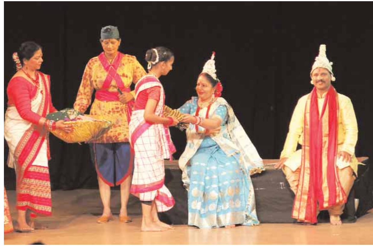
A scene from the play 'Lachit Borphukan Ek Veer Yodha' staged at Shaheed Bhawan in Bhopal on Monday.