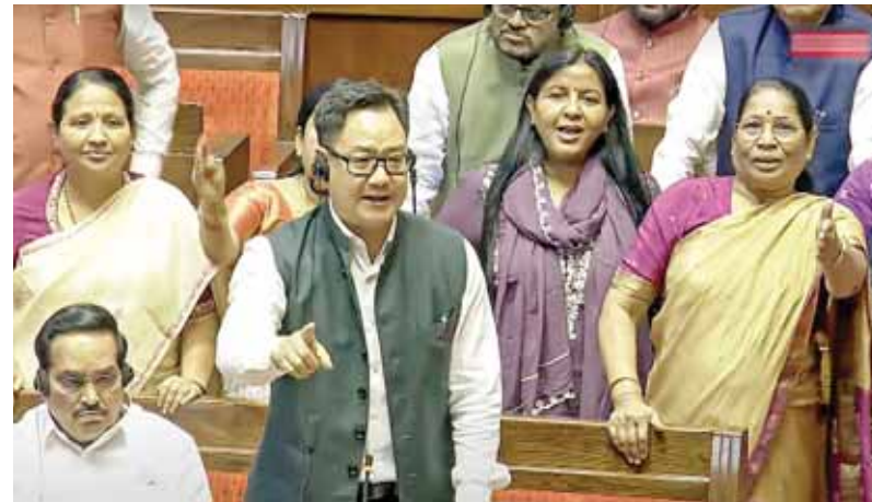
Union Minister Kiren Rijju speaks in the Rajya Sabha during the Budget session of Parliament

In both the Houses, Parliamentary Affairs Minister Kiren Rijju raised the issue, claiming that NDA MPs are agitat-