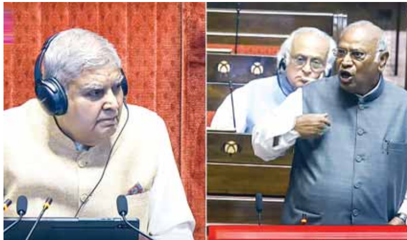
VP Jagdeep Dhankhar during the Budget session of Parliament in New Delhi

He had earlier written to Nadda and Kharge for holding such a meeting for a