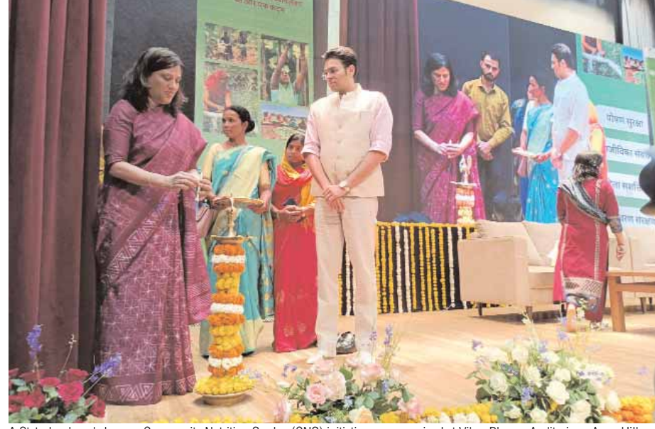
A state-level workshop on Community Nutrition Garden (CNG) initiative was organised at Vikas Bhavan Auditorium, Arera Hills, Bhopal on Monday.