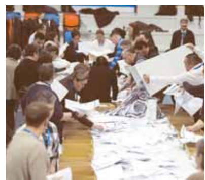
Electoral workers prepare to count votes during parliamentary elections in Nuuk, Greenland.

Greenland, a self-governing region of Denmark, straddles strategic air and sea routes in the North Atlantic and has rich deposits of the rare earth minerals needed to make everything from mobile