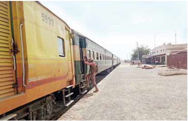
A paramilitary soldier takes position at a railway station near the attack site of a passenger train by insurgents in Mushkaf in Bolan district of Pakistan's southwestern Balochistan province

Security forces rescued 190 passengers from a hijacked train, killing 30 Baloch militants in Pakistan's restive Balochistan, as they continued to battle heavily-armed insurgents for a second day on Wednesday. The Jaffar Express, carrying some 400 passengers in nine coaches, was going from Quetta to Peshawar when militants derailed it using explosives and hijacked it. The Baloch Liberation Army claimed responsibility for the attack on Tuesday when they said they killed six soldiers. However, there has been no confirmation from the Pakistani authorities on casualties.