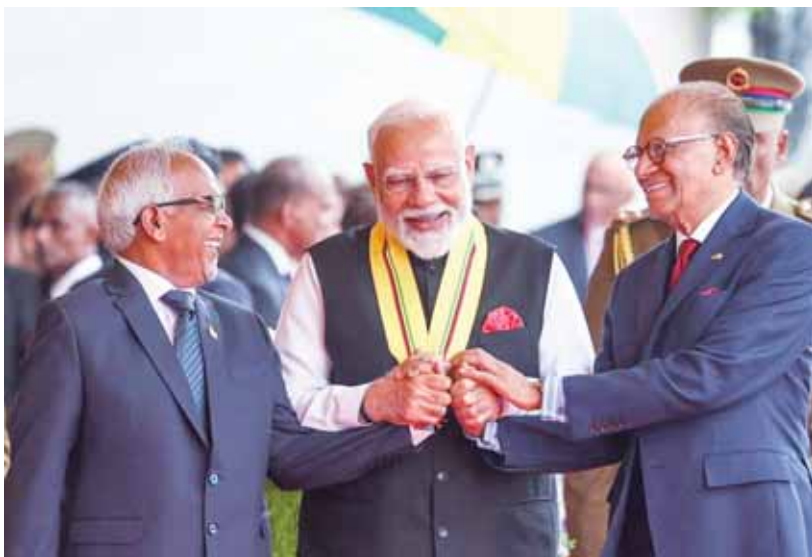
PM Modi after being conferred highest civilian award of Mauritius

The officials cited several instances of Modi being the main guest at signature events of several countries to assert that the prime minister as a "global leader is