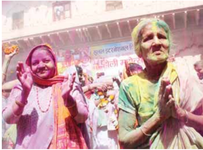
Widows in Vrindavan celebrate Holi

The transformation of Vrindavan's widows began in 2012, when the Supreme