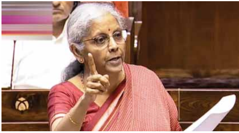
Finance Minister Nirmala Sitharaman

She said violence in Manipur has adversely impacted economic activities in the state but expressed confidence that it will recover swiftly. Responding to the Opposition criticism of not paying the required focus to Manipur, she said the