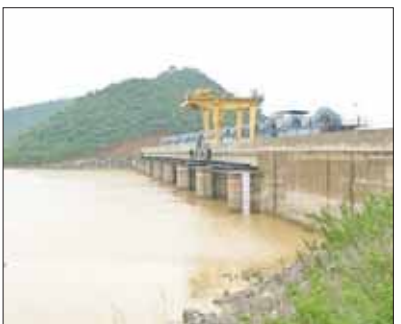
Chhattisgarh Minister on this issue," the minister informed.

"We have discussed with the Chhattisgarh Government regarding water inflow, and Odisha's Chief Minister held discussions with the (concerned)