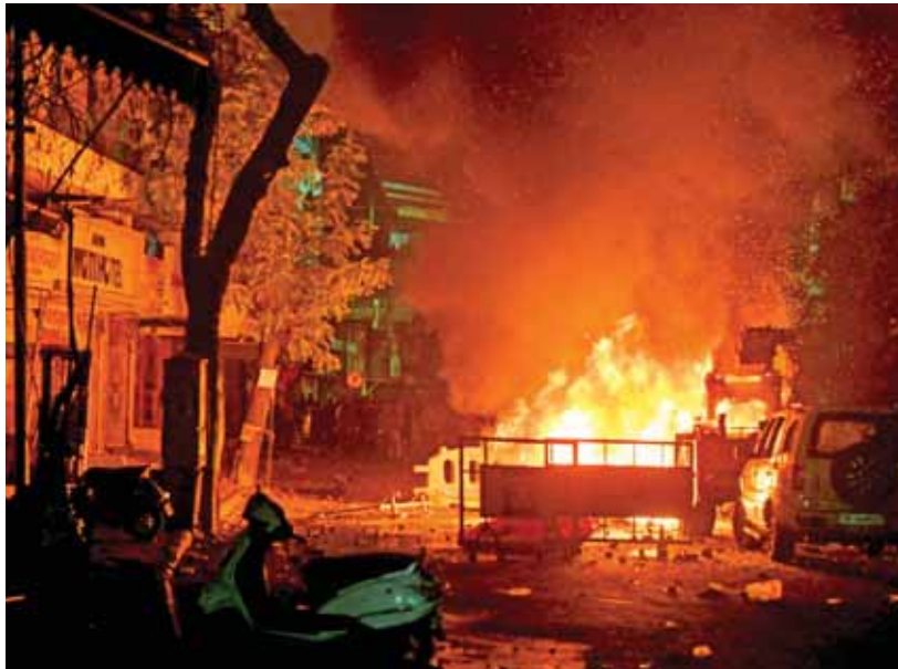
A fire set by miscreants amid violence following an agitation by a right-wing group demanding removal of Aurangzeb's tomb, in Nagpur

Making a statement in the Maharashtra Assembly, the chief minister said: "After the morning incident, there was peace in Nagpur. However, some people indulged in violence on Monday night in a pre-planned manner. We found a trolley full of stones and weapons were also found. The mob targeted specific houses and establishments. It (the attack) appears to be a premeditated conspiracy. We will not spare those behind the violence. The