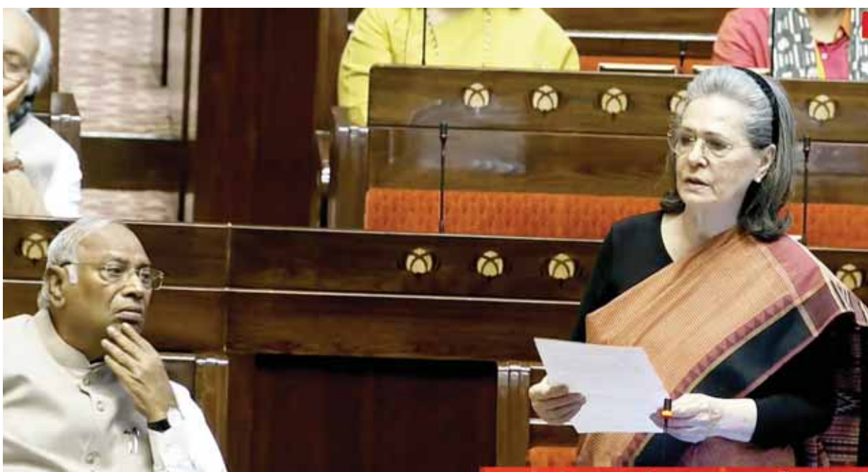
Congress MP Sonia Gandhi speaks in the Rajya Sabha during the Budget session of Parliament in New Delhi on Tuesday

The National Mobile Monitoring System (NMMS) app permits taking real-time attendance of workers at Mahatma Gandhi