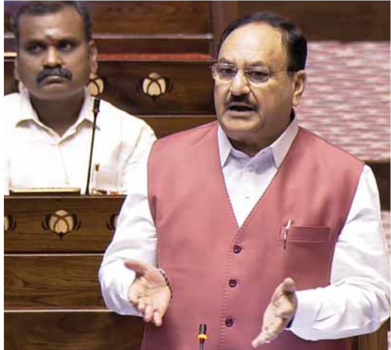
Union Minister JP Nadda speaks in the Rajya Sabha during the Budget session of Parliament in New Delhi on Tuesday

The minister said the scheme provides for the sale of generic medicines at 50 per cent to 80 per cent price of branded medicines through Janaushadhi Stores and the