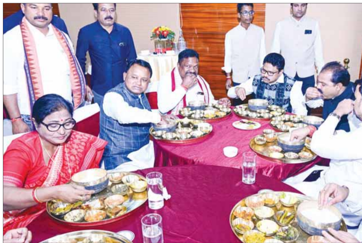
Biswa Pakhal Divas: Chief Minister Mohan Charan Majhi and other ministers along with State Assembly Speaker Surama Padhy take Pakhal in the Assembly premises on Thursday.

Parents and concerned citizens have urged authorities to take immediate action to ensure safety of school-children.