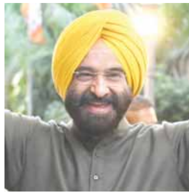
Delhi food and supply minister Manjinder Singh Sirsa

Traders raised concerns about the licensing process and said vendors selling sweets and snacks must obtain an FSSAI licence, yet a separate health licence from the Delhi Municipal Corporation is also mandatory, it stated.