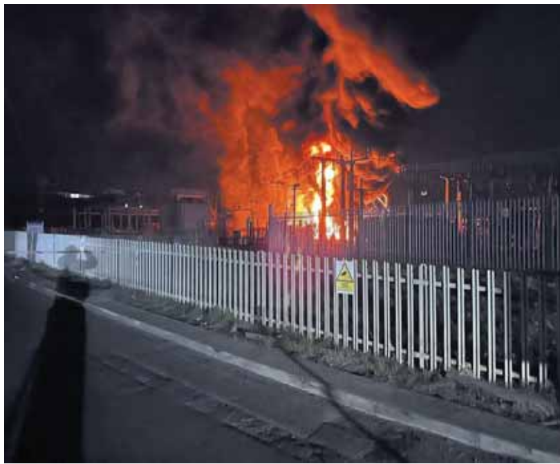
This photo provided by London Fire Brigade, shows a fire at the North Hyde electrical substation, which caught fire Thursday night and led to a closure of Heathrow Airport in London, on Friday

Unclear what caused the fire but foul play not suspected: It was too early to determine what sparked the huge blaze about 2 miles (3 kilometers) from the air-