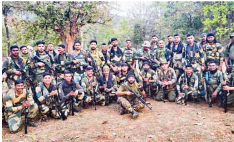
Security personnel after an operation against Naxalites in Chhattisgarh's Kanker