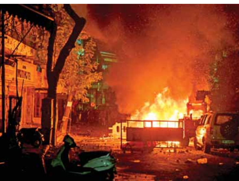
A fire set by miscreants amid violence following an agitation by a right-wing group demanding removal of Aurangzeb's tomb, in Nagpur

A massive war of words broke out in Maharashtra on Tuesday over the communal violence witnessed in Nagpur on Monday night, with chief minister Devendra Fadnis charging that the riots were "pre-planned" and the Opposition Maha Vikas Aghadi (MVA) blaming the BJP-led MahaYuti for the disturbances in the otherwise peaceful orange city.