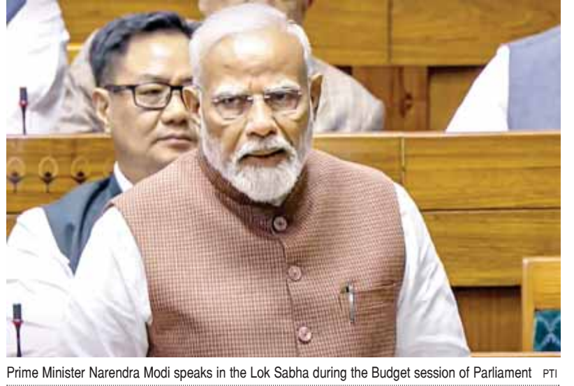
Prime Minister Narendra Modi speaks in the Lok Sabha during the Budget session of Parliament

Witkoff and White House press secretary Karoline Leavitt suggested that US and Russian officials have discussed the fate of the Zaporizhzhia nuclear power plant - Europe's largest - in southern Ukraine.