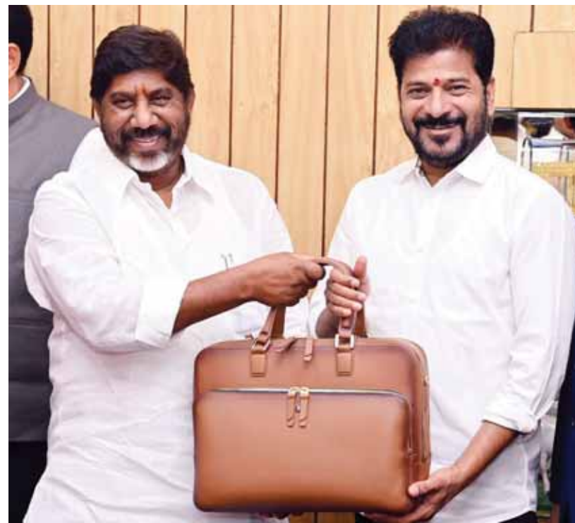
Telangana CM A Revanth Reddy with Deputy CM and Finance Minister Bhatti Vikramarka before the presentation of the State Budget for 2025-26 in the state Assembly in Hyderabad

The state government has proposed an allocation of ₹24,439 Crore for the Agriculture Department, including towards the Rythu Bharosa Scheme, under which each farmer receives ₹12,000 per acre annually as investment support and