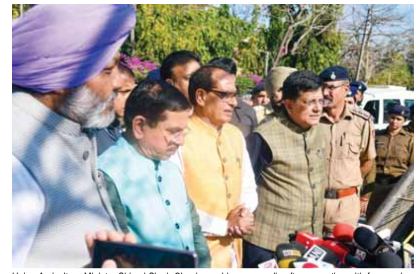
Union Agriculture Minister Shivraj Singh Chouhan addresses media after a meeting with farmers in Chandigarh