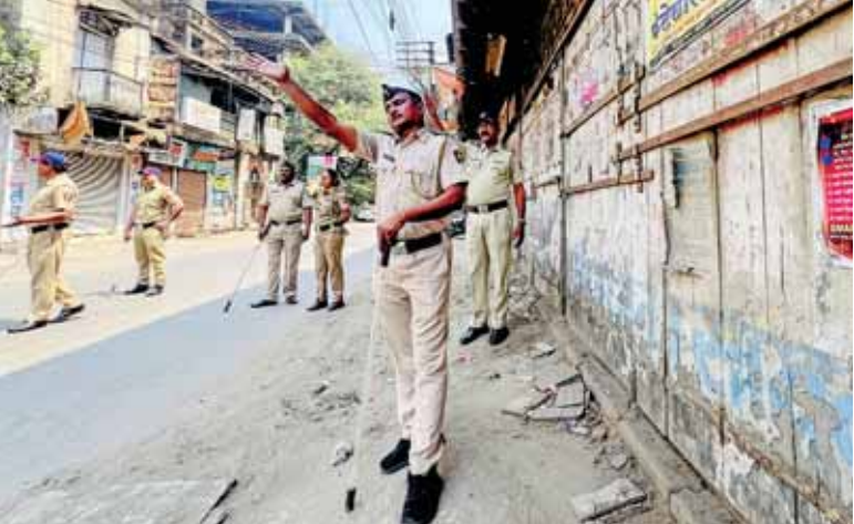
Police personnel deployed to maintain law and order after incidents of clashes following VHP-Bajrang Dal protest demanding removal of Aurangzeb's tomb, in Chitnis Park area in Nagpur

"The successful splashdown of #Crew9, accomplishing a challenging space expedition, is a testament to the power of human resilience. It is an inspiring demonstration of how even the toughest hurdles can be overcome with sheer courage, patience, and dedication," Home Minister Shah said.