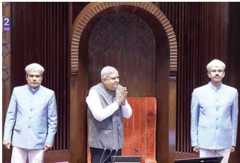
Rajya Sabha Chairman Jagdeep Dhankhar arrives to conduct proceedings in the House during the Budget session of Parliament in New Delhi on Wednesday

"Subsidies, if required in areas like the farm sector, should be direct. That is the practice in developed countries. I