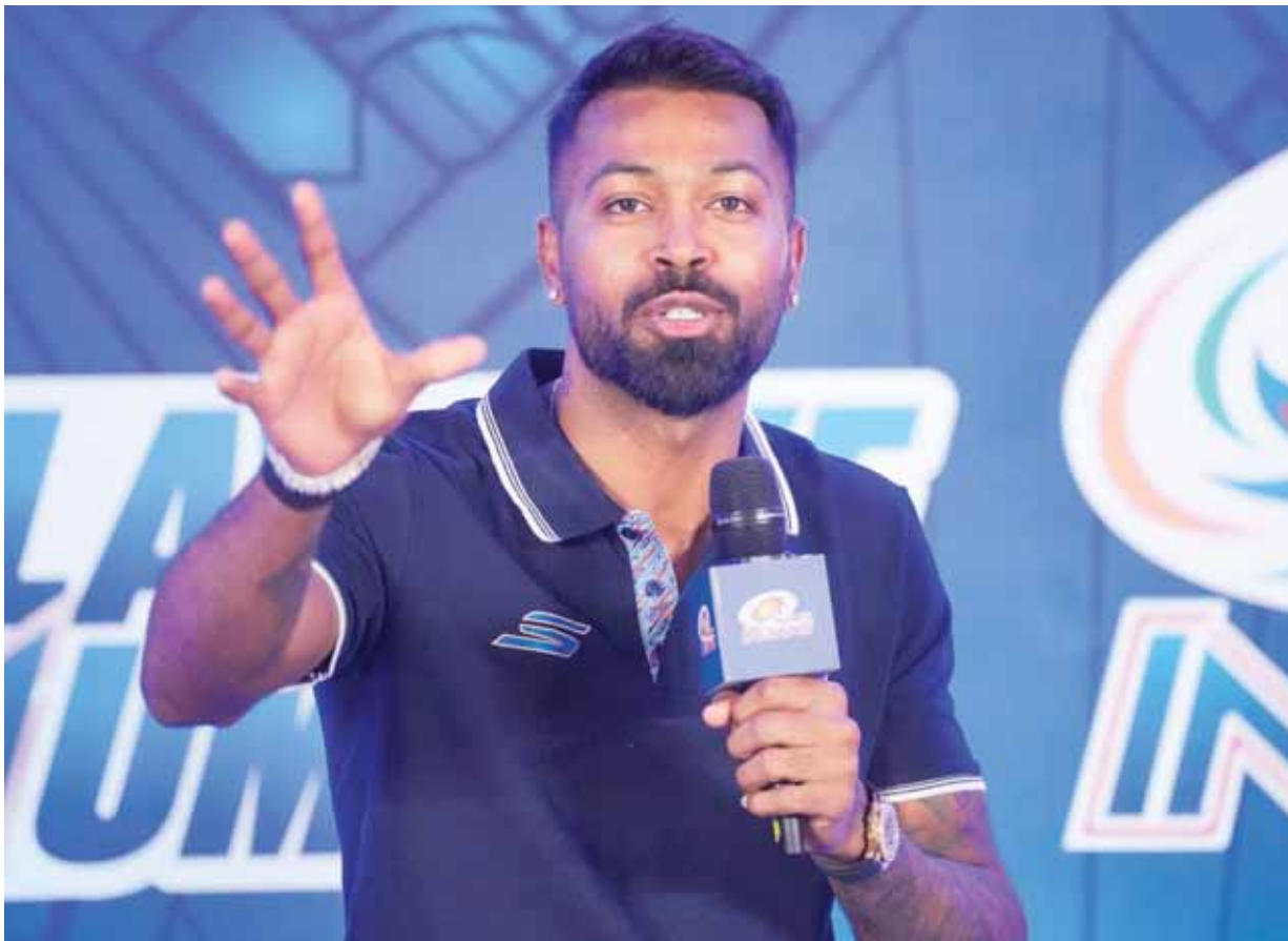
Mumbai Indians captain Hardik Pandya during a press conference ahead of the Indian Premier League (IPL) 2025, in Mumbai

Sitting next to him, head coach Mahela Jayawardene also had his say on