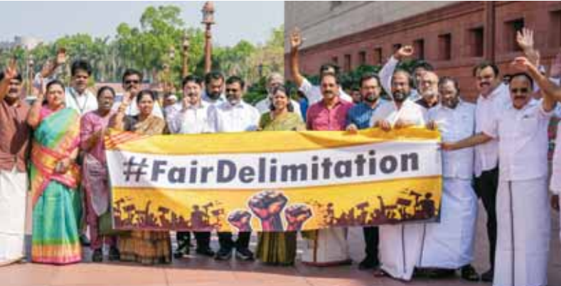
DMK MPs stage a protest over the issue of delimitation of parliamentary constituencies during the Budget session of Parliament in New Delhi on Wednesday

The freeze on population growth was extended through the 84th constitutional amendment following the recommendation of the national population policy in 2000, which expected stabilisation of population growth across all states by 2026, he said. "Data shows that the states like Tamil Nadu have a total fertility rate of 1.7 and Kerala TFR of 1.8 indicating that these states have successfully stabilise