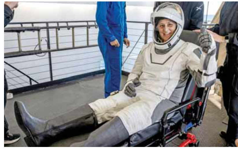
NASA astronaut Sunita Williams gives a thumbs-up after being helped out of a SpaceX capsule onboard the SpaceX recovery ship

Wilmore and Williams ended up spending 286 days in space - 278 days longer than anticipated when they launched. They