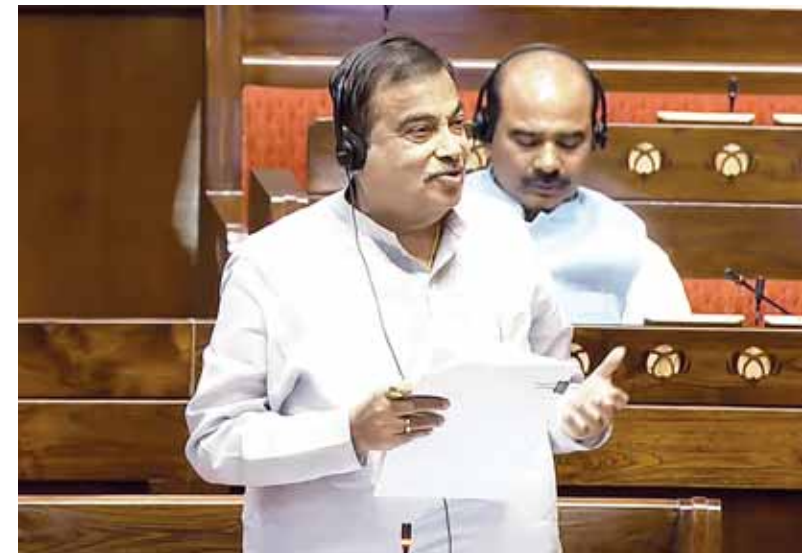
Union Minister Nitin Gadkari speaks in the Rajya Sabha during the Budget session of Parliament in New Delhi on Wednesday

Cabinet also approved the proposal for setting up of a new brownfield Ammonia-Urea Complex of 12.7 Lakh tonnes annual capacity of urea production within the existing premises of Brahmaputra Valley Fertilizer Corporation Ltd (BVFCL), Namrup Assam.