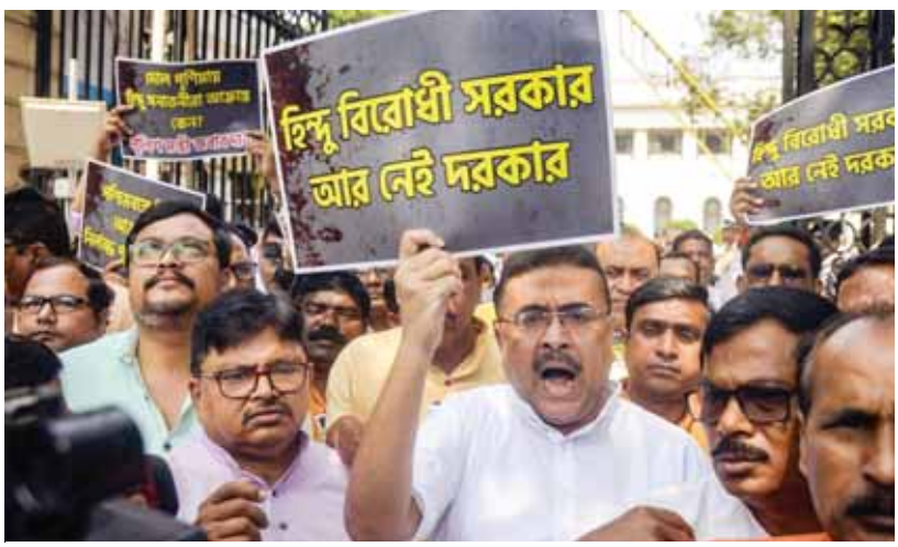
Leader of Opposition in West Bengal Assembly Suvendu Adhikari

This, after his cavalcade was blockaded away and his car was allegedly hit with sticks by slogan-shouting Trinamool Congress workers at Baruipur in South 24 Parganas where he had gone to take part in a pre-announced rally against alleged deprivation of Hindus. In what the critics saw a "too apparent and too clear" an attempt to polarise the State's communal ecology with a specific political agenda ahead of the next year's Assembly elections the Opposition Leader said "let the Election Commission of India decide after today's rumpus created by the hostile, anti-Sanatani goons of the Trinamool Congress whether it is possible to a peaceful election in Bengal without the President's Rule being imposed, today's attack on the BJP workers in presence of the State Police only proves that there is