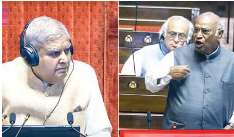
VP Jagdeep Dhankhar during the Budget session of Parliament in New Delhi

He had earlier written to Nadda and Kharge for holding such a meeting for a