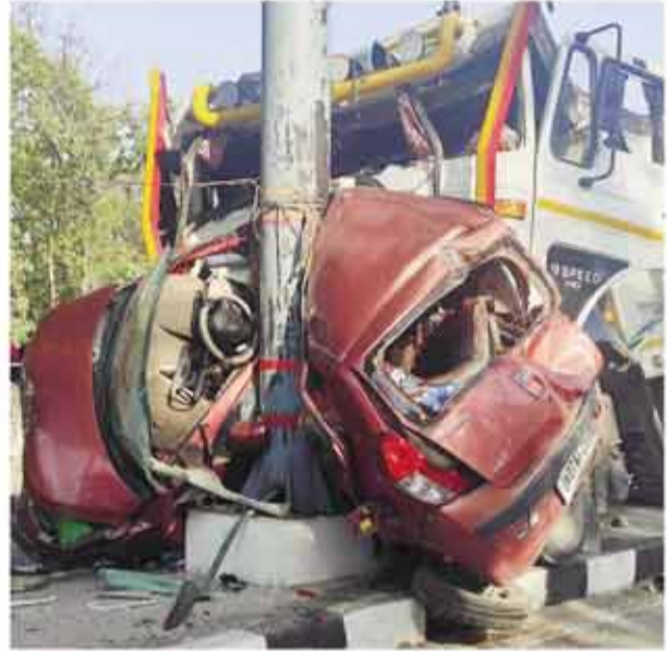
way. The accident reportedly occurred due to brake failure, causing the dumper occupants of the vehicle, Ratanmani Uniyal, a resident of Indraprastha Enclave,

Two people lost their lives on Monday morning when a dumper (UK 18 CA 6636) went out of control and crashed into three vehicles at Lachhiwala toll plaza on the Dehradun-Haridwar high-