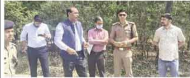
inspection, officials identified key areas requiring improvement to enhance road safety. The officials concerned were directed to increase the number of rumble strips and speed breakers on both sides to control vehicle speed near the toll plaza as the lane markings address overspeeding, which has been a major factor in past accidents, the team suggested installing speed cameras near the toll plaza. Further actions will be taken to implement these measures as part of efforts to improve road safety at the toll plaza, he said.