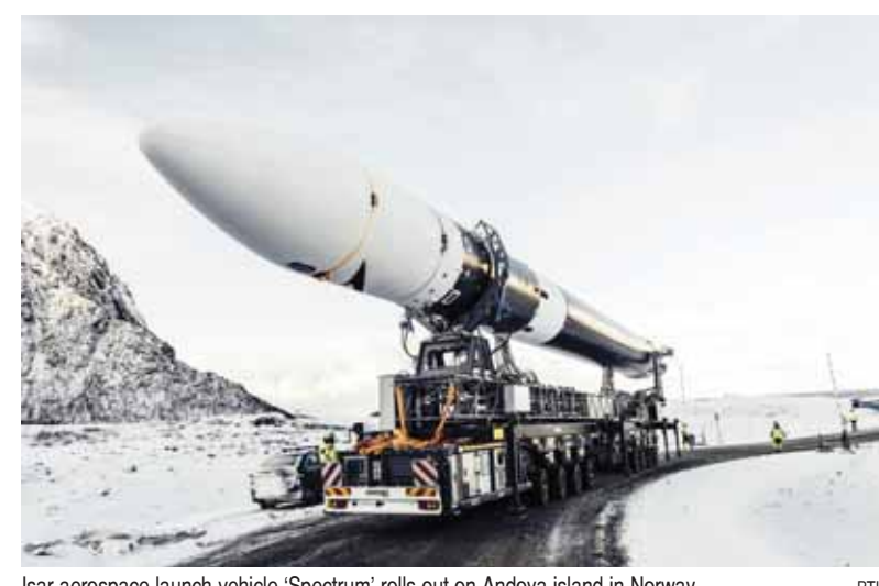
Isar aerospace launch vehicle 'Spectrum' rolls out on Andoya island in Norway

He also pointed out that those who meet Khan make political statements outside the jail in violation of the rules.