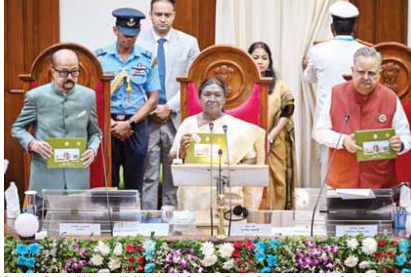
President Droupadi Murmu with Chhattisgarh Governor Ramen Deka and Assembly Speaker Raman Singh during the silver jubilee function of the state Assembly in Raipur

stream of the society has reached its final and decisive stage. I have been told that people of the Naxal-affected areas of Chhattisgarh want to move ahead on the path of development," she said. "I am confident that you (the state) all will soon succeed in your efforts to completely free Chhattisgarh from extremism and add a golden chapter to the history of the state," she added. There are 19 women MLAs in this House. In the 2023 assembly elections, the number of women voters was more than that of men. Thus, this House has received special support from the mothers, sisters and daughters of Chhattisgarh, Droupadi Murmu said. "I request the women MLAs to always be ready to promote all the sisters working in every field of life. When all women promote other women working in various fields of the state, then men will also pay attention and the path will be paved for the development of women, whether she is a teacher, officer, social worker or entrepreneur, scientist or artist, labourer or farmer," President said. "Our sisters make their place in the outside world by struggling hard while fulfilling their day-to-day domestic responsibilities. When all the sisters empower each