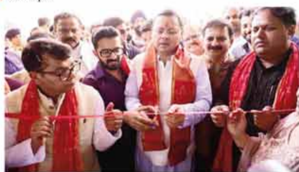
State. Similarly, we have worked consistently to enhance the infrastructure in education, health, drinking water, sports and all other major spheres. We have implemented more than 30 new policies in horticulture, tourism, AYUSH and food processing, among other sectors to speed up development in the State.

Chief minister Pushkar Singh Dhami inaugurated seven development works costing Rs 1,021 lakh and laid the foundation for seven projects costing Rs 2,929 lakh at a programme in Rudrapur on Monday. Earlier, the CM participated in a roadshow and then addressed a gathering to mark his three years in office. In addition to launching the development works, Dhami also handed over keys to shops in the vending zone to 15 economically poor street vendors. To mark his three years in office, CM flagged off nine service publicity vehicles for the nine Vidhan Sabha constituencies in the Udham Singh Nagar district. These vehicles will publicise government schemes as services in each Vidhan Sabha constituency till March 30. Addressing the gathering on the occasion, Dhami said that considering the enthusiastic crowd present at the venue, it is evident that the State government has retained the trust of the people who had elected the BJP to office. "With Prime Minister Narendra Modi's guidance and his support during these three years, our government has worked on 'service, good governance and development'. We have focused on enhancing road connectivity from cities to remote villages on the one hand while also started helicopter services under the UDAN scheme for about a dozen locations in the