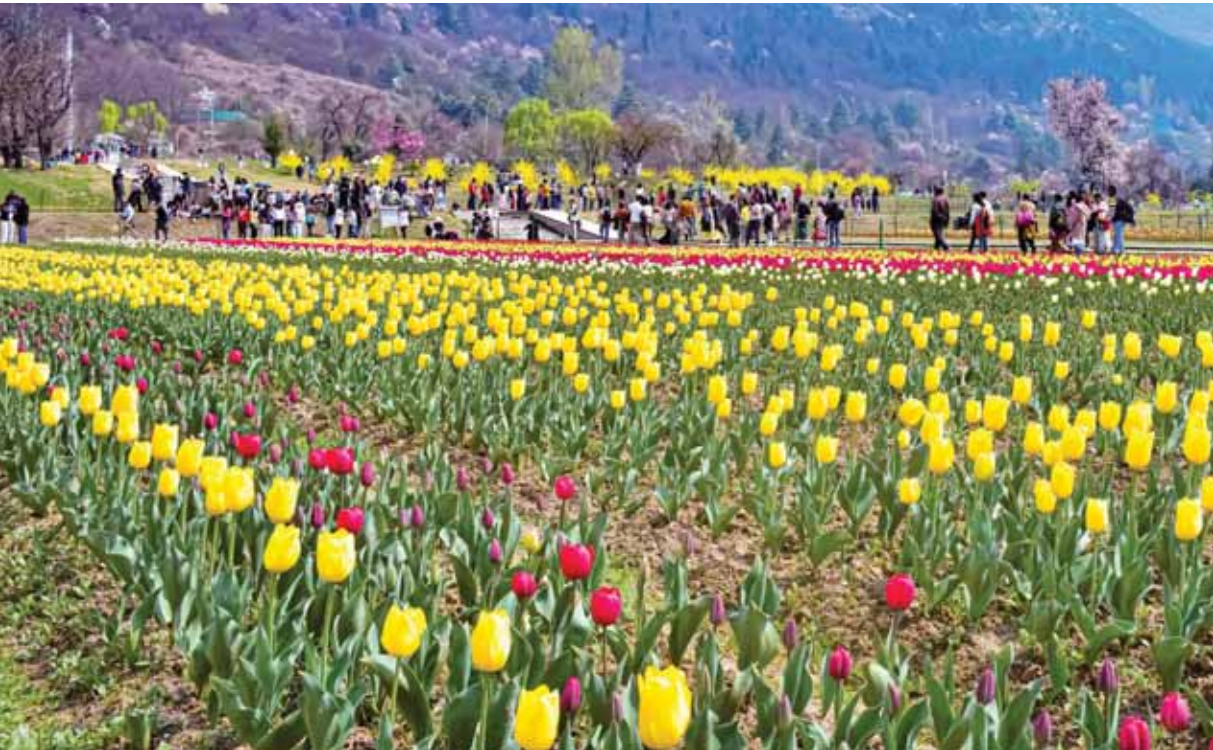
Visitors at Tulip Garden after it was opened for the public in Srinagar on Wednesday

MOHIT KANDHARI ■ Srinagar With over 1.7 million tulips of 74 exquisite varieties in its lap, Asia's largest Tulip garden overlooking the world-famous Dal Lake was thrown open on Wednesday by Chief Minister Omar Abdullah, marking the beginning of the new tourism season in the Valley. "Delighted to throw open Asia's largest Tulip Garden in Srinagar today," the Chief Minister's office posted on X. The Chief Minister, sporting a skull cap and a traditional 'pheran' greeted and interacted with the tourists assembled at the garden to witness the blooming carpet of flowers. He also extended an invitation to tourists from all over the world to make a plan to witness the sublime beauty of