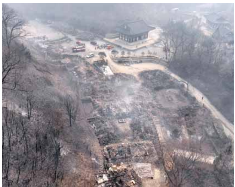
The remains of burnt-out pavilions are seen at the Gounsa temple in Uiseong, South Korea