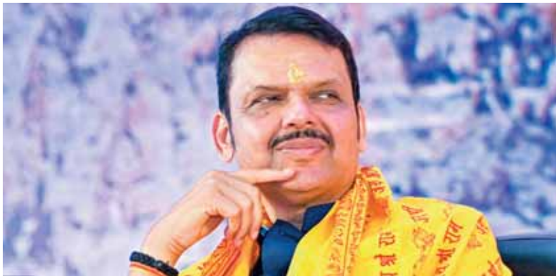
Maharashtra CM Devendra Fadnavis

“The contribution of vehicles (running on petrol or diesel) to air pollution is the highest. A shift towards electric vehicles will help reduce this problem,” the chief minister added. Both private and public transport sectors are increasingly adopting