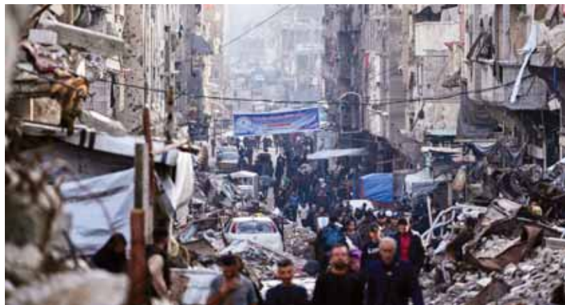
Palestinians walk amid the destruction caused by the Israeli air and ground offensive at Al-Shati camp, Gaza City

He said it started as an anti-war protest with just a few dozen people but then