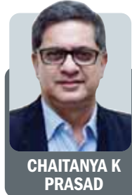
CHAITANYA K PRASAD

A new information order cannot be an abstract idea, it needs a tangible structure. The United Nations General Assembly (UNGA) should spearhead discussions on an international information governance framework, establishing a 'Threshold Agreement for Global Communication'. Such an initiative should include Ethical Standards for AI-generated content to ensure transparency and reduce