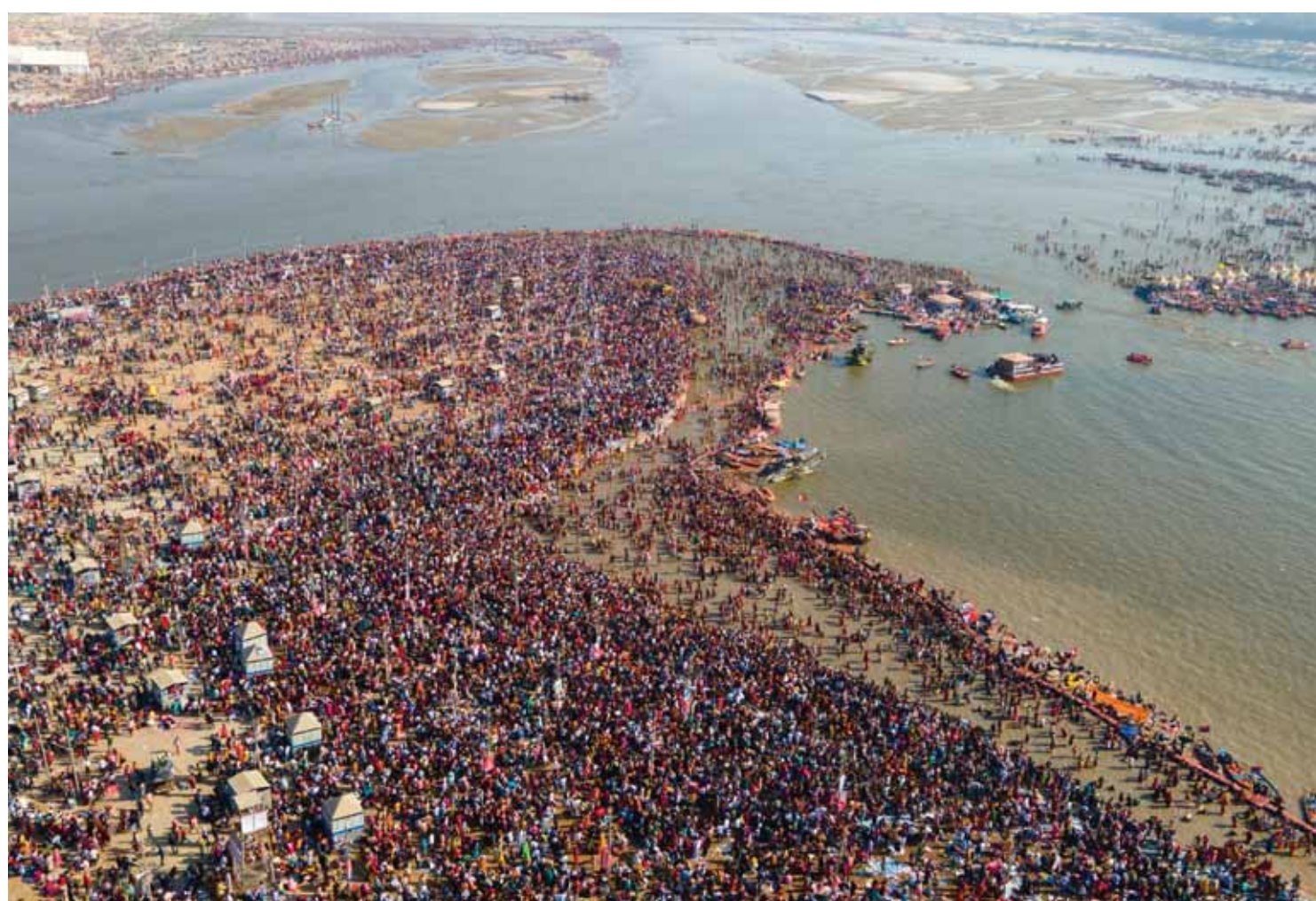
believed that River Saraswati is also part of this Sangam.