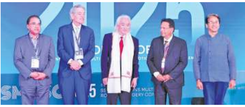
SS Innovations, the maker of India's first and only home-grown Surgical Robotic System - SSI Mantra, hosted the Second Global SSI Multi-Specialty Robotic Surgery Conference (SMRSC) 2025 at the Leela, Gurgaon. The two-day event saw enthusiastic participation from over 1200+ world-renowned medical professionals, who gathered on a single platform to explore the transformative potential of robotic surgery.