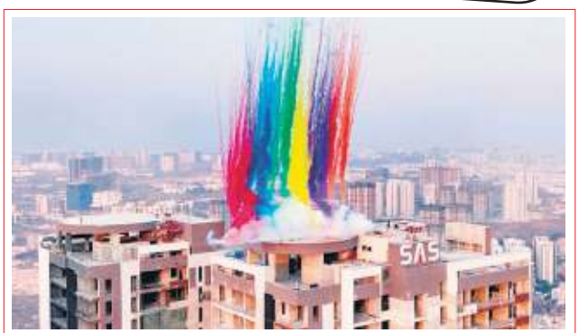
The vibrant festival of Holi reached astonishing new heights this year as SAS Crown, located in Kokapet and renowned as the tallest tower in South India, hosted the "Sky Blast on the Skyscraper" event. This event transformed a routine celebration into a landmark experience, redefined Holi Festivities, and showcased SAS Crown as a magnificent architectural marvel at the forefront of the city's skyline.