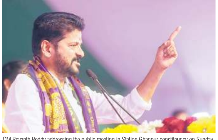
CM Revanth Reddy addressing the public meeting in Station Ghanpur constituency on Sunday

PNS ■ HYDERABAD Taking exception to BRS leader Harish Rao describing the party president K Chandrasekhar Rao as 'Father of Telangana', Chief Minister A Revanth Reddy on Sunday asked how Rao can be compared with Father of the Nation Mahatma Gandhi. Addressing a public meeting at Station Ghanpur after attending development programmes, Revanth Reddy referred to the comments of Harish Rao, a nephew of Chandrasekhar Rao. While KCR made a name for himself as 'Father of Telangana' in view of his struggle for achieving Telangana statehood, Revanth Reddy came to be known as 'father of filthy language', Harish Rao said. Harish Rao objected to the chief minister's attack against KCR in the Assembly on Saturday. Lamproving Harish Rao's remarks,