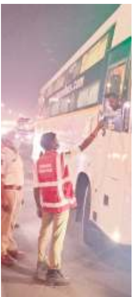
Cyberabad Traffic Police conducting a drunk-driving operation