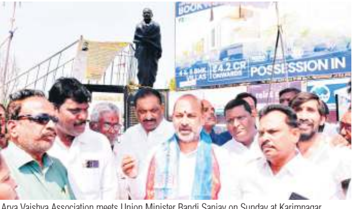
Arya Vaishya Association meets Union Minister Bandi Sanjay on Sunday at Karimnagar objecting to removal of Potti Sriramulu's Name to Telugu University