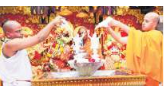
The 539th appearance day of Sri Chaitanya Mahaprabhu, the incarnation of Lord Krishna in Kaliyuga, was celebrated with grandeur at the ISKCON temple in Attapur, Hyderabad. The temple echoed with the chanting of the "Hare Krishna" Mahamantra, as nearly 10,000 devotees participated in the festivities. Sri Chaitanya Mahaprabhu, who spread the Hare Krishna Mahamantra through Sankirtan, emphasized it as a path to peace, joy, and spiritual liberation, making it renowned as the Mahamantra.