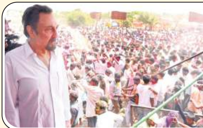
The annual Holi celebrations at Raunaq's H.I.G.H. Bhoot Bangla, Ghuttala Estate, Jubilee Hills was held by the 9th Nizam of the Asaf Jahi Dynasty of Hyderabad. This grand event was organized in memory of his great-grandfather, renowned as one of the most secular rulers of the Nizam era