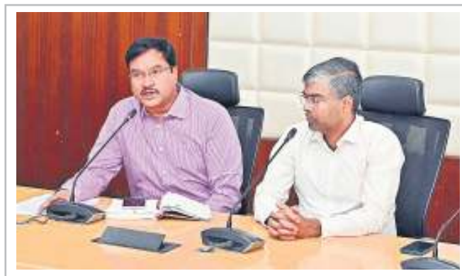
HYDRAA and GHMC Commissioners addressing a monsoon session meeting

Regional committees will be established consisting of Traffic, HYDRAA and GHMC officials to