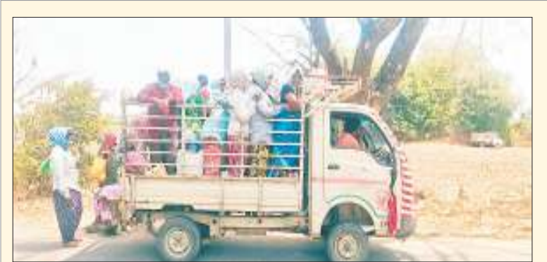
A mini truck crammed with people