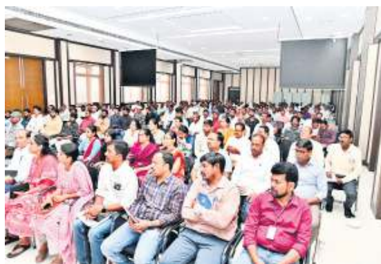
Electrical engineers participating in a training session

During the session, Commissioner Ilambarithi explained that the Street Light Maintenance System App will be used to register and track streetlight assets, including: electric meters, centralised control and monitoring system panels, streetlights and poles.