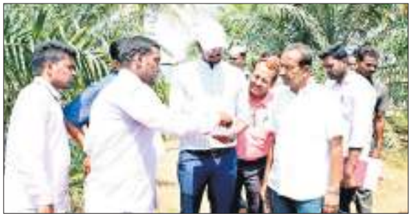
Wanaparthy Collector Adarsh Suabhi inspecting damage to crops due to unseasonal rains at Sankireddypally village in Wanaparthy district on Tuesday