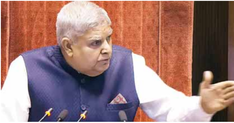
Rajya Sabha Chairman Jagdeep Dhankhar conducts proceedings of the House during the Budget session of Parliament in New Delhi

"I request that you please make some observations on this and give necessary directions to the government to come up with a proposal for increasing judicial