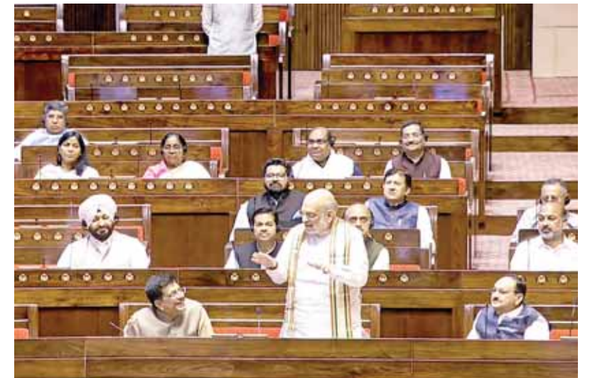
Union Home Minister Amit Shah speaks in the Rajya Sabha during the Budget session of Parliament in New Delhi

The home minister did not speak on the violence in Manipur, saying he would deliberate on the issue in detail when imposition of President's Rule in the