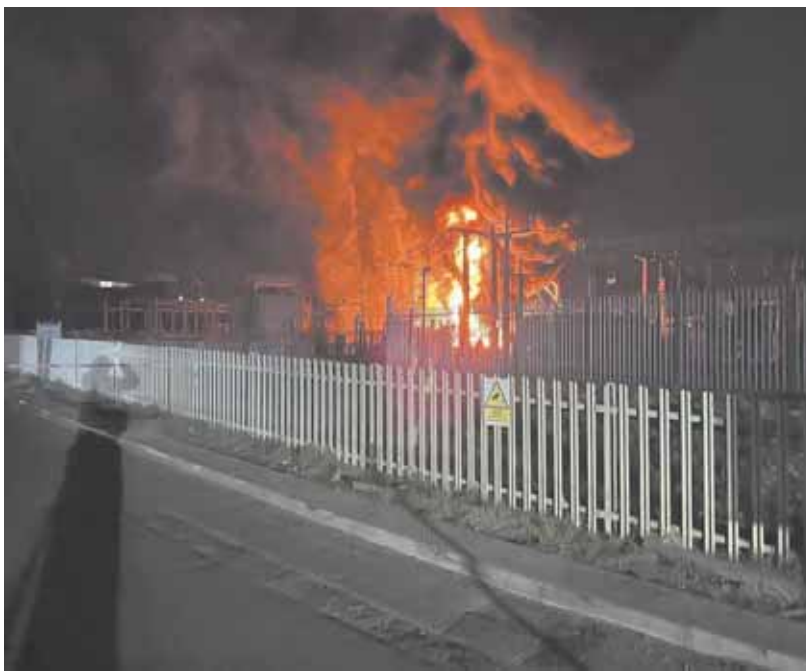
This photo provided by London Fire Brigade, shows a fire at the North Hyde electrical substation, which caught fire Thursday night and led to a closure of Heathrow Airport in London, on Friday. AP/PTI

Unclear what caused the fire but foul play not suspected: It was too early to determine what sparked the huge blaze about 2 miles (3 kilometers) from the air-