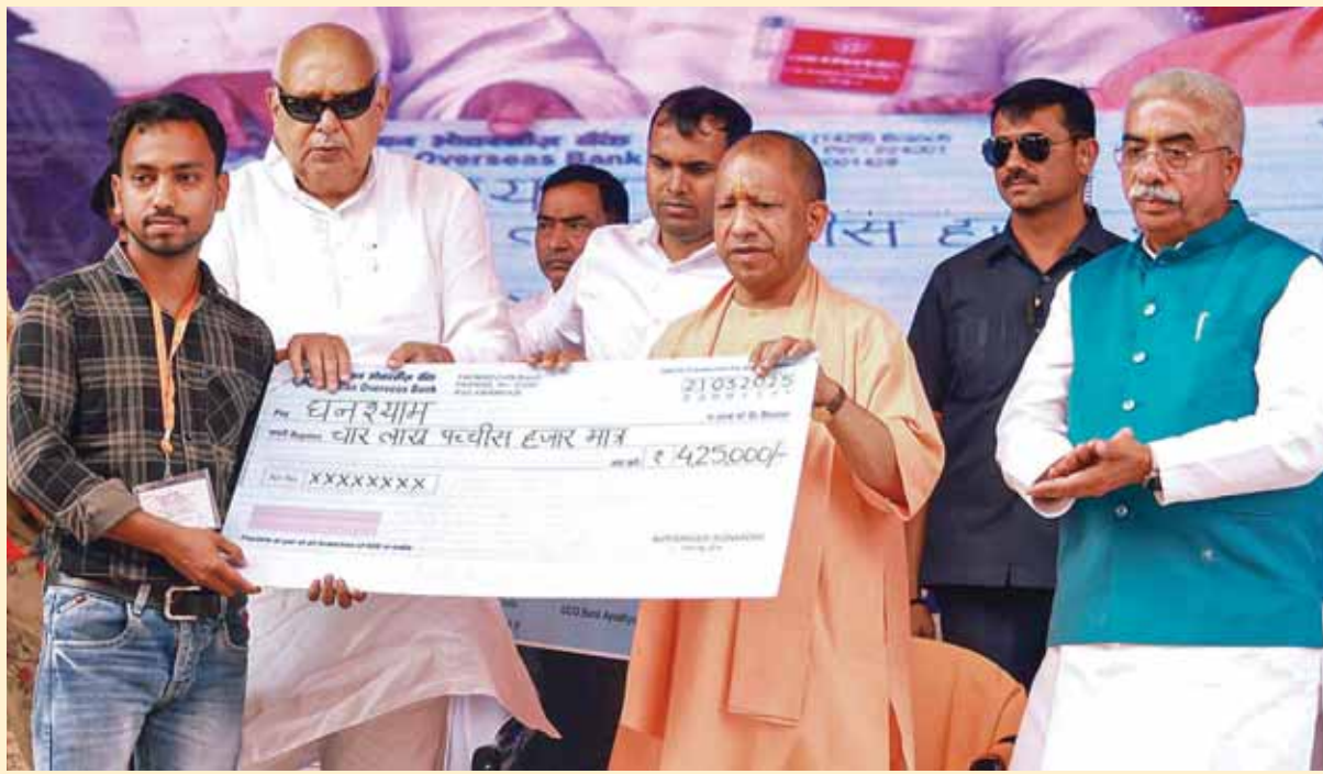
Uttar Pradesh CM Yogi Adityanath during distribution of cheques to entrepreneurs of Ayodhya under the Chief Minister Youth Entrepreneur Development Campaign.

Chief Minister Yogi added that just as Maharishi Valmiki immortalised the Ram Katha, every creation associated