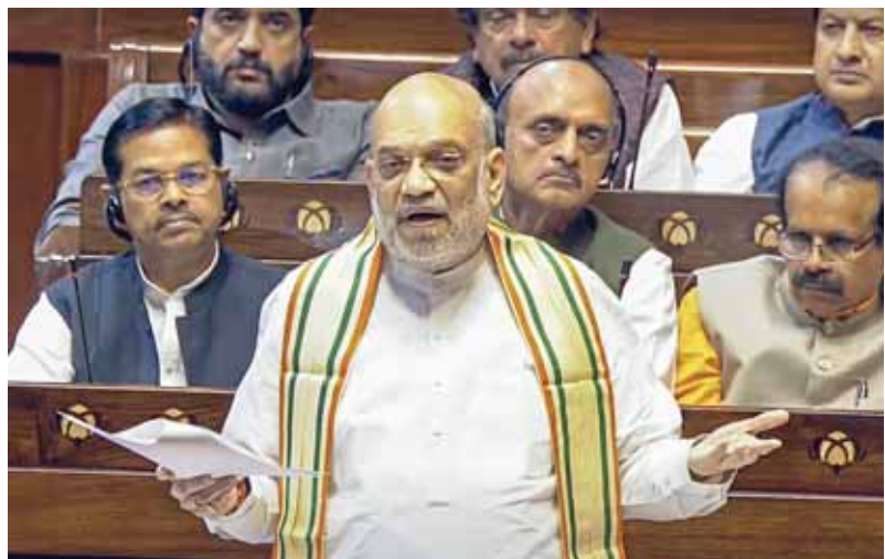
Home Minister Amit Shah speaks in the Rajya Sabha during the Budget session of Parliament

Those who take shelter behind the language issue to hide their corruption, this is a strong reply to them. "There have been enough divisions in the nation in the name of language, and it should not happen anymore," he said, amid the escalat-