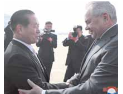
This photo provided by the North Korean government shows Russia's Security Council secretary, Sergey Shoigu, right, who arrived at Pyongyang Airport being greeted by Party Secretary Park Chung-cheon on Friday, March 21, 2025.

North Korea has been supplying a vast amount of conventional weapons to Russia, and last fall it sent about 10,000 to 12,000 troops to Russia as well, according to US, South Korean and Ukraine intelligence officials. In late February, South Korea's spy agency said North Korea appeared to have sent additional troops to Russia. South Korean media put the number of newly sent North Korean soldiers at about 1,000 to 3,000. South Korea, the US and others suspect North Korea is receiving economic and military assistance from Russia in return for providing weapons and troops. Many experts say North Korea will likely ramp up its support of Russia to win as much benefits as possible from Russia before the war ends. Shoigu's trip could be related to Kim's possible trip to Russia, some observers say.