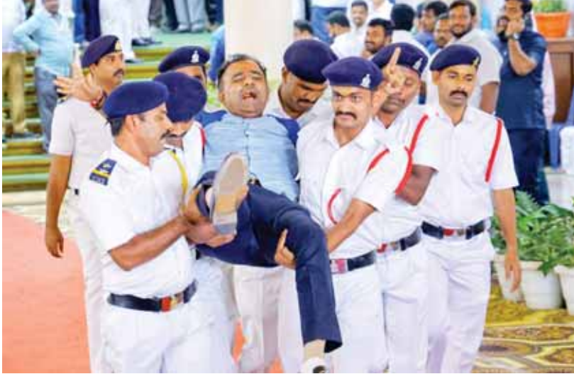
A BJP MLA being evicted by Marshals during the Budget session of Karnataka Assembly in Bengaluru on Friday

As the suspended legislators remained in the assembly, they were forcefully evicted by marshals. Leader of Opposition, R Ashoka condemned the resolution, saying that the government should be ashamed after Minister KN Rajanna raised the issue of “honey trap” and it failed to protect him. A similar display of unruly behaviour was witnessed in the Legislative Council, where BJP MLCs tore the bill and