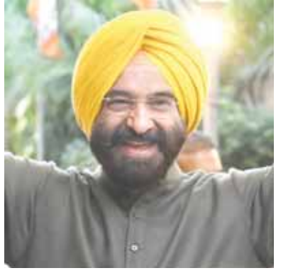
Delhi food and supply minister Manjinder Singh Sirsa

Traders raised concerns about the licensing process and said vendors selling sweets and snacks must obtain an FSSAI licence, yet a separate health licence from the Delhi Municipal