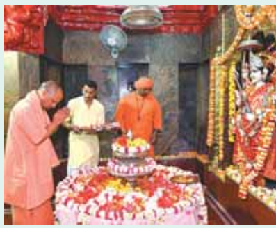
Chief Minister Yogi Adityanath offers prayers at the Adishakti Maa Pateshwari Devi Shaktipeeth, in Balrampur.

The chief minister recalled his visit to Amethi last year, where he inaugurated a beverage and bottling plant by the Ladhani family. He emphasised that this major investment created thousands of jobs, and now a similar initiative is taking shape in Ayodhya. Describing Ayodhya as the capital of the Suryavansh dynasty, Chief Minister Yogi praised the double-engine government's efforts in developing the city under the guidance of Prime Minister Narendra Modi. He pointed out that Ayodhya has been transformed into India's first solar city, with the new bottling plant incorporating a 15 MW solar panel system to promote green energy. "This initiative will help reduce