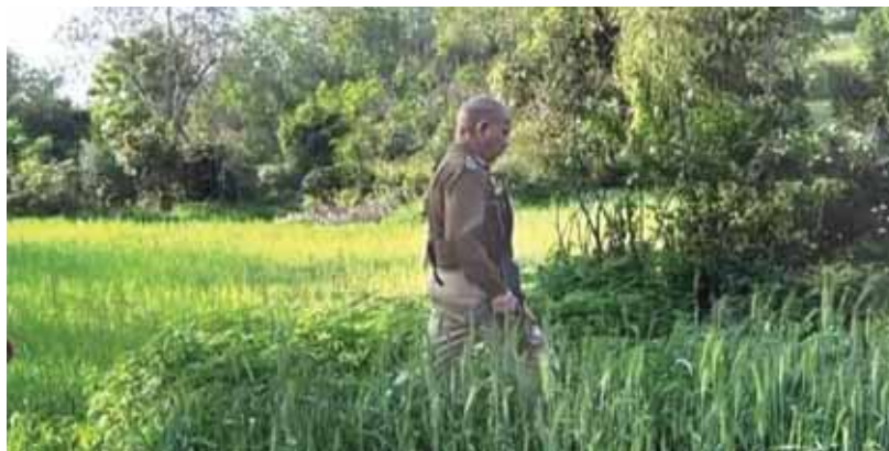
Despite taking all necessary precautions, the DGP was not seen wearing a bulletproof vest and protective headgear (patka) to ensure his safety

According to preliminary reports, an alarm was raised by a couple who claimed to have spotted a group of five terrorists in the nearby forests while they were out there to collect firewood. DGP also inter-