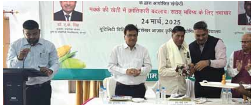
Kanpur

A one-day seminar on the topic "Revolutionary changes in maize cultivation: Innovations for a sustainable future" was organised at the farmers auditorium of the Directorate of Extension, Chandra Shekhar Azad University of Agriculture and Technology