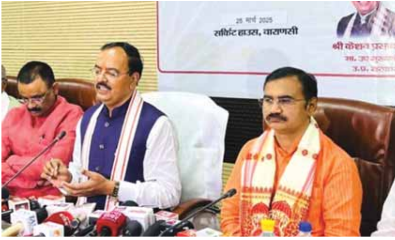
DyCM KP Maurya addressing a press conference in Varanasi on Tuesday.

He said that 1.56 crore women of UP were benefited under the Ujjwala scheme. In 2016, the unemployment rate of the state was 18 per cent, which has now come down to 2.5 per cent. He described the 'Har Ghar Nal Yojana' as the world's largest scheme in which 2.37 houses only in UP have been given their water connections. Maurya said in Kashi during the last eight years, 458 projects related to roads, bridges, drinking water, sewerage, STP, education, health, energy, tourism, urban development and police welfare etc costing more than ₹40,536 crore have been