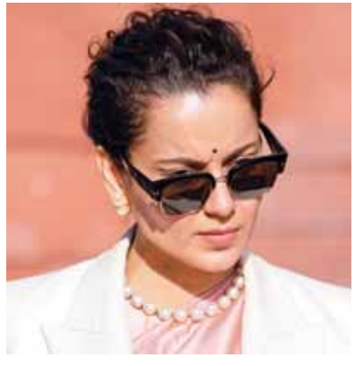
BJP MP Kangana Ranaut stands outside Parliament during the Winter session in New Delhi

"You may be anyone but disrespecting anyone is not good." You are disgracing someone in the name of comedy, you are