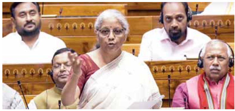
Union Minister Nirmala Sitharaman speaks in the Lok Sabha during the Budget session of Parliament in New Delhi