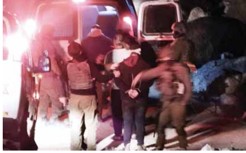
Hamdan Ballal, Palestinian co-director of Oscar-winning documentary 'No Other Land' detained by the Israeli military

The film has won a string of international awards, starting at the Berlin International Film Festival in 2024. It has also drawn ire in Israel and abroad, as when Miami Beach proposed ending the lease of a movie theatre that screened the documentary.