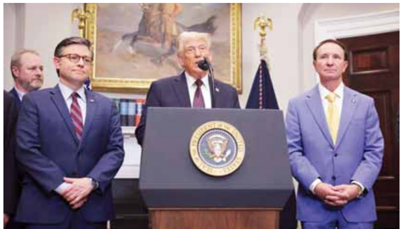
President Donald Trump