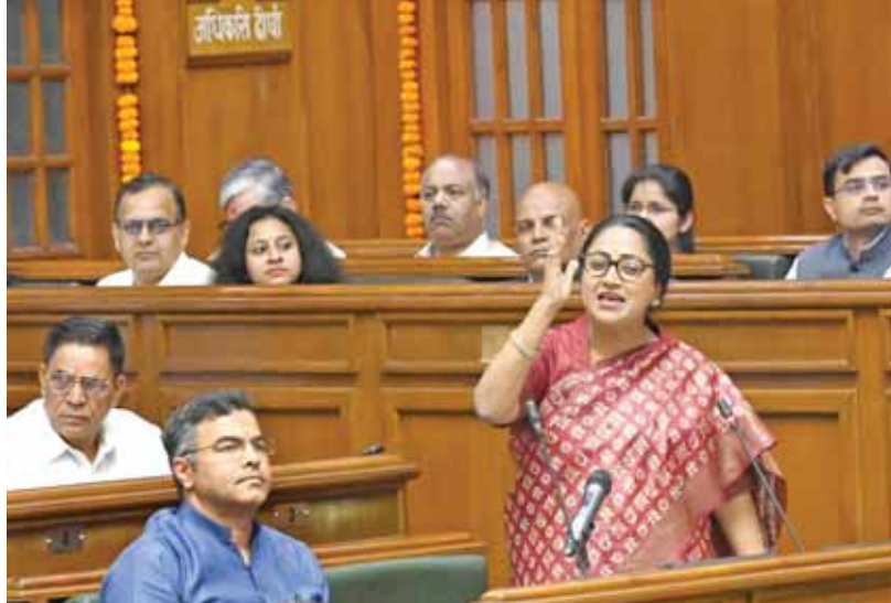
Delhi Chief Minister Rekha Gupta presents the Budget 2025-26

"The Budget Estimates in 2025-26 of ₹One Lakh Crore is 31.5 per cent more than the Budget estimates 2024-25 of ₹76,000 Crore and 44 per cent higher than the revised estimates 2024-25 of ₹69,500 Crore. The proposed Budget of ₹ One Lakh Crore for the year 2025-26 is to be financed from the Tax Revenue of ₹68,700 Crore, Non-Tax Revenue of ₹750 Crore, Small Savings Loan of ₹15,000 Crore from, Central Road Funds of ₹1,000 Crore from, Centrally Sponsored Schemes of ₹4,128 Crore, Grant in Aid from Government of India of ₹7,348 Crore and