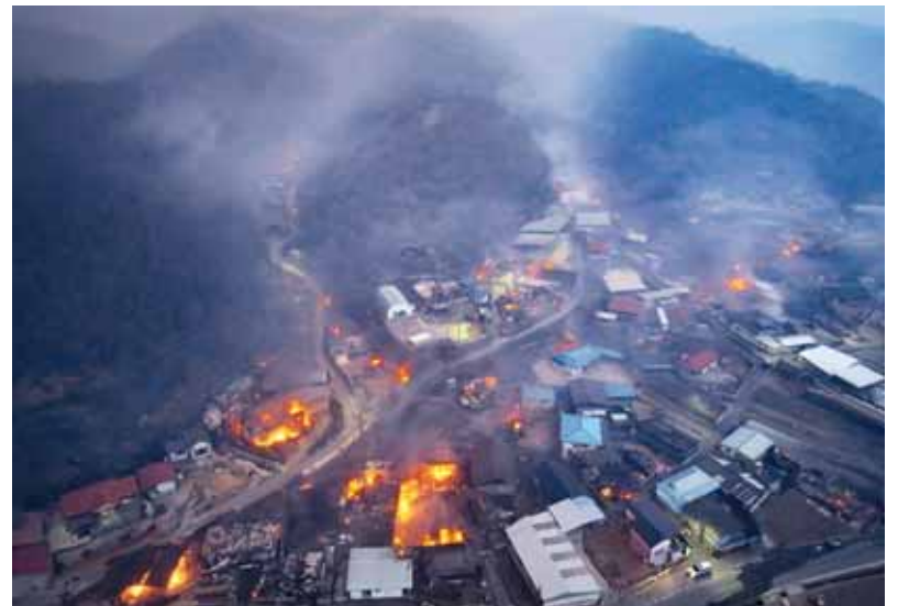
Houses burn in a village after being engulfed by a wildfire fueled by strong winds in Uiseong, South Korea

South Korean officials said earlier on Tuesday that firefighters had extinguished most of the flames from the largest