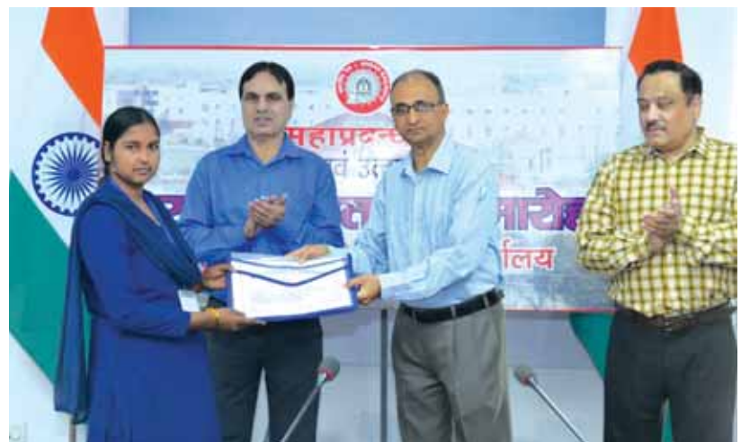
Prayagraj