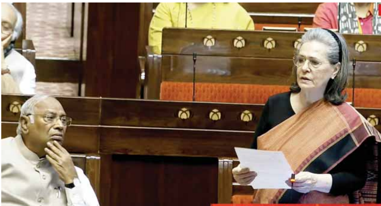
Congress MP Sonia Gandhi speaks in the Rajya Sabha during the Budget session of Parliament in New Delhi on Tuesday

The National Mobile Monitoring System (NMMS) app permits taking real-time attendance of workers at Mahatma Gandhi