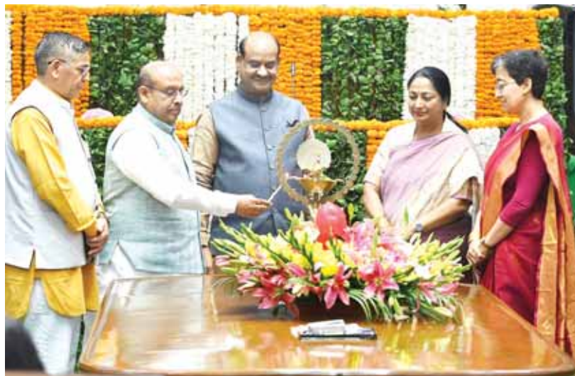
Lok Sabha Speaker Om Birla being welcomed by Delhi Chief Minister Rekha Gupta and Assembly Speaker Vijender Gupta upon his arrival for the inauguration of a two-day orientation programme for the newly-elected Delhi MLAs in New Delhi on Tuesday

be innovative in solving problems in their constituencies and said that "transparen-