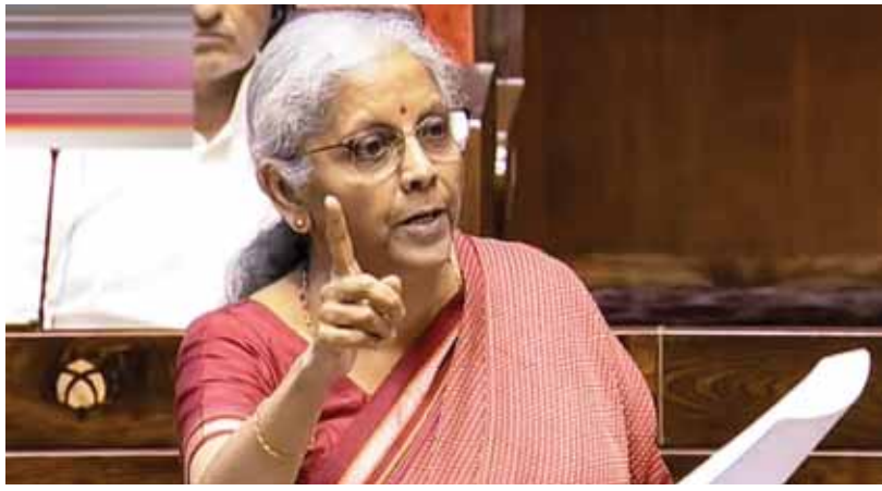
Finance Minister Nirmala Sitharaman

She said violence in Manipur has adversely impacted economic activities in the state but expressed confidence that it will recover swiftly. Responding to the Opposition criticism of not paying the required focus to Manipur, she said the