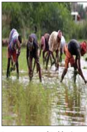
Department and Public Service Centre were organising camps, door-to-door campaigns and awareness drives for this.