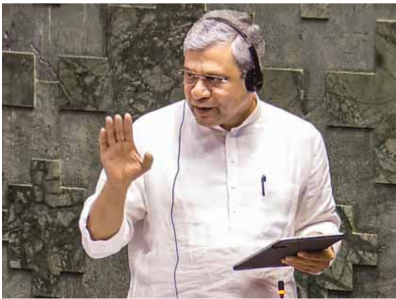
Union Minister Ashwini Vaishnav speaks in the Lok Sabha during the Budget session of Parliament in New Delhi on Tuesday

During Mamata Banerjee's period, 165 accidents and 230 derailments took the accident tally to 395 in a year and during