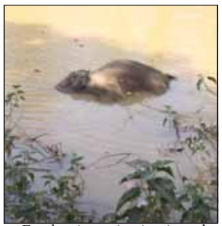
Further investigation into the matter was underway. In the last six years, nearly 90 elephants have died due to ailments, old age and electrocution in Chhattisgarh.