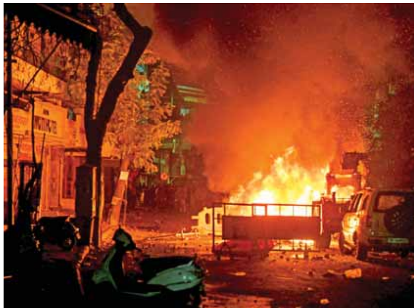
A fire set by miscreants amid violence following an agitation by a right-wing group demanding removal of Aurangzeb's tomb, in Nagpur

Making a statement in the Maharashtra Assembly, the chief minister said: "After the morning incident, there was peace in Nagpur. However, some people indulged in violence on Monday night in a pre-planned manner. We found a trolley full of stones and weapons were also found. The mob targeted specific houses and establishments. It (the attack) appears to be a premeditated conspiracy. We will not spare those behind the violence. The