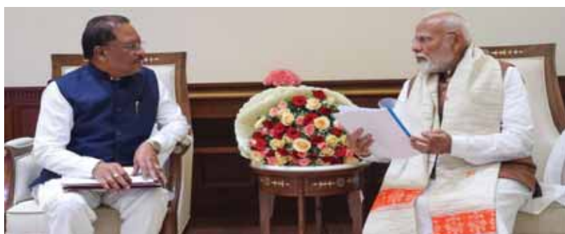
STAFF REPORTER ■ RAIPUR/NEW DELHI

Chhattisgarh Chief Minister Vishnu Deo Sai on Tuesday met Prime Minister Narendra Modi in New Delhi and discussed the development roadmap of the tribal heartland Bastar, a state government statement informed.