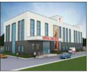
cial communique said on Tuesday. The hospital will be equipped with all modern medical facilities and high-level technical equipment and is going to be built near the district hospital in two years. It will cost about Rs 36.35 crore. The Chhattisgarh

A 75-bed critical care hospital will come up in Chhattisgarh's Bilaspur district as part of the Pradhan Mantri Bharat Ayushman Health Infrastructure Mission, an offi-