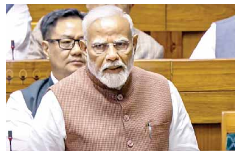
Prime Minister Narendra Modi speaks in the Lok Sabha during the Budget session of Parliament

Witkoff and White House press secretary Karoline Leavitt suggested that US and Russian officials have discussed the fate of the Zaporizhzhia nuclear power plant - Europe's largest - in southern Ukraine.