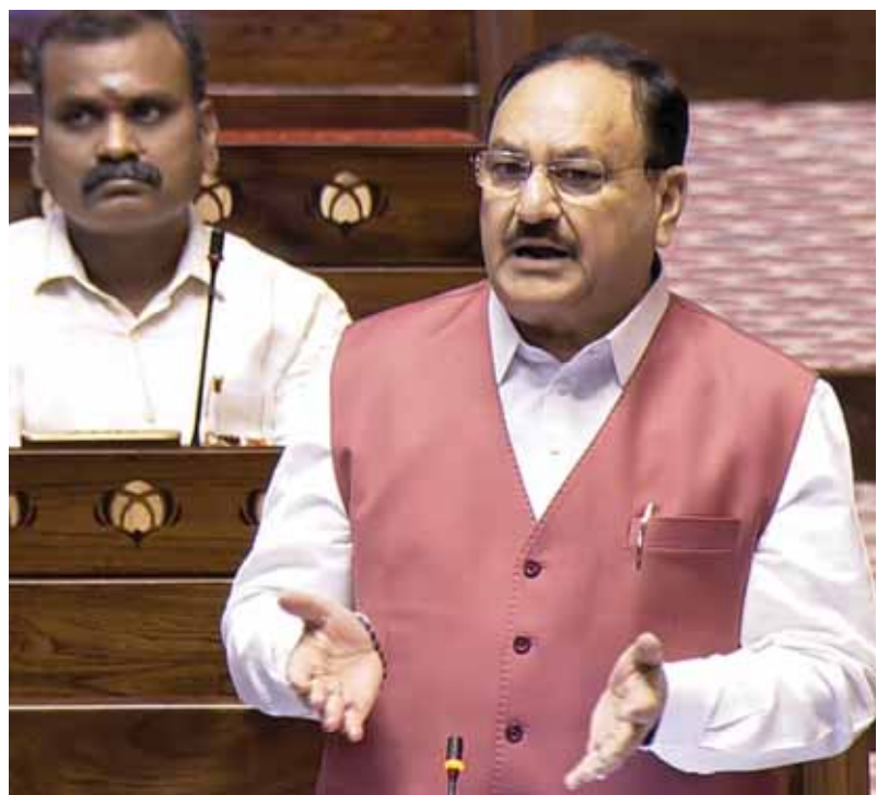
Union Minister JP Nadda speaks in the Rajya Sabha during the Budget session of Parliament in New Delhi on Tuesday

The minister said the scheme provides for the sale of generic medicines at 50 per cent to 80 per cent price of branded medicines through Janaushadhi Stores and the