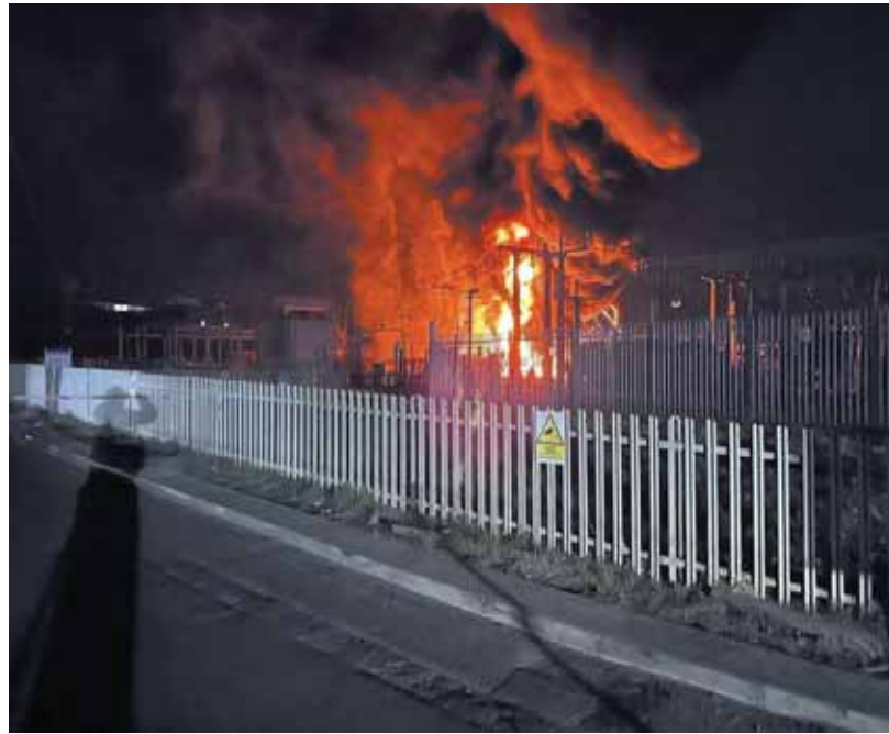
This photo provided by London Fire Brigade, shows a fire at the North Hyde electrical substation, which caught fire Thursday night and led to a closure of Heathrow Airport in London, on Friday

Unclear what caused the fire but foul play not suspected: It was too early to determine what sparked the huge blaze about 2 miles (3 kilometers) from the air-