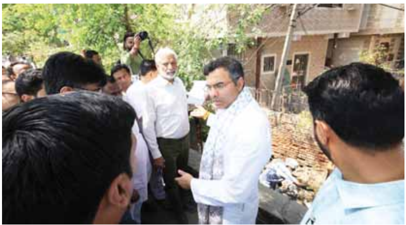
PWD Minister Parvesh Verma

On the other hand, the bureaucrats feel that the current BJP government is acting like the previous AAP government which targeted the bureaucracy during the 10 years rule. The trouble began when Delhi Assembly Speaker Vijendra Gupta criticised the civil servants for allegedly ignoring the grievances of MLAs. This was