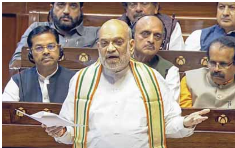
Home Minister Amit Shah speaks in the Rajya Sabha during the Budget session of Parliament

Shah also said that after December, he will do all correspondence with chief ministers, MPs and common people in their respective languages.