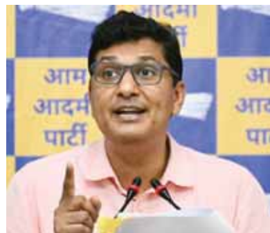
AAP leader Saurabh Bhardwaj