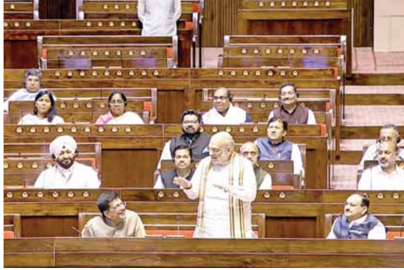
Union Home Minister Amit Shah speaks in the Rajya Sabha during the Budget session of Parliament in New Delhi

"There was a time when bomb blasts were routine. I want to tell the people of the country that, for the last 10 years, the series of bomb blasts have stopped. No one can now dare carry out bomb blasts. The country is safe under Narendra Modi. We are committed to uprooting terrorism," he said in the Rajya Sabha. Referring to the 2008 Mumbai terror attack, he said terrorists earlier easily entered the country, attacked hotels and railway stations, and escaped. "But no action was taken," the home minister said. There is peace in Kashmir, the majority of terrorists in the northeast have surrendered, and the country is moving forward under the leadership of Modi, he added. "With strong political willpower and strong management of Modi ji, the country is safe now. The opposition should not be worried. We will keep you (opposition) as well as the country safe," Shah said. The home minister did not speak on the violence in Manipur, saying he would deliberate on the issue in detail when imposition of President's Rule in the