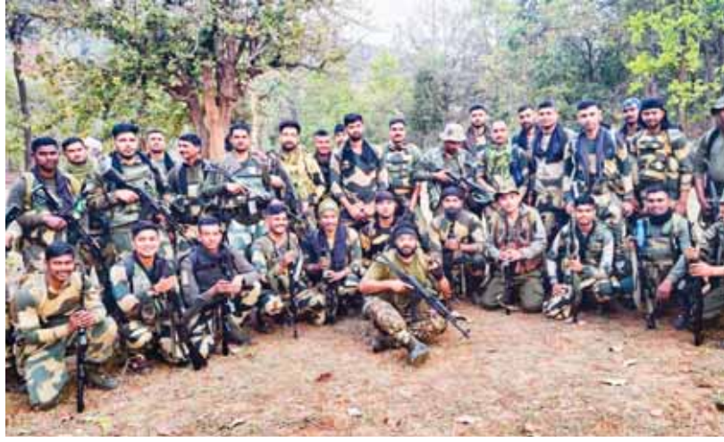
Security personnel after an operation against Naxalites in Chhattisgarh's Kanker