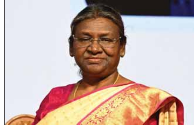
She will then proceed to the Chhattisgarh Assembly at 10:45 am and will reach there at 11:05 am. The time between 11:05 and 11:15 am is reserved. From 11:15 to 12 noon, she will participate in the orientation programme of state legislators.

As per her itinerary, she will reach Swami Vivekananda Airport in Raipur by a special aircraft at 10:35 am on Monday, government officials