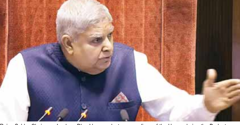
Rajya Sabha Chairman Jagdeep Dhankhar conducts proceedings of the House during the Budget session of Parliament in New Delhi

"I request that you please make some observations on this and give necessary directions to the government to come up with a proposal for increasing judicial