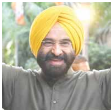
Delhi food and supply minister Manjinder Singh Sirsa

Delhi's Food and Supplies Minister Manjinder Singh Sirsa met officials from the Chamber of Trade and Industry (CTI) to discuss key reforms, including a new food policy, cloud kitchen regulations, and streamlining multiple food licences. The meeting focused on implementing a single-window system to improve the Ease of Doing Business in the food sector. During the discussion on Thursday, Sirsa highlighted the need for a dedicated cloud kitchen policy in Delhi and simplification of food licence procedures, as per a statement. He said these measures would not only create more jobs but also provide greater convenience to the public. Additionally, he proposed setting up food trucks at 20 public locations where food and water would be available 24/7.