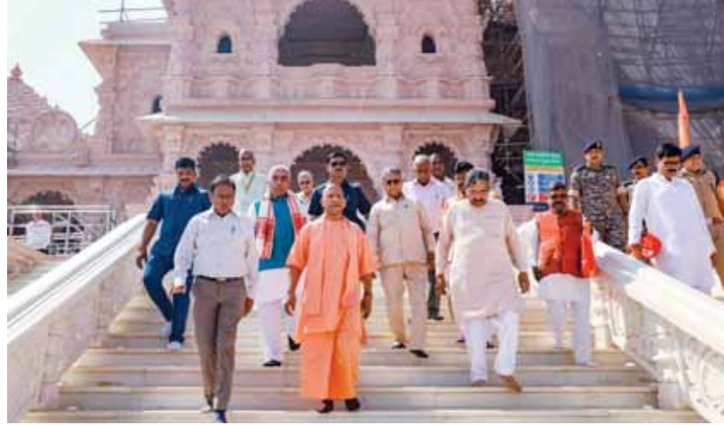
Uttar Pradesh CM Yogi Adityanath at the Ram Mandir in Ayodhya