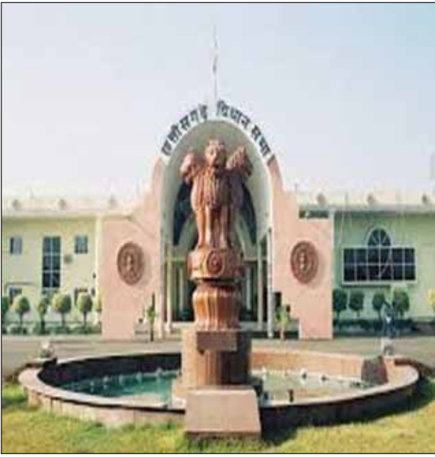
How is it possible that the government has procured 36 percent more paddy than its total production in the state?"

"As per the Agriculture Department's report, the total production of paddy in the state this Kharif season was 110.11 lakh metric tonnes.