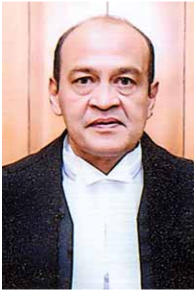
Justice Yashwant Varma