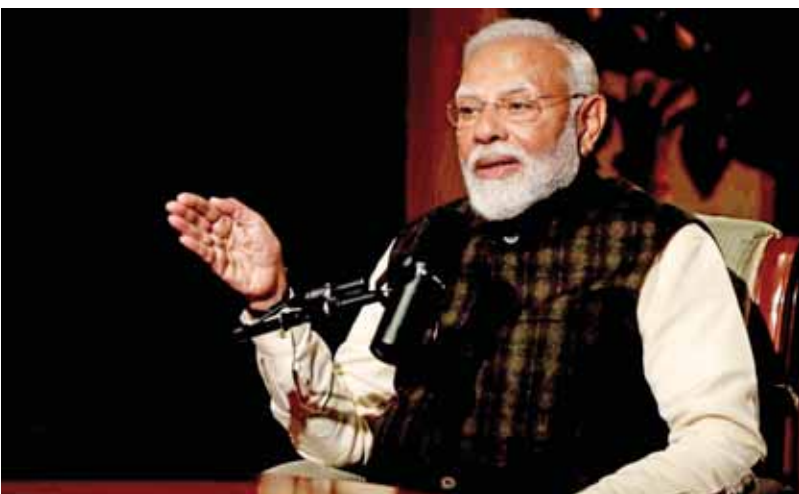
Prime Minister Narendra Modi during a podcast with Lex Fridman in New Delhi

"Yet, every noble attempt at fostering peace was met with hostility and betrayal. We sincerely hope that wisdom prevails upon them and they choose the path of peace," the Prime Minister said in his over three-hour interaction. Modi said he believed that even the people of Pakistan long for peace because they also must be tired of living in strife, unrest and relentless terror where even innocent children are killed and countless lives are destroyed. The Prime Minister said