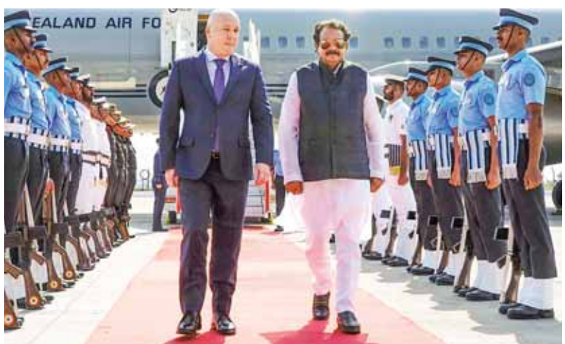
New Zealand Prime Minister Christopher Luxon being received by MoS SP Singh Baghel upon his arrival, New Delhi PTI

The New Zealand Prime Minister also described India as an "important" power