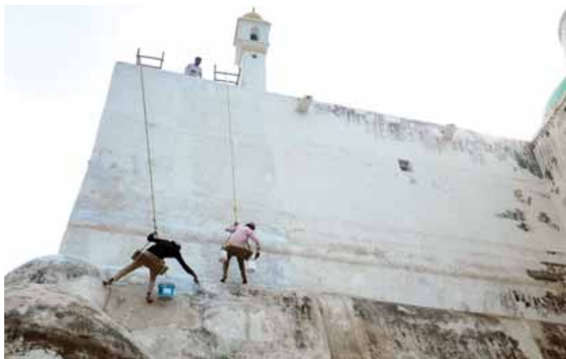
Labourers whitewash the outer wall of the Shahi Jama Masjid following an Allahabad High Court directive to the ASI to complete the task in Sambhal in Uttar Pradesh.