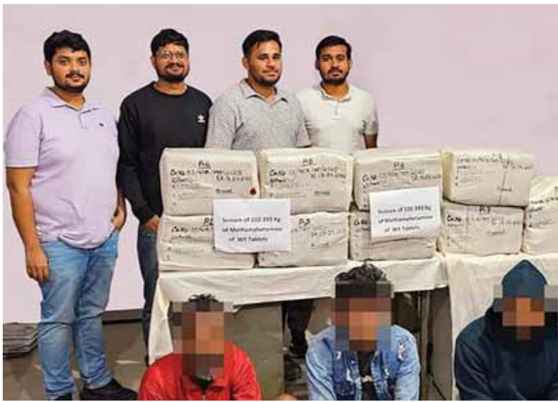
Consignment of Methamphetamine tablets worth ₹88 crore seized by Narcotics Control Bureau

The NCB team intercepted a truck near the Lilong area and recovered 102.39 kg of Methamphetamine tablets from a toolbox in the rear section of the truck, according to an official statement. Two occupants of the truck were arrested, it added. Without delay, the team immedi-