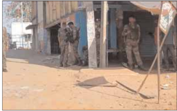
PNS : RANCHI

Tension was also in Namkum area of Ranchi as two groups clash at liquor shop