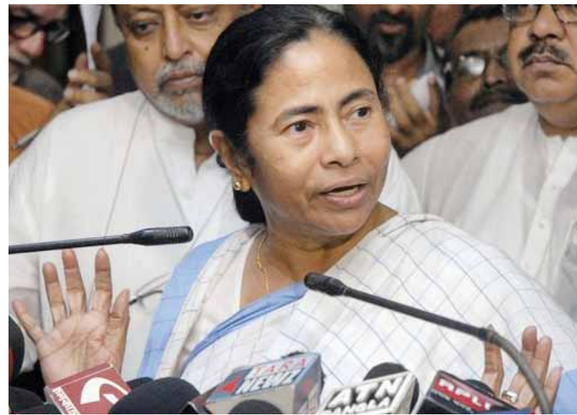
West Bengal Chief Minister Mamata Banerjee.