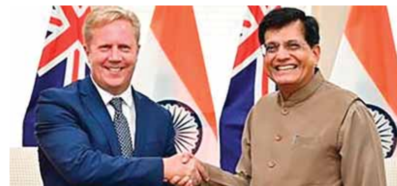
Union Minister Piyush Goyal and New Zealand's Todd McClay during a meeting