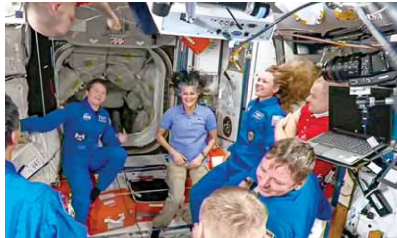
Sunita Williams and other astronauts greeting each other after the SpaceX capsule docked with the International Space Station