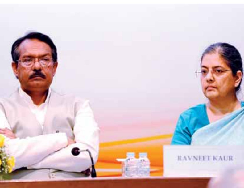
Competition Commission of India (CCI) Chairperson Ravneet Kaur speaks at CCI's 10th National Conference on Economics of Competition Law in New Delhi

"Today's competitive landscape is defined by platform economies, network effects, and algorithm-driven decision-making," the CCI chief said and added that market power today is about