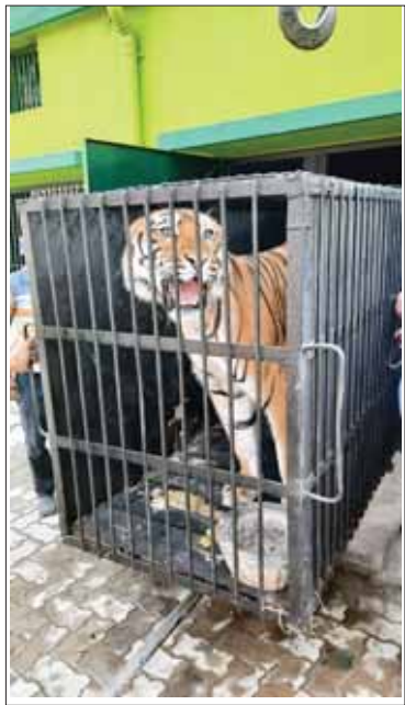
new offspring as wild genes have a positive impact on health and life span.

It is to be noted that Kailash (White tiger) was father of Sunaina and Saloni, so the zoo hopes to get a few of white tiger cubs (baby) after breeding with the newly brought wild origin tiger. Addition of wild origin tigers will also increase the expected life span of