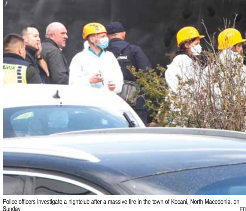
Police officers investigate a nightclub after a massive fire in the town of Kocani, North Macedonia, on Sunday

In an online post, Prime Minister Hristijan Mickoski wrote: "This is a difficult and very sad day for Macedonia. The loss of so many young lives is irreparable, and the pain of the families, loved ones and