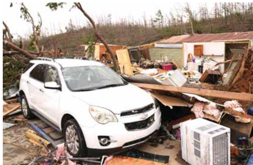
A vehicle sits in front of a damaged home and debris from a severe storm on Saturday in Wayne County

of isolated tornadoes and hail and gusts of 50 to 70 mph, Kemp posted a note saying his family was "praying for all those impacted by this storm system and those still in its path."