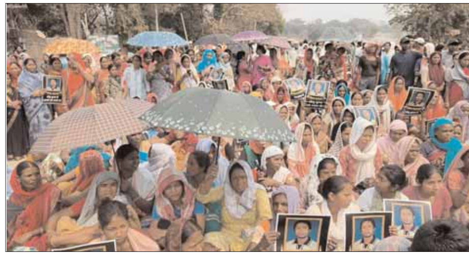
People of one side blocked the road with the body of the student killed in the violence. On the other hand, the district administration bulldozed the liquor dens.

Meanwhile, Jharkhand Leader of Opposition and BJP president Babul Marandi attacked the JMM-led state government and said, "The tragic incident of stone-pelting and arson during the Holi procession in Giridih's Ghodthamba is a result of Hemant Soren's politics of