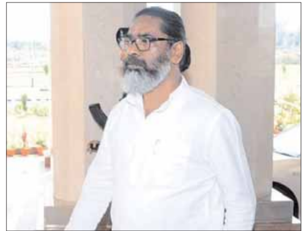
Chief Minister Hemant Soren arrives at the Assembly to attend the Budget Session in Ranchi on Tuesday.

ence amount liability in the work contracts of the Water Resources Department was given. In the light of the in-principle consent received by the State Government for the implementation of the third phase of the e-court project, the Cabinet has given post-deduction approval on the tripartite agreement (MOU) signed by the Principal Secretary cum Legal Advisor on behalf of the State Government as the second party. In-principle consent has been approved on the proposal of the State Government for construction of Balpahari Barrage in the downstream (D/S) of Balpahari Dam under the Balpahari Irrigation Scheme.