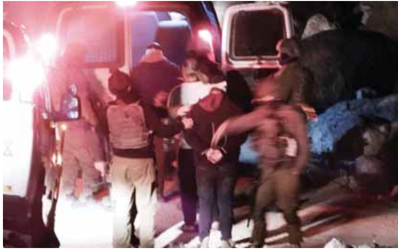
Hamdan Ballal, Palestinian co-director of Oscar-winning documentary 'No Other Land' detained by the Israeli military

The film has won a string of international awards, starting at the Berlin International Film Festival in 2024. It has also drawn ire in Israel and abroad, as when Miami Beach proposed ending the lease of a movie theatre that screened the documentary.