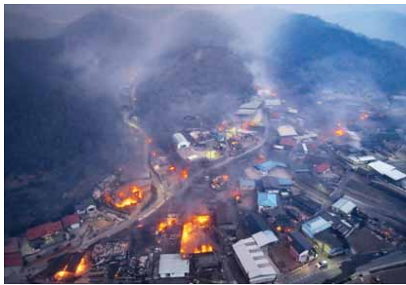
Houses burn in a village after being engulfed by a wildfire fueled by strong winds in Uiseong, South Korea

South Korean officials said earlier on Tuesday that firefighters had extinguished most of the flames from the largest