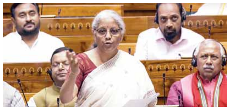
Union Minister Nirmala Sitharaman speaks in the Lok Sabha during the Budget session of Parliament in New Delhi