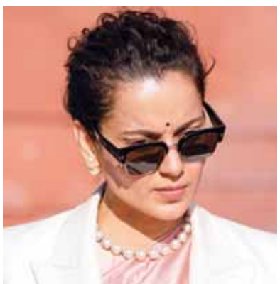
BJP MP Kangana Ranaut stands outside Parliament during the Winter session in New Delhi

"You may be anyone but disrespecting anyone is not good." You are disgracing someone in the name of comedy, you are