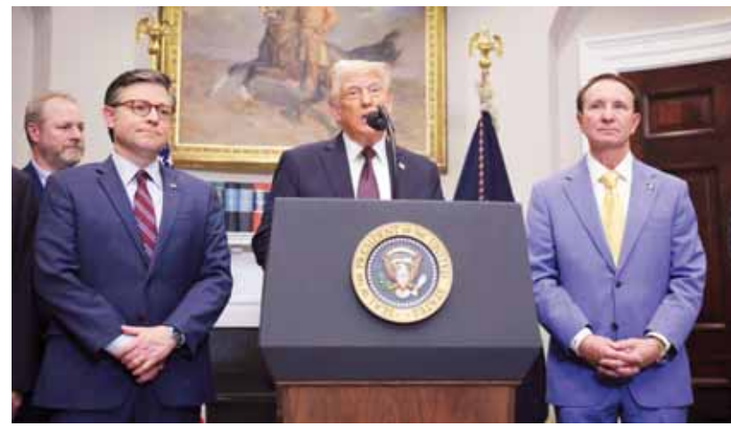
President Donald Trump