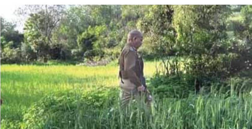
Despite taking all necessary precautions, the DGP was not seen wearing a bulletproof vest and protective headgear (patka) to ensure his safety

DIG, SSP Kathua and SP operations, Kathua, accompanied him in the thickly forested area. Despite taking all necessary precautions, the DGP was not seen wearing a bulletproof vest and protective headgear (patka) to ensure his safety. As his images were published on various social media platforms, questions were raised about whether DGP was violating the Standard Operating Procedures (SOP) while leading the anti-terrorist operations. The Police Chief earlier rushed to the active area on Sunday and supervised the ongoing operations to neutralise the terrorists trapped in the thickly forested area of Sanyal. According to preliminary reports, an alarm was raised by a couple who claimed to have spotted a group of five terrorists in the nearby forests while they were out there to collect firewood. DGP also inter-