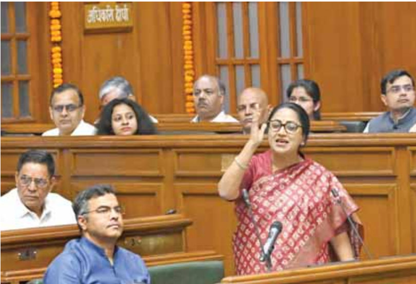
Delhi Chief Minister Rekha Gupta presents the Budget 2025-26

In her 138-minute speech, Gupta called the maiden Budget of the BJP-led Delhi government "historic", for a "Viksit Dilli" (developed Delhi), emphasising that the era of "corruption and inefficiency" was over and Delhi is entering a new era of Traffic-Free Expressways, Seamless Connectivity, Elevated Corridors and Smart Surveillance System. "The Budget Estimates in 2025-26 of ₹ One Lakh Crore is 31.5 per cent more than the Budget estimates 2024-25 of ₹76,000 Crore and 44 per cent higher than the revised estimates 2024-25 of ₹69,500 Crore. The proposed Budget of ₹ One Lakh Crore for the year 2025-26 is to be financed from the Tax Revenue of ₹68,700 Crore, Non-Tax Revenue of ₹750 Crore, Small Savings Loan of ₹15,000 Crore from, Central Road Funds of ₹1,000 Crore from, Centrally Sponsored Schemes of ₹4,128 Crore, Grant in Aid from Government of India of ₹7,348 Crore and