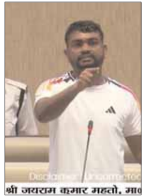
Local residents have secured jobs in the sector.