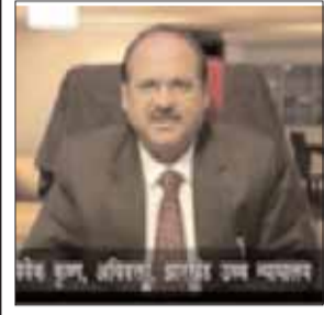
BY VIVEK KRISHNA

Accidental recovery of a huge pile of cash recently from the residence of a Delhi High Court Judge, Yashwant Varma, has again triggered a debate about the corruption in the higher judiciary and failure of the system to check corruption among the members of the higher judiciary. An enquiry will reveal the truth regarding allegation of corruption on Justice Varma, but this is also a fact that time and again various judges of the Supreme Court and different High Courts have overtly indicated towards prevailing corruption in higher judiciary.