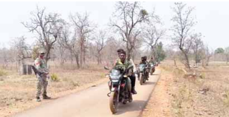
Security personnel return after an encounter in which three Naxals were gunned down in Dantewada district