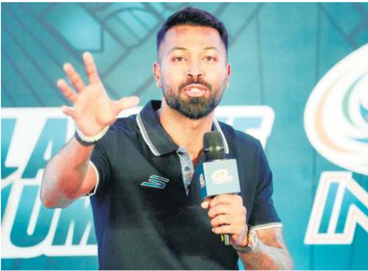
Mumbai Indians captain Hardik Pandya during a press conference ahead of the Indian Premier League (IPL) 2025, in Mumbai

Sitting next to him, head coach Mahela Jayawardene also had his say on