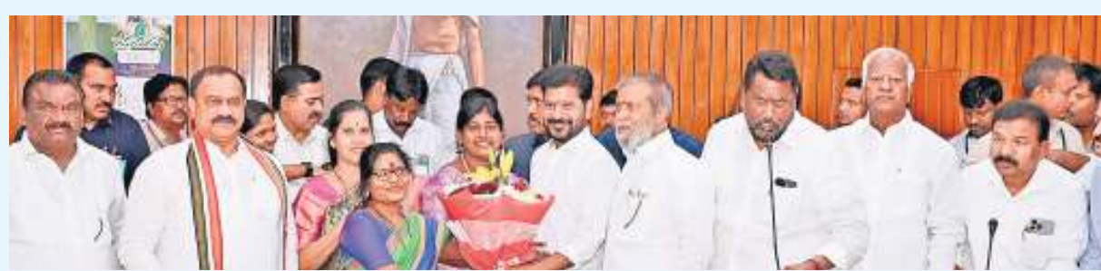
SC leaders including SC MLAs extends thanks to the CM A Revanth Reddy on Wednesday for passing SC Classification Bill in the Assembly

"When we demanded a classification resolution at that time, we were suspended from the House. We solved the problem that was not solved in 10 years