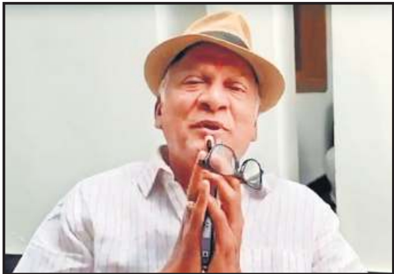
RAJENDRA PRASAD ON DAVID WARNER CONTROVERSY