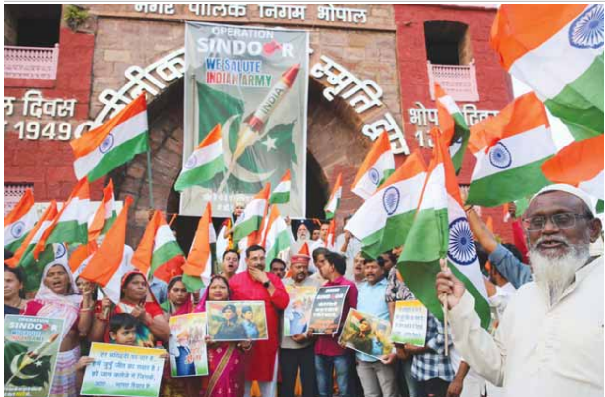
People celebrate the success of 'Operation Sindoor' at Shaheed Gate in Bhopal on Saturday.

is set to transform the lives of people across the Bundelkhand region. Similarly, work has also started on the Parvati-Kalisindh-Chambal river linking project in collaboration with the Rajasthan government, which will benefit various regions of Malwa and Chambal. In the same direction, the Tapi Basin Mega Recharge Project is now being advanced. This initiative will benefit several districts in the Nimar region of Madhya Pradesh, including Khajuraho, Jabalpur, Mandla, and Bilaspur. The project is expected to provide significant benefits to rural communities in these areas.