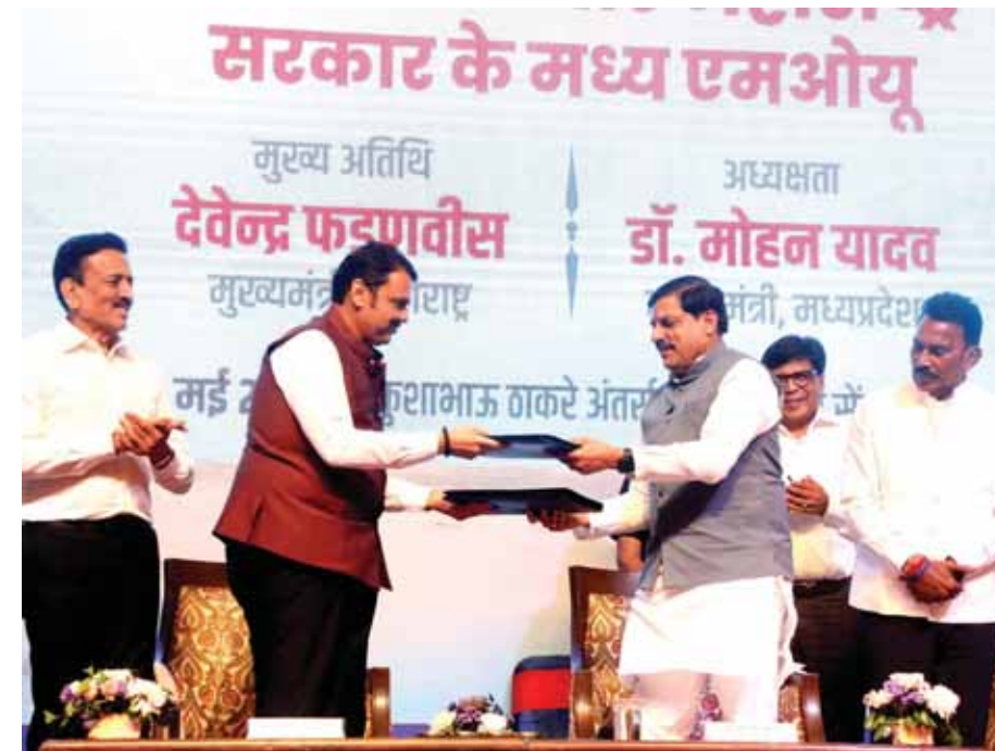
Madhya Pradesh Chief Minister Mohan Yadav and Maharashtra Chief Minister Devendra Fadnis exchange documents after signing an MoU regarding 'Tapi Basin Mega Recharge' project at Kushabhau Thackeray International Convention Center in Bhopal on Saturday.

ignorant — but one who repeats it endlessly is Pakistan. India has stopped forgiving these mistakes." For Madhavi Tiwari, the evening was about national unity beyond politics. "It's encouraging to see opposition parties support the central government. The damage is done, and it will take Pakistan over a decade to recover its image, resources, and public trust. Possessing nuclear arms and using them are two very different things. Those who boast the most often act the least." As dusk settled over Shaurya Smarak, the crowd united in chants of "Vande Mataram" and "Bharat Mata ki Jai," reminding all that even amid uneasy truces and geopolitical shifts, public patriotism remains unshaken.