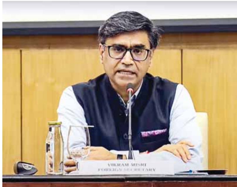
Foreign Secretary Vikram Misri addresses the media on 'Operation Sindoor' in New Delhi

The foreign secretary said the Pakistani claims about destroying the Sirsa and Surat air force stations are "completely false". "There is a claim that has been made that the S-400 base at Adampur was destroyed, completely false, once again," he said.