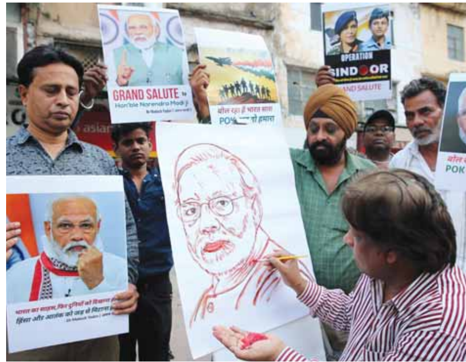
A social activist and blood campaigner makes a blood portrait of Prime Minister Narendra Modi in solidarity and success of 'Operation Sindoor' in Bhopal on Saturday.

resilient practices, such as early sowing, contour farming, and crop diversification, especially in regions that may receive heavy and continuous rainfall. Agricultural extension workers are also promoting the use of high-yield and flood-resistant seed varieties to mitigate potential losses due to extreme weather. In tandem with these efforts, the state's Disaster Management Authority has initiated pre-monsoon infrastructure checks, particularly focusing on low-lying and flood-prone areas. Drainage systems, embankments, and irrigation channels are being inspected and repaired to prevent urban flooding and waterlogging, which often disrupt both rural livelihoods and transportation during heavy spells. Authorities are also preparing emergency shelters and ensuring adequate stock of relief materials, signaling a proactive approach to monsoon management this year.