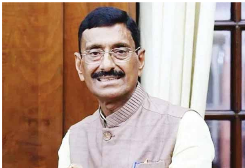
Minister of State for Defence Sanjay Seth

Russia has assured full support to India in its fight against all manifestations of terrorism and promised to promptly fulfil military orders in the pipeline, visiting Union Minister of State for Defence Sanjay Seth said on Saturday.