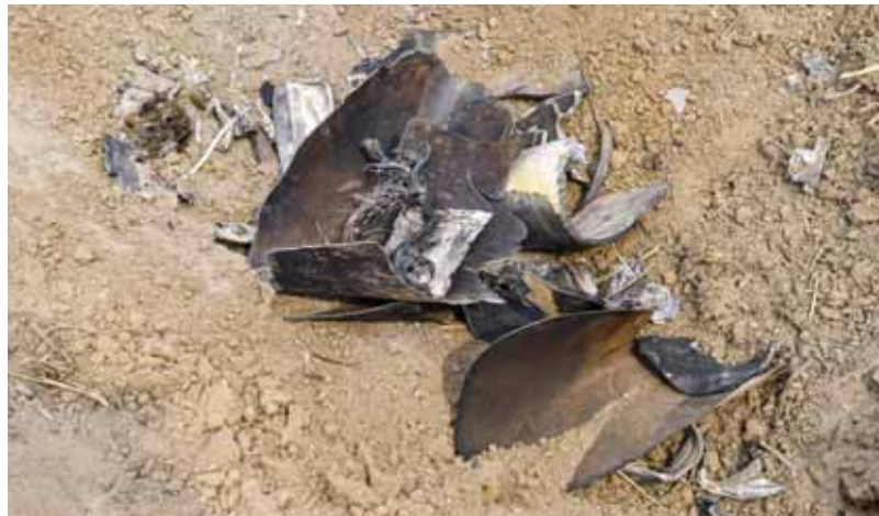
The debris of an unidentified projectile which landed amid the conflict between India and Pakistan in Jalandhar, Punjab on Saturday