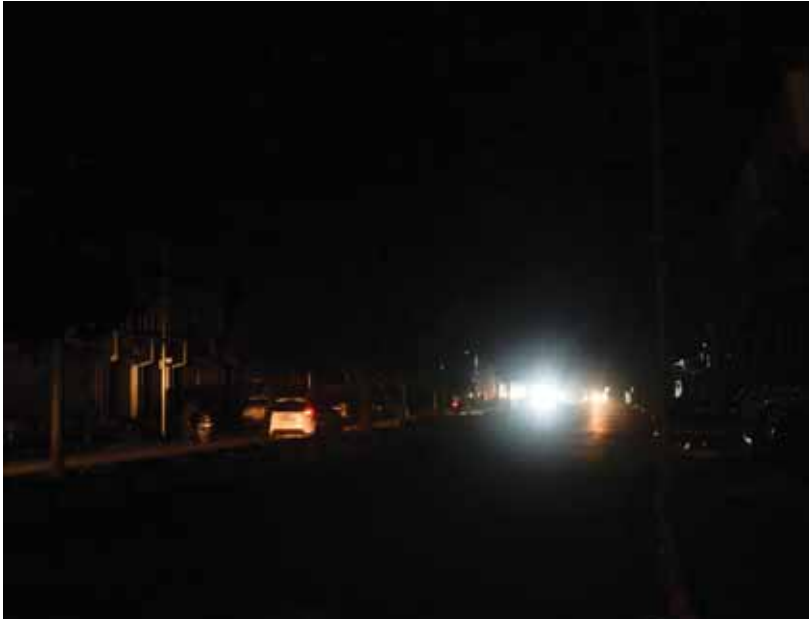
(Left) Vehicles moving on a road during blackout in Srinagar; (Right) Prime Minister Narendra Modi chaired a high-level meeting Saturday evening with top government functionaries, including Defence Minister Rajnath Singh and External Affairs Minister S Jaishankar, following the announcement that India and Pakistan have reached an understanding to stop military actions. NSA Ajit Doval, Chief of Defence Staff General Anil Chauhan and all three service chiefs were among those who attended the meeting.

Before the press briefing started, suspicious movement was spotted by an alert sentry at the Nagrota Military station in Jammu late Saturday night. The sentry sustained a minor injury during a brief exchange of fire. Nagrota-based White Knight Corps in a post on X said, "On noticing suspicious movement near the perimeter, alert sentry at Nagrota Military Station issued a challenge, leading to a brief exchange of fire with the sentry. The sentry sustained a minor injury. Search operations are underway to track the intruder(s)." Before India and Pakistan agreed to a ceasefire agreement, six persons, including a senior J-K government official and