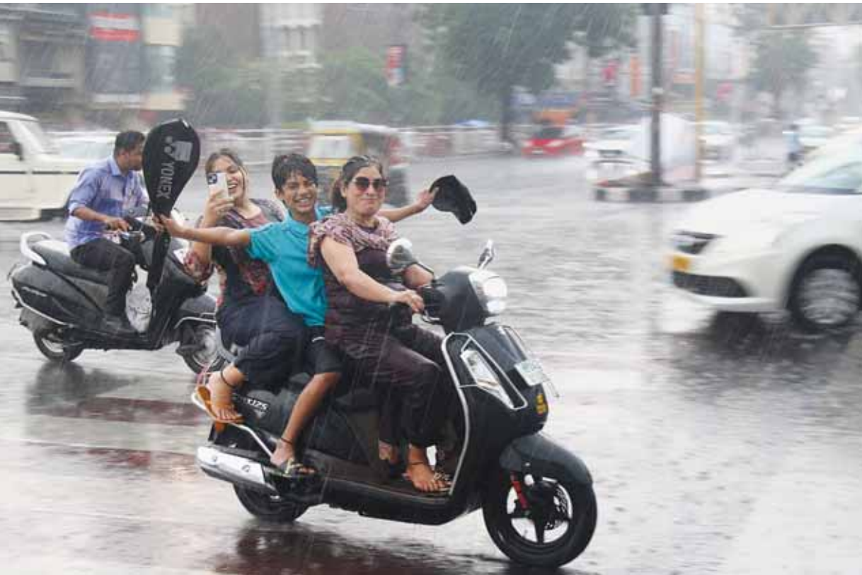
Young women enjoy the rain in Bhopal on Wednesday.