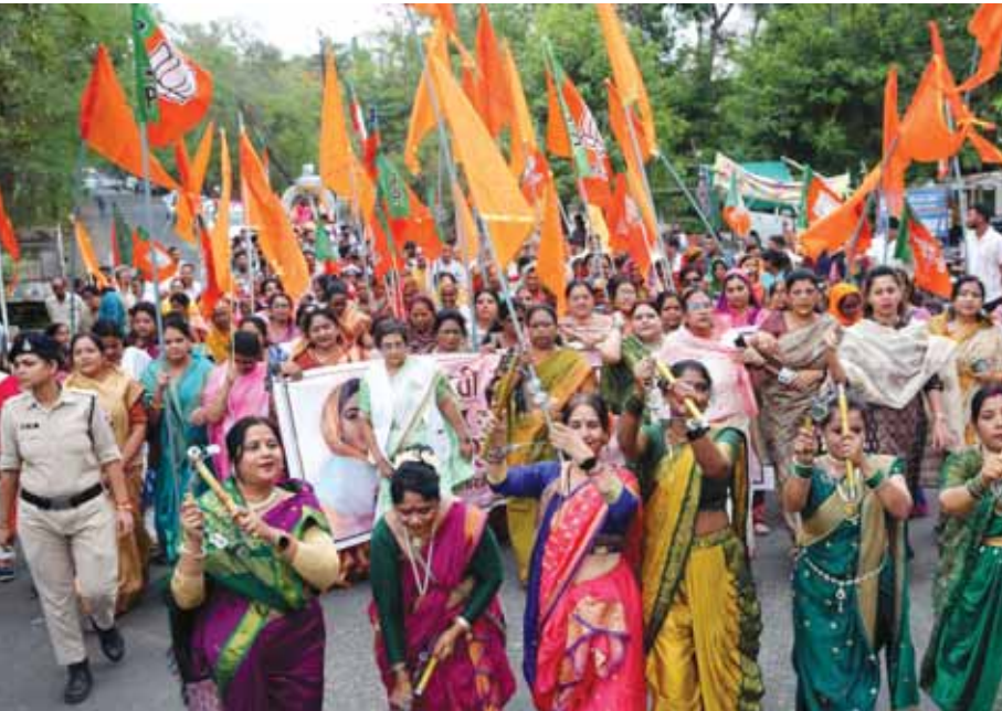
BJP Mahila Morcha workers participate in a rally during Lokmata Devi Ahilya Bai Holkar's 300th birth anniversary celebrations, in Bhopal on Wednesday.