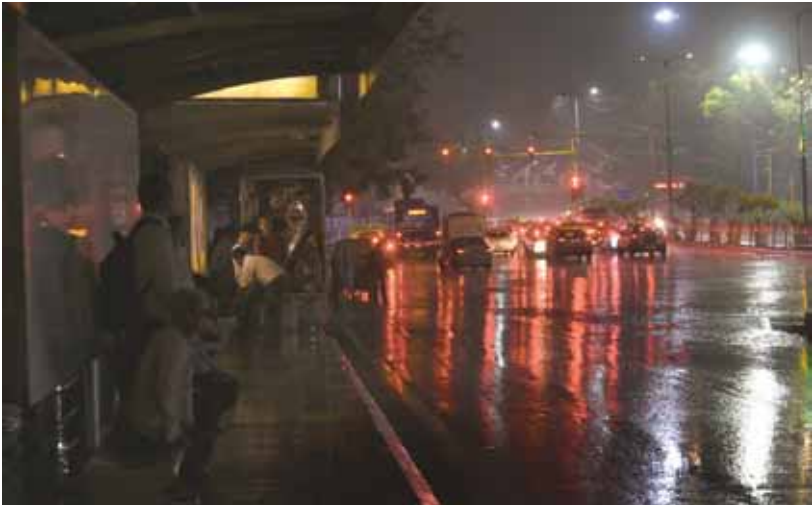
Pedestrians sheltering from rain at a bus stop in New Delhi on Wednesday evening

An IndiGo flight from Delhi to Srinagar was caught in a sudden hailstorm mid-air