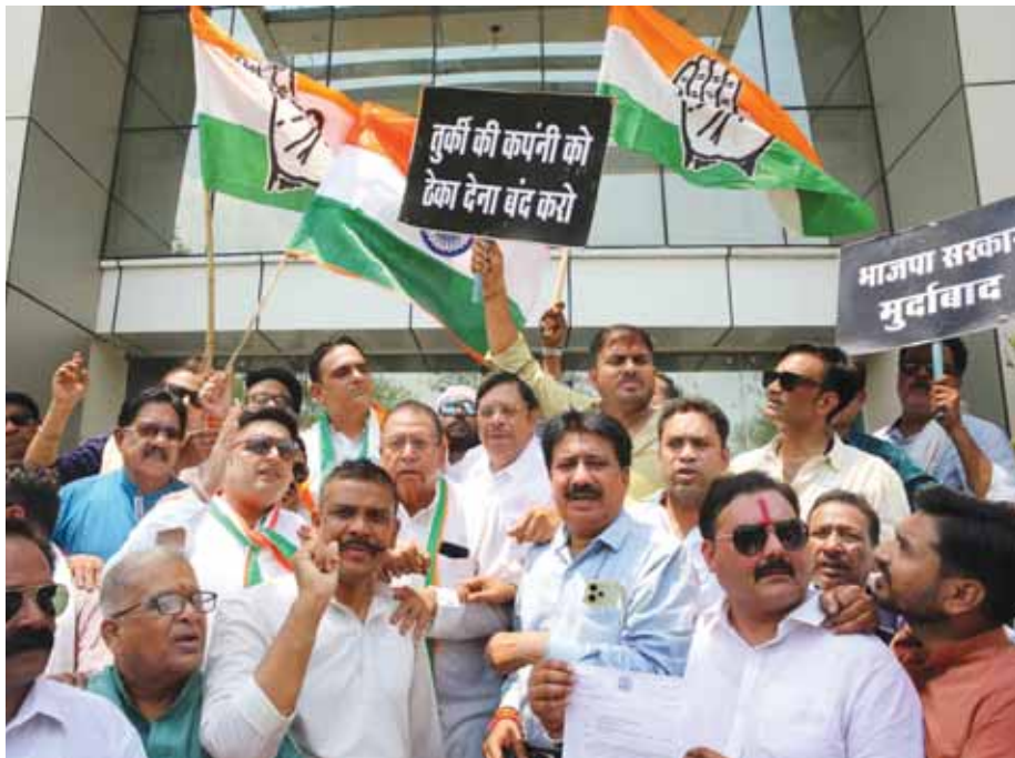
Congress party workers stage a protest against the contract for the Bhopal and Indore metros with the Turkish firm Asis Guard, following reports that drones manufactured by it were allegedly used by Pakistan in anti-India operations during Operation Sindoor, at Bhopal Metro Rail Project office in Bhopal on Wednesday.

tive to the needs of pedestrians, especially those with disabilities. For a region this large, doorstep governance is an absolute must. Without citizen involvement, a metropolitan authority risks becoming a distant, bureaucratic body. Citizen charters, ward-level planning, and digital complaint systems can keep decision-making open and responsive. People must feel they are part of the process, not just subject to it. While there is no doubt that Bhopal's tryst with a metropolitan destiny can bring prosperity, learning and pride, the outcome will largely depend on administrators. They will have to ensure that growth is not simply planned for the sake of statistics, but shaped around the lived realities of the city's residents.