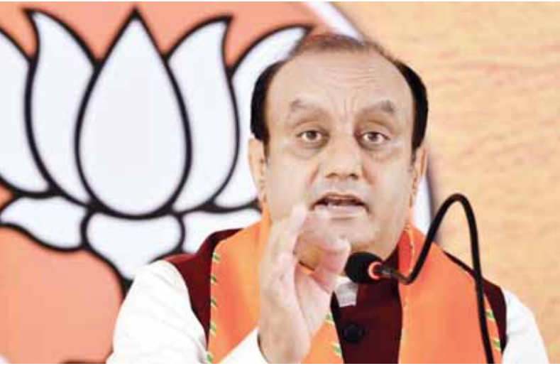
PIONEER NEWS SERVICE ■ New Delhi

The BJP on Wednesday flayed the Congress over its allegation that the Government decided to send multi-party delegations to various countries to divert public attention from “tough questions”, saying nationalism has completely vanished in the opposition party. The ruling BJP also lashed out at other constituents of the Opposition INDIA bloc over the recent remarks of some of their leaders on the Indo-Pak conflict, accusing them of “behaving like the Popular Front of Pakistan” at a time when they should have shown solidarity while keeping in mind India’s interest. This came after Congress leader Jairam Ramesh on Wednesday claimed that Prime Minister Narendra Modi suddenly thought of sending multi-party delegations to visit different countries to divert attention from the tough questions he is being called to answer, while his image globally has been “shattered”. Reacting sharply, BJP national spokesperson and Rajya Sabha MP Sudhanshu Trivedi accused the Congress