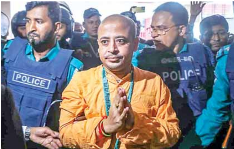
Hindu leader Chinmoy Krishna Das

Das' arrest sparked widespread protests with his followers demonstrating in Dhaka and other places. In the port city, the protest turned violent when assistant gov-