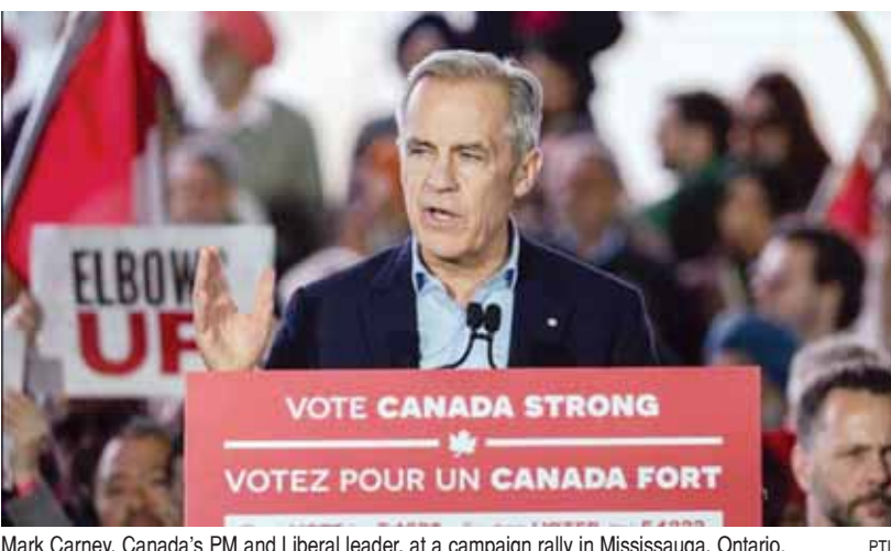
Mark Carney, Canada's PM and Liberal leader, at a campaign rally in Mississauga, Ontario.

for prime minister Monday but was voted out of the Parliament seat that he held for 20 years. That capped a swift decline in fortunes for the firebrand Poilievre, who a few months ago appeared to be a shoo-in to become Canada's next prime minister and shepherd the Conservatives back into power for the first time in a decade.