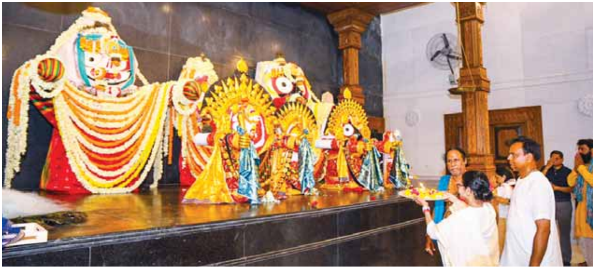
West Bengal CM Mamata Banerjee offers prayer to Lord Jagannath enshrined in the 'Garbhagriha' of the newly inaugurated Jagannath Temple in Digha

The Chief Minister also wrote, "Today, as the sacred Dhawja rose above the Jagannath Temple in Digha, I witnessed a vision conceived in 2018 come to life. With the Maha Yajna complete, we wait with bated breath for the Lord of the Universe