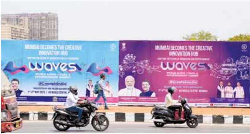
Commuters pass by hoardings put up for the World Audio Visual & Entertainment Summit (WAVES 2025) in Mumbai PTI

On the eve of the first ever WAVES Summit, the JWCC has transformed into a coliseum of creativity, a nucleus of anticipation brimming with power, passion, and promise. Across the city too, the signs are unmistakable. Banners flutter, hotels are booked to capacity, and the cultural pulse of Mumbai beats louder in readiness for what promises