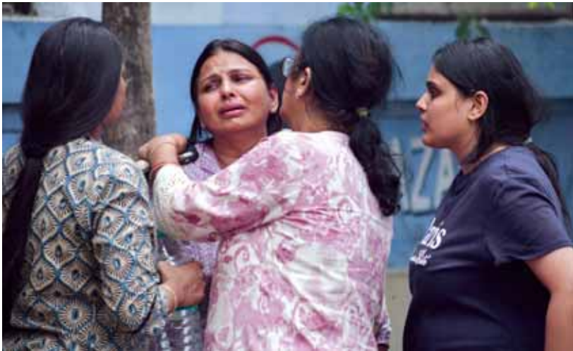
Relatives console a woman after she identified the body of her relative who was killed in the Rituraj hotel fire incident, at the RG Kar Hospital in Kolkata

A senior officer from the Kolkata Police said that, “There were 88 guests in 42 rooms at the time of the incident. A boy, a girl and a woman are among the dead.” Locals said that a short circuit inside the kitchen could be the reason of the fire.