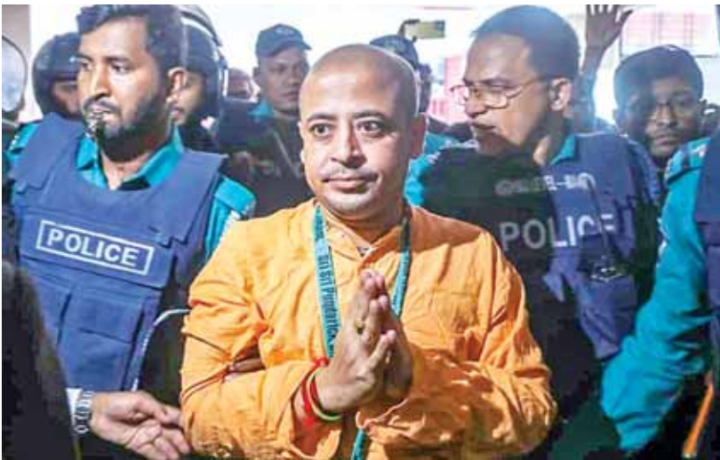
Hindu leader Chinmoy Krishna Das