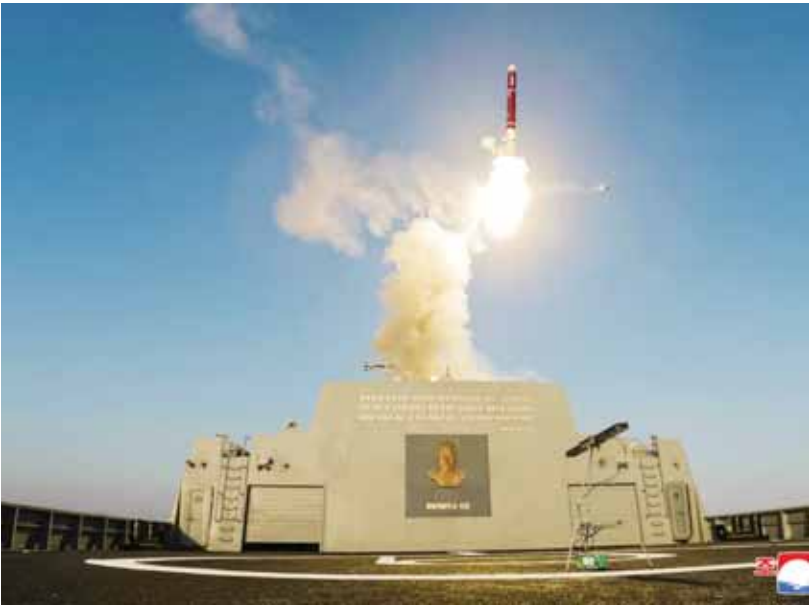
Test-firings conducted in North Korea

North Korea said Wednesday leader Kim Jong Un observed the first test-firings of missiles from a recently launched destroyer - the first such warship for the North - and called for accelerating efforts to boost his navy’s nuclear attack capabilities. North Korea last week unveiled the 5,000-tonne destroyer equipped with what it called the most powerful weapons built in its warship industry. During Friday’s launching ceremony at the western port of Nampo, Kim called the ship’s construction “a breakthrough” in modernising North Korea’s naval forces. Outsider experts say it’s North Korea’s first destroyer and that it was likely built with Russian assistance. They say North Korea’s naval forces lag behind South Korea’s but still view the destroyer as a serious security threat as it could bolster North Korea’s attack and defence capabilities. The official Korean Central News Agency said Wednesday that Kim watched the tests of the destroyer’s supersonic and strategic cruise missiles, anti-aircraft missile, automatic guns and electronic jamming guns earlier this week. He appreciated the ship’s combination of powerful strike weapons and conventional defenses and set tasks to speed the nuclear-arming of his navy, the report said. During the ship’s launching ceremony,