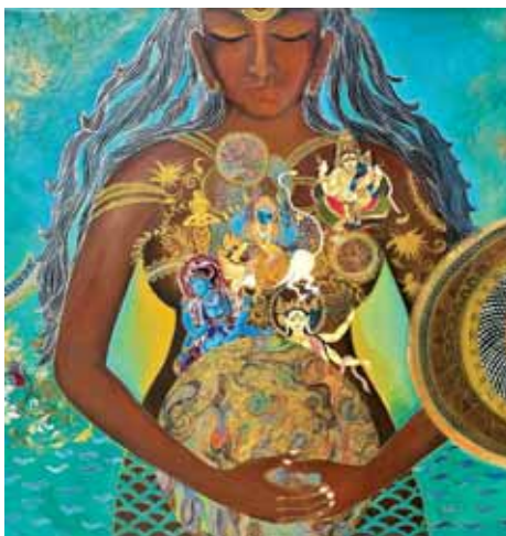
THE EXHIBITION SUCCEEDS BY CREATING CONDITIONS FOR THEIR DISCOVERY. IN AN ART WORLD OFTEN DOMINATED BY SPECTACLE, SHARMA'S QUIET CONFIDENCE IN HER MATERIALS AND IDEAS FEELS PARTICULARLY SIGNIFICANT.

Each element maintains its distinct character while contributing to a cohesive whole, much like the philosophical concepts they represent. In the Maya series, Sharma's technique becomes particularly compelling. Semi-transparent layers of paint create figures that appear