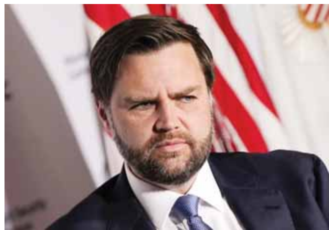
US Vice President J D Vance

"But I think the job of diplomacy, but also the job of cooler heads in India and Pakistan is to make sure this doesn't become a nuclear war. If it happened of course it would be disastrous. Right now