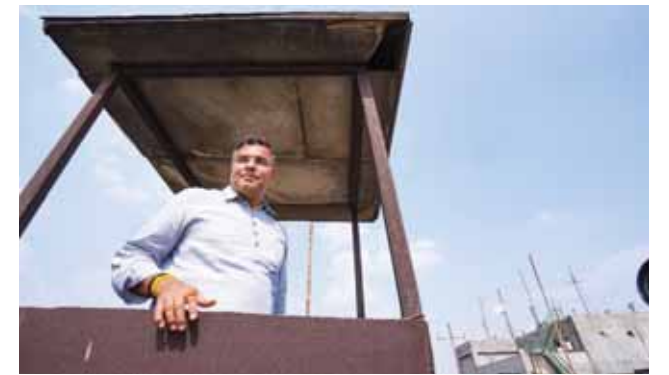
Delhi PWD Minister Parvesh Verma during the testing of an air raid siren installed atop the PWD building at ITO in New Delhi

Delhi police teams were deployed to check the preparedness of the staff as well as equipment, an officer said.