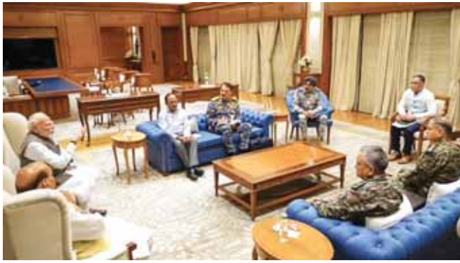
Prime Minister Narendra Modi with Defence Minister Rajnath Singh, National Security Advisor Ajit Doval, Chief of Defence Staff General Anil Chauhan, Army chief General Upendra Dwivedi, Navy chief Admiral Dinesh K Tripathi and IAF chief Air Chief Marshal Amar Preet Singh, during a high-level meeting on the security situation in New Delhi

Misri especially hit out at Pakistan for its "blatantly farcical denial" of these attacks saying it is yet another example of Islamabad's duplicity and the "new depths" that it is plumb to in its "quest for disinformation". Misri was severely critical of Pakistan for targeting religious places with an aim to give a communal colour to the current situation, and pointed to an incident of Pakistan attacking a gurdwara in Poonch and another religious place in Amritsar. "Instead of owning up to these attacks, Pakistan made the preposterous and outrageous claim that it was the Indian armed forces and the Indian Air Force that was targeting cities like Amritsar