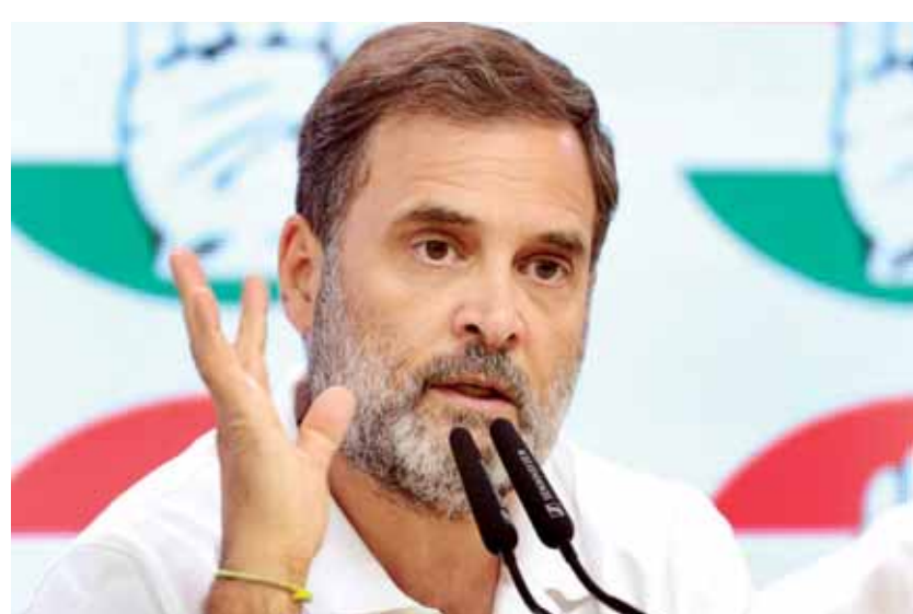
Leader of Opposition Rahul Gandhi during press conference in New Delhi on Wednesday