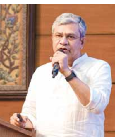
Union Minister Ashwini Vaishnaw briefs the media on cabinet decisions on Wednesday

used the issue as a political tool. "Considering all these facts and to ensure that the social fabric is not disturbed by politics, caste enumeration should be transparently included in the Census instead of surveys," he said, adding that this will strengthen the social and economic structure of our society while the nation continues to progress. The Minister alleged that the States ruled by opposition parties have done caste surveys for political reasons and emphasised that the Modi Government has resolved to transparently include caste enumeration in the forthcoming pan-India census exercise. Vaishnaw said the census comes under the purview of the Centre, but some States have done caste enumeration in the name of surveys "non-transparently" which has created doubts in the society. The Congress and other opposition