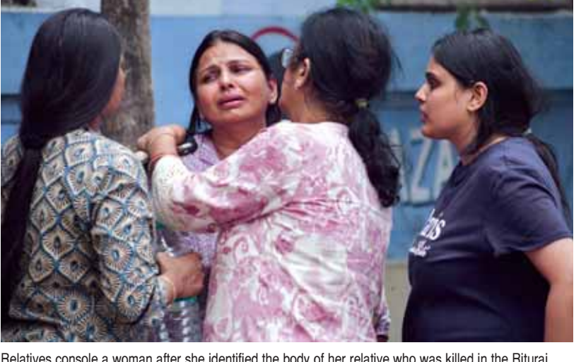
Relatives console a woman after she identified the body of her relative who was killed in the Rituraj hotel fire incident, at the RG Kar Hospital in Kolkata

At least 14 people including two women and two children died in a massive fire that broke inside an upmarket North Kolkata hotel late on Tuesday evening. About 12 people were injured and continue to recuperate in various hospitals, police said. Most deaths occurred on account of choking from the smoke as the trapped guests and staff could not come out of the six-storey building at Mechua Bazar in North Kolkata's busy Bara Bazar area. The fire broke out at about 8 pm and it took more than 10 hours for the fire-fighters to douse. "Initially what looked like a manageable fire the magnitude of it could be gauged only after the flames were put out and the dead people were rescued well past midnight," a senior fire official said. Most of those dead are from Bihar Fire Brigade sources said holding the hotel owners guilty of flouting the building norms. "The emergency exit door was closed because some building materials had piled up there as the authorities were building an illegal dance floor and bar without permission of the authorities," locals said. The Fire Brigade officials said the fire fighting system inside the hotel was not working and the water tank was empty adding the fire clearance certificate had lapsed three years ago. A senior officer from the Kolkata Police said that, "There were 88 guests in 42 rooms at the time of the incident. A boy, a girl and a woman are among the dead." Locals said that a short circuit inside the kitchen could be the reason of the fire.