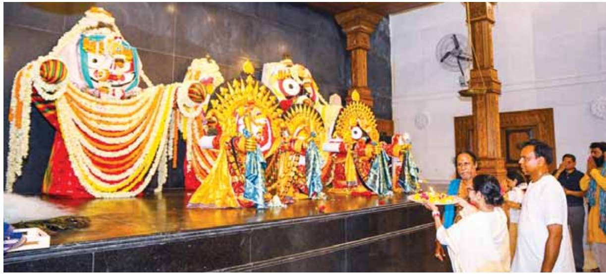
West Bengal CM Mamata Banerjee offers prayer to Lord Jagannath enshrined in the 'Garbhagriha' of the newly inaugurated Jagannath Temple in Digha

The Chief Minister also wrote, "Today, as the sacred Dhawja rose above the Jagannath Temple in Digha, I witnessed a vision conceived in 2018 come to life. With the Maha Yajna complete, we wait with bated breath for the Lord of the Universe