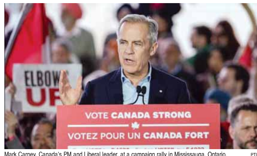
Mark Carney, Canada's PM and Liberal leader, at a campaign rally in Mississauga, Ontario.

for prime minister Monday but was voted out of the Parliament seat that he held for 20 years. That capped a swift decline in fortunes for the firebrand Poilievre, who a few months ago appeared to be a shoo-in to become Canada's next prime minister and shepherd the Conservatives back into power for the first time in a decade.