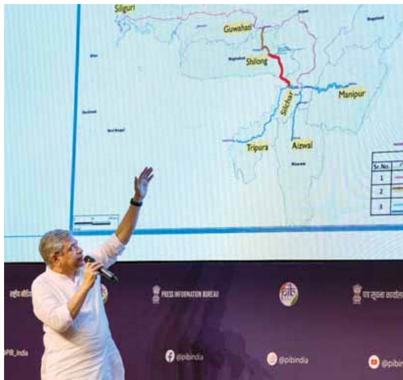
Union Minister Ashwini Vaishnaw briefs the media on Cabinet decisions in New Delhi on Wednesday

The corridor will improve connectivity between Assam and Meghalaya and spur economic development, including the development of industries in Meghalaya, as it passes through the cement and coal production areas of Meghalaya.