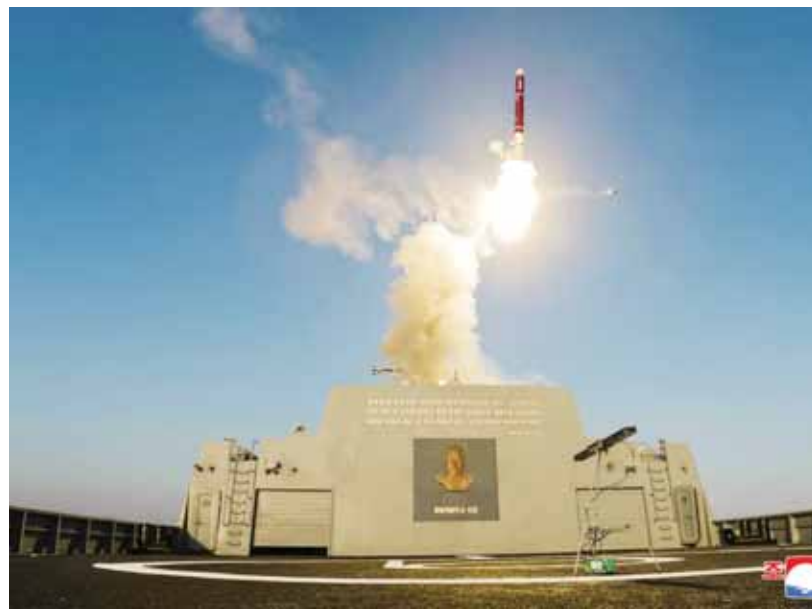
Test-firings conducted in North Korea

He appreciated the ship's combination of powerful strike weapons and conventional defenses and set tasks to speed the nuclear-arming of his navy, the report said. During the ship's launching ceremony,