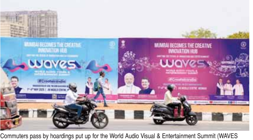
Commuters pass by hoardings put up for the World Audio Visual & Entertainment Summit (WAVES) in Mumbai

The Mumbai sky wears its usual grey, humid veil, but outside the Jio World Convention Centre (JWCC), something extraordinary is brewing till this weekend. The sprawling façade of the JWCC shimmers under spotlights and massive LED displays pulsing with the WAVES Summit logo. Security details move with intent, cranes hoist final fixtures, and camera crews scurry across pavements, their lenses trained on every movement. There is a low but constant hum of walkie talkies, clinking scaffolds, and rehearsals filtering through the air. On the eve of the first ever WAVES Summit, the JWCC has transformed into a coliseum of creativity, a nucleus of anticipation brimming with power, passion, and promise. Across the city too, the signs are unmistakable. Banners flutter, hotels are booked to capacity, and the cultural pulse of Mumbai beats louder in readiness for what promises