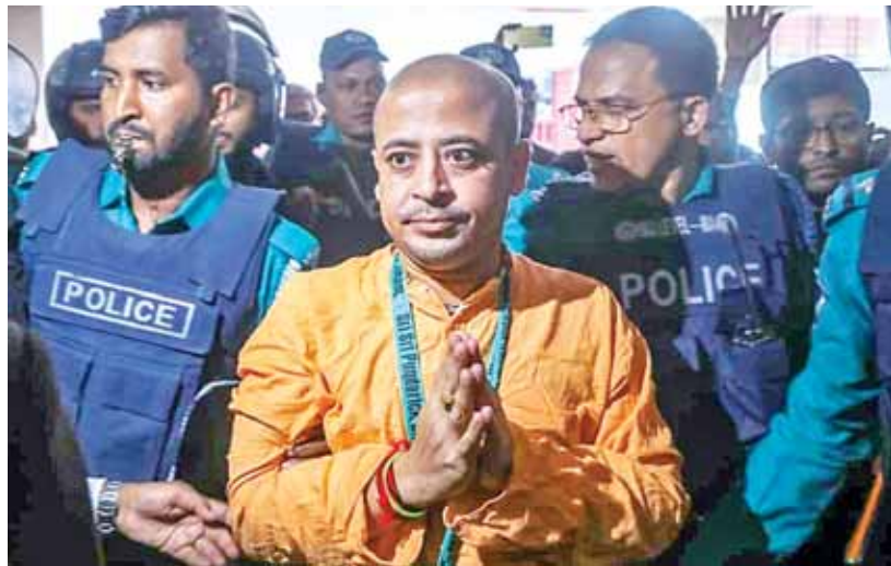
Hindu leader Chinmoy Krishna Das

Das' arrest sparked widespread protests with his followers demonstrating in Dhaka and other places. In the port city, the protest turned violent when assistant gov-