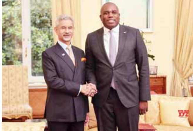
External Affairs Minister S Jaishankar on Friday held a phone conversation with British counterpart David Lammy

US State Department Spokesperson Tammy Bruce said Rubio emphasised the need for immediate de-escalation. “He expressed US support for direct