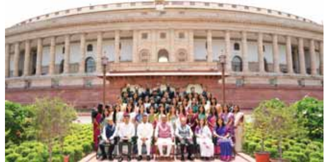
Lok Sabha Speaker Om Birla with IAS officer trainees during a group photo before the inauguration of their study visit to the Parliament House in New Delhi on Friday

He encouraged the trainees to engage in daily self-evaluation and strive to make tangible differences in the lives of citizens through transparent, responsive governance. He invoked the vision of Sardar Vallabhbhai Patel, who believed