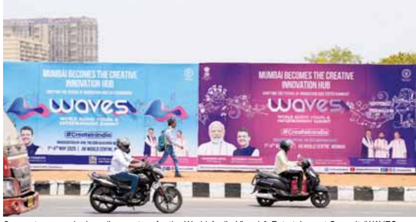
Commuters pass by hoardings put up for the World Audio Visual & Entertainment Summit (WAVES) in Mumbai

On the eve of the first ever WAVES Summit, the JWCC has transformed into a coliseum of creativity, a nucleus of anticipation brimming with power, passion, and promise. Across the city too, the signs are unmistakable. Banners flutter, hotels are booked to capacity, and the cultural pulse of Mumbai beats louder in readiness for what promises