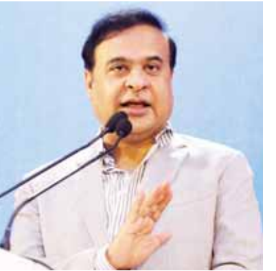
Assam CM Himanta Biswa Sarma FILE PHOTO

The GHCBA has been opposing relocation of the High Court complex to Rangmahal in the northern bank of Brahmaputra from its existing address in