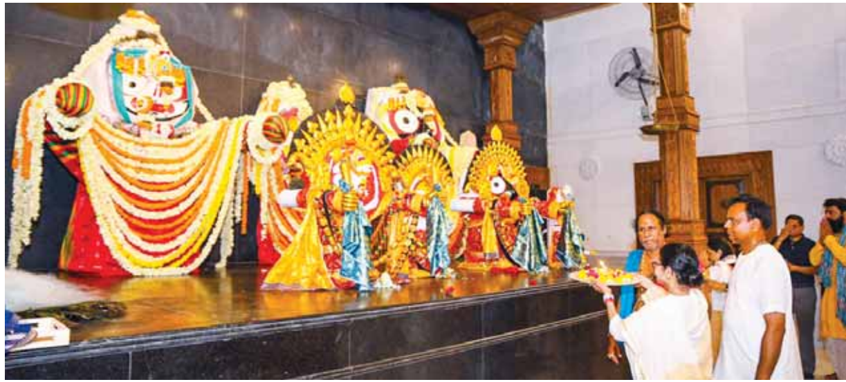
West Bengal CM Mamata Banerjee offers prayer to Lord Jagannath enshrined in the 'Garbhagriha' of the newly inaugurated Jagannath Temple in Digha

The Chief Minister also wrote, "Today, as the sacred Dhawja rose above the Jagannath Temple in Digha, I witnessed a vision conceived in 2018 come to life. With the Maha Yajna complete, we wait with bated breath for the Lord of the Universe