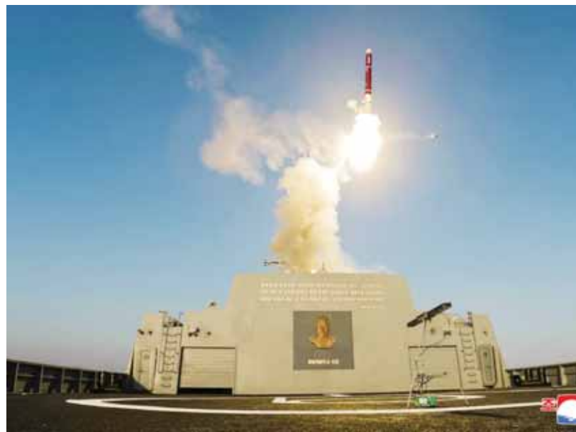
Test firings conducted in North Korea

He appreciated the ship's combination of powerful strike weapons and conventional defenses and set tasks to speed the nuclear-arming of his navy, the report said. During the ship's launching ceremony,