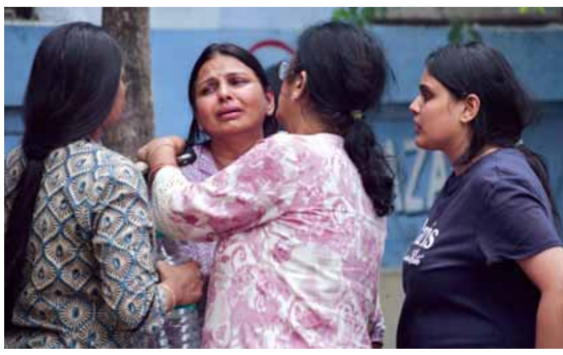
Relatives console a woman after she identified the body of her relative who was killed in the Rituraj hotel fire incident, at the RG Kar Hospital in Kolkata

A senior officer from the Kolkata Police said that, "There were 88 guests in 42 rooms at the time of the incident. A boy, a girl and a woman are among the dead." Locals said that a short circuit inside the kitchen could be the reason of the fire.