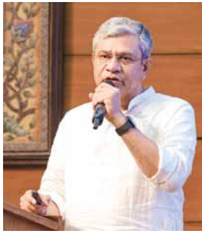
Union Minister Ashwini Vaishnaw briefs the media on cabinet decisions on Wednesday

parties have been vociferously demanding a nationwide caste census, making it a major election issue, and some States like Bihar, Telangana and Karnataka have conducted such surveys. The Government decision comes ahead of assembly elections in Bihar, where several parties including some BJP allies have been coming out in support of the caste census.