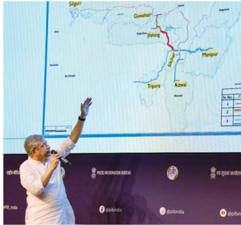
Union Minister Ashwini Vaishnaw briefs the media on Cabinet decisions in New Delhi on Wednesday

The corridor will improve connectivity between Assam and Meghalaya and spur economic development, including the development of industries in Meghalaya, as it passes through the cement and coal production areas of Meghalaya.