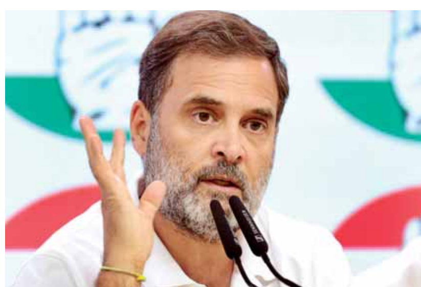
Leader of Opposition Rahul Gandhi during press conference in New Delhi on Wednesday