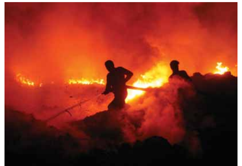
Firefighters try to douse fire that broke out in a slum area in Gurugram

The cause of the fire has not been ascertained yet, but according to the preliminary investigation, it is suspected that the fire broke out in a slum while making tea, etc, he said. "We received a call about the fire at 3.50 am. The fire brigade team reached the spot within 10 minutes. There were 150 huts there. Out of