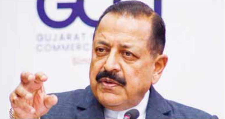
Union Minister Jitendra Singh

The minister also stressed the importance of regularly updating the digital list to maintain its relevance and utility.