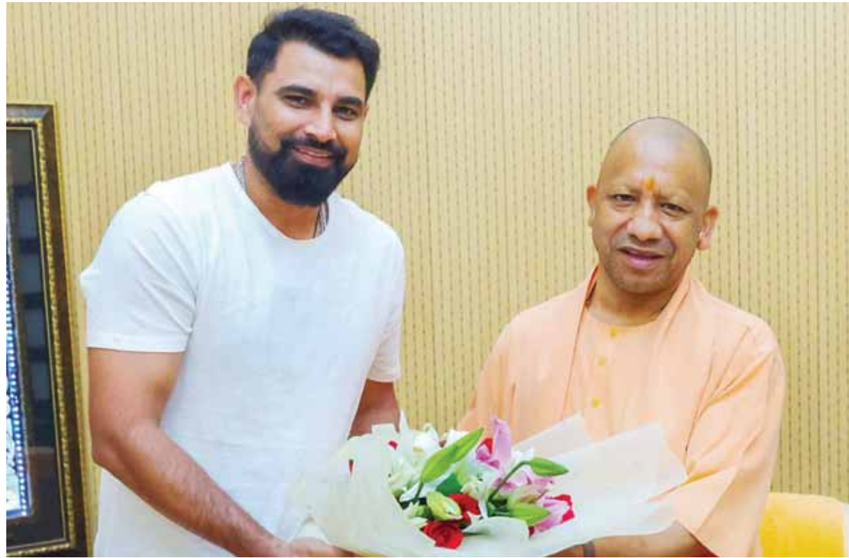
Lucknow: Pacer Mohammed Shami met Uttar Pradesh Chief Minister Yogi Adityanath at the latter’s official residence in Lucknow ahead of the IPL match between Lucknow Super Giants and Sunrisers Hyderabad on Monday. In a post on X in Hindi, Adityanath said that Shami had a courtesy meeting with him at his official residence in Lucknow. Adityanath also shared a couple of photographs clicked with the fast bowler.