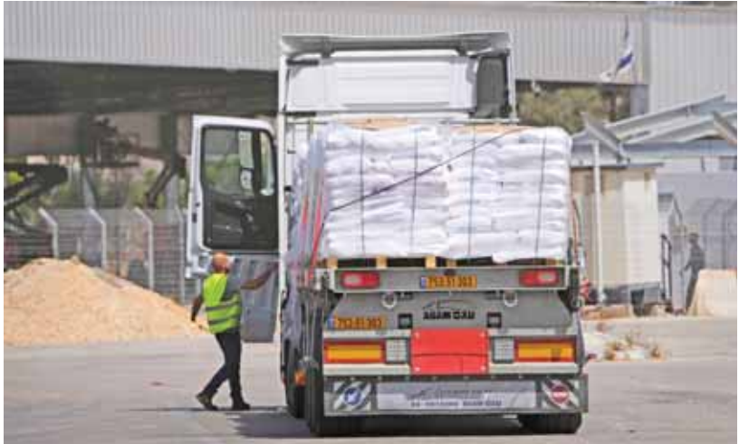
Trucks carrying humanitarian aid for the Gaza Strip are seen at the Kerem Shalom Crossing in southern Israel on Monday

A US-backed group expected to run aid distribution in Gaza said Israel's announcement was an "important first step".