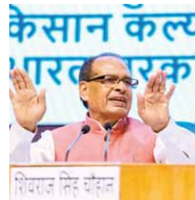
Agriculture Minister Shivraj Singh Chouhan