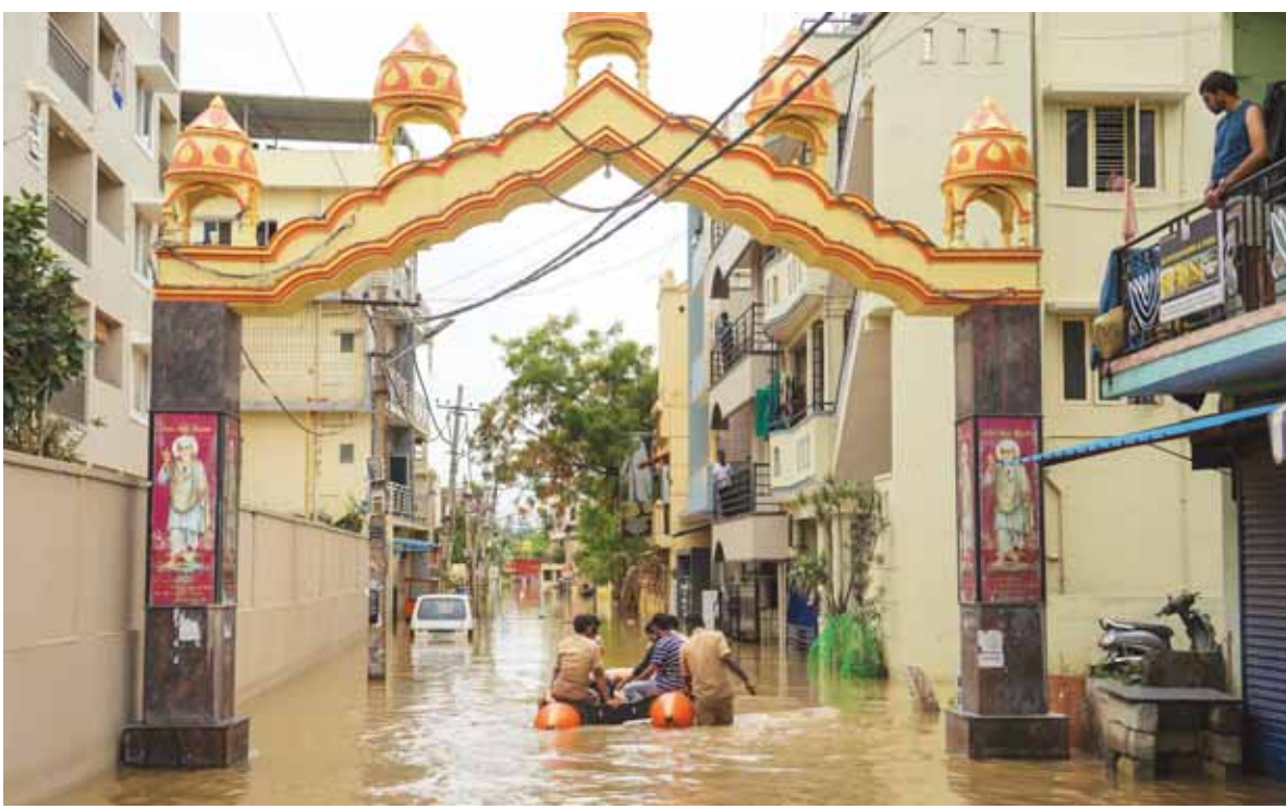
Residents being rescued from a waterlogged area after heavy rains in Bengaluru