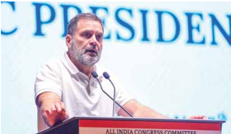
Leader of Opposition in Lok Sabha Rahul Gandhi