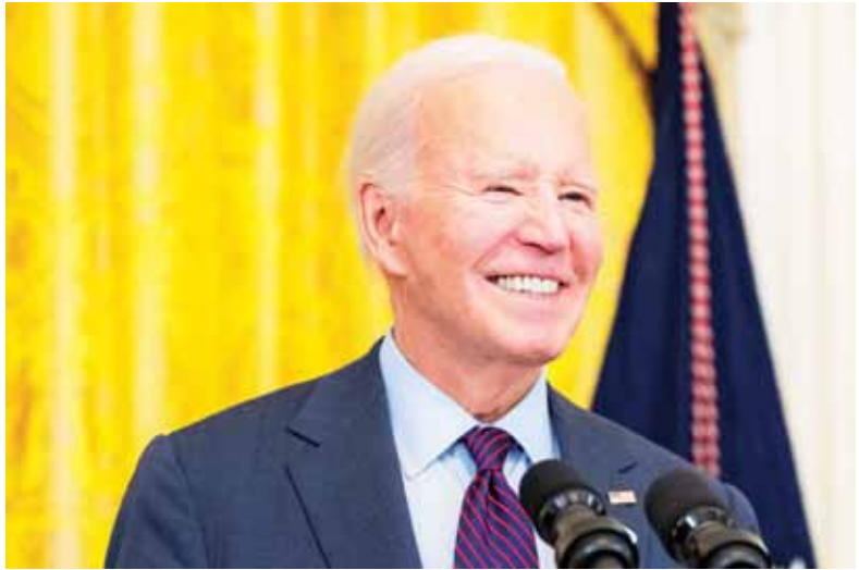
Many political leaders sent former US president Joe Biden wishes for his recovery