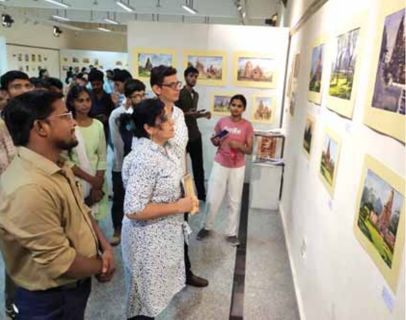
An art exhibition being held at BHU in Varanasi on Monday.