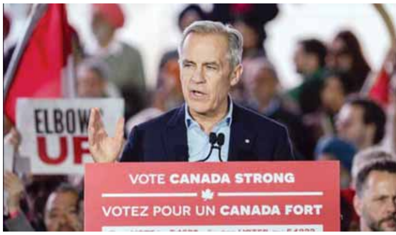
Mark Carney, Canada's PM and Liberal leader, at a campaign rally in Mississauga, Ontario.

for prime minister Monday but was voted out of the Parliament seat that he held for 20 years. That capped a swift decline in fortunes for the firebrand Poilievre, who a few months ago appeared to be a shoo-in to become Canada's next prime minister and shepherd the Conservatives back into power for the first time in a decade. Poilievre, a career politician, campaigned with Trump-like bravado, taking a page from the "America First" president by adopting the slogan "Canada First." But his similarities to Trump may have ultimately cost him and his party. The Liberals were projected to win 169 seats of Parliament's 343 seats while the Conservatives were projected to win 144. The separatist Bloc Quebecois party was expected to finish with 22 seats, the progressive New Democrats with seven and the Greens with one. Recounts were expected in some districts. Elections Canada said 68.5 per cent of eligible voters cast ballots in the federal election — the highest turnout since 1993. In a victory speech, Carney stressed unity in the face of Washington's threats.