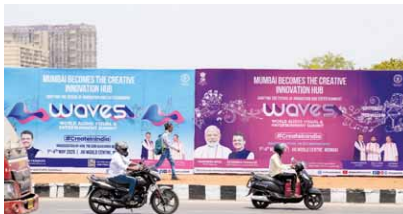
Commuters pass by hoardings put up for the World Audio Visual & Entertainment Summit (WAVES) in Mumbai

On the eve of the first ever WAVES Summit, the JWCC has transformed into a coliseum of creativity, a nucleus of anticipation brimming with power, passion, and promise. Across the city too, the signs are unmistakable. Banners flutter, hotels are booked to capacity, and the cultural pulse of Mumbai beats louder in readiness for what promises