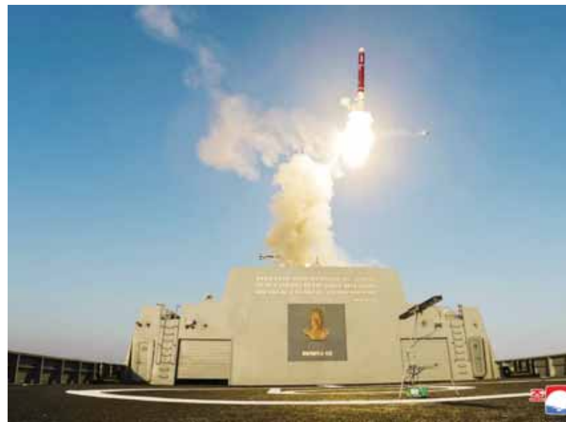
Test firings conducted in North Korea

He appreciated the ship's combination of powerful strike weapons and conventional defenses and set tasks to speed the nuclear-arming of his navy, the report said. During the ship's launching ceremony,