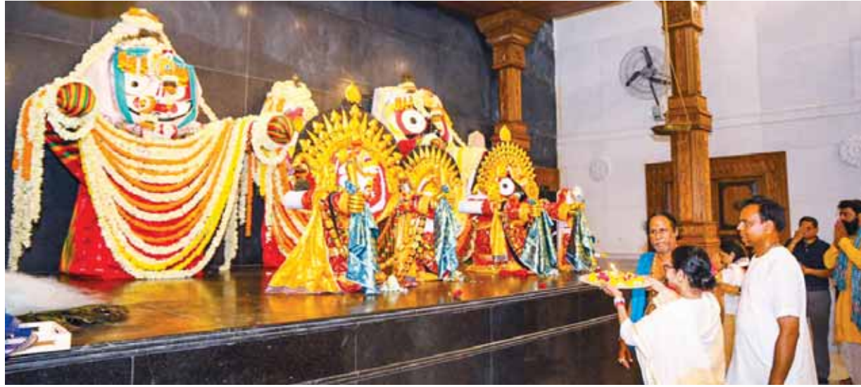
West Bengal CM Mamata Banerjee offers prayer to Lord Jagannath enshrined in the 'Garbhagriha' of the newly inaugurated Jagannath Temple in Digha

The Chief Minister also wrote, "Today, as the sacred Dhawja rose above the Jagannath Temple in Digha, I witnessed a vision conceived in 2018 come to life. With the Maha Yajna complete, we wait with bated breath for the Lord of the Universe