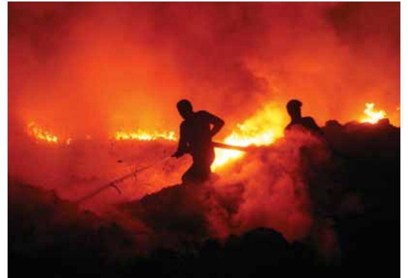
Firefighters try to douse fire that broke out in a slum area in Gurugram

The cause of the fire has not been ascertained yet, but according to the preliminary investigation, it is suspected that the fire broke out in a slum while making tea, etc, he said. "We received a call about the fire at 3.50 am. The fire brigade team reached the spot within 10 minutes. There were 150 huts there. Out of