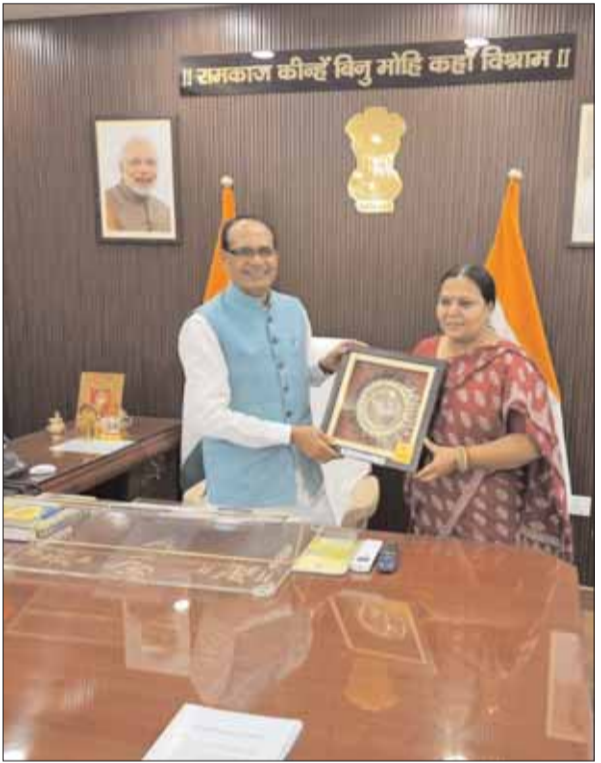
Transfer Order) of bills have already been uploaded on MNREGA portal should be expedited. In order to ensure timely payment of wages to lakhs of workers of the state, the Central Government was requested to immediately provide the pending amount of ₹150 crore in the wages head of MGNREGA. The delegation informed that the salary and operational expenses of more than 5400 workers working under MGNREGA administrative head in the state are

PNS : RANCHI A delegation of Jharkhand Government made a courtesy call on the Union Minister of Agriculture and Farmers Welfare and Rural Development Minister of Government of India, Shivraj Singh Chouhan at Krishi Bhavan, New Delhi on April 29. In the meeting, many important topics related to the implementation of centrally sponsored schemes operating in the state of Jharkhand were discussed. The state government put forth concrete demands especially on the issues of pending payments, resource allocation and policy amendments related to MGNREGA and Pradhan Mantri Awas Yojana (Rural). On behalf of the state government, the Minister was requested that the amount of Rs 747 crore pending with the Central Government in the material item under Mahatma Gandhi National Rural Employment Guarantee Act (MGNREGA) should be released in the SNA (State Nodal Account) of the state as soon as possible. It was also requested that the payment process of the works for which FTO (Fund