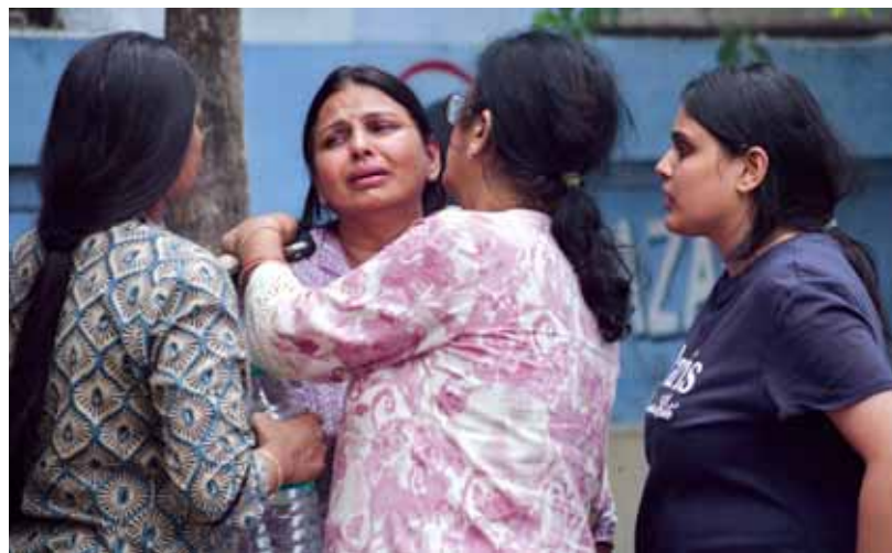
Relatives console a woman after she identified the body of her relative who was killed in the Rituraj hotel fire incident, at the RG Kar Hospital in Kolkata

A senior officer from the Kolkata Police said that, "There were 88 guests in 42 rooms at the time of the incident. A boy, a girl and a woman are among the dead." Locals said that a short circuit inside the kitchen could be the reason of the fire.