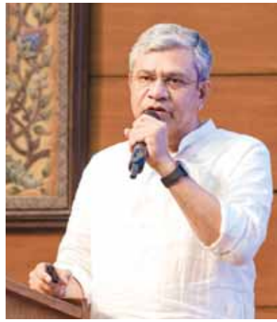
Union Minister Ashwini Vaishnaw briefs the media on cabinet decisions on Wednesday

parties have been vociferously demanding a nationwide caste census, making it a major election issue, and some States like Bihar, Telangana and Karnataka have conducted such surveys. The Government decision comes ahead of assembly elections in Bihar, where several parties including some BJP allies have been coming out in support of the caste census.