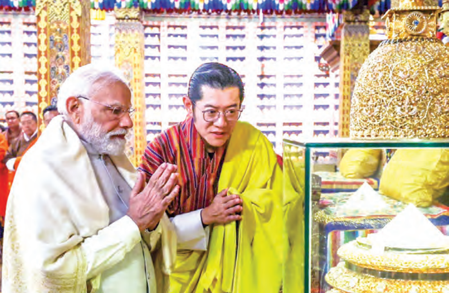
Prime Minister Narendra Modi with Bhutan King Jigme Khesar Namgyel Wangchuck offer prayers at the holy relics of Lord Buddha, at the Grand Kuenrey Hall in Tashichhodzong, Thimphu, Bhutan

The project is part of the broader Indo-Bhutan energy partnership that has made Bhutan a leader in renewable energy and the world’s first carbon-negative country. Modi also confirmed that work would soon resume on