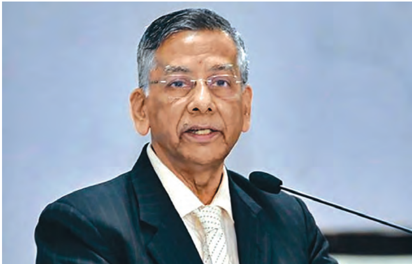
Attorney General of India, R. Venkataramani

Appointed as Attorney General for India on 28 September 2022, Venkataramani brought with him decades of experience, deep constitutional insight and a reputation for restraint and clarity. His reappointment in 2025 comes at a time when the legal challenges facing the Government are multifaceted, spanning constitutional disputes, international arbitration,