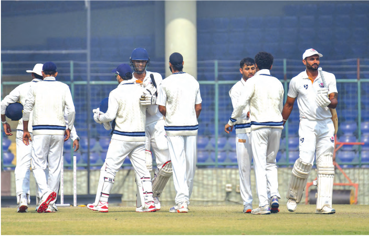
Players of Jammu & Kashmir and Delhi greet each other at the end of their Ranji Trophy 2025-26 cricket match at the Arun Jaitley Stadium in New Delhi

The roughs and indents were created on both sides of the track and Delhi's spin-