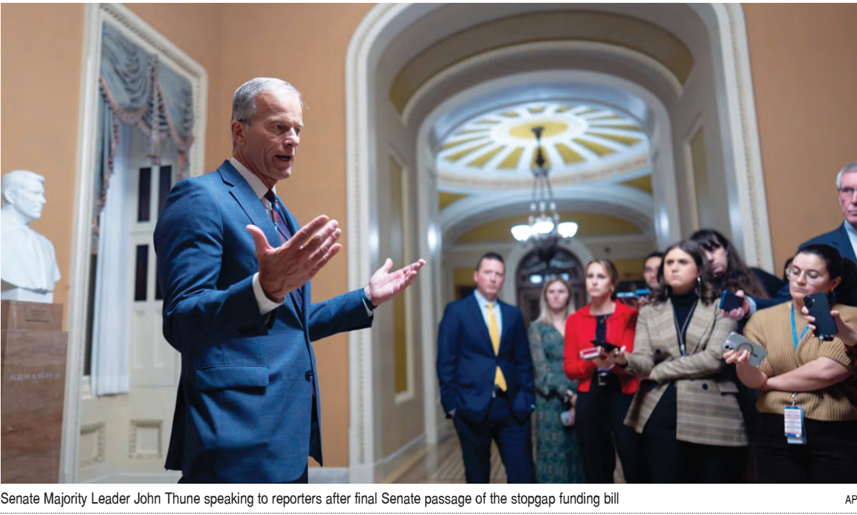
Senate Majority Leader John Thune speaking to reporters after final Senate passage of the stopgap funding bill

The Senate passed legislation on Monday to reopen the Government, bringing the longest shutdown in history closer to an end as a small group of Democrats ratified a deal with Republicans despite searing criticism from within their party. The 41-day shutdown could last a few more days as members of the House, which has been on recess since mid-September, return to Washington to vote on the legislation. President Donald Trump has signalled support for the bill, saying on Monday that "we're going to be opening up our country very quickly." The final Senate vote, 60-40, broke a gruelling stalemate that lasted more than six weeks as Democrats demanded that Republicans negotiate with them to extend health care tax credits that expire January 1. The Republicans never did, and five moderate Democrats eventually switched their votes as federal food aid was delayed, airport delays worsened and hundreds of thousands of federal workers continued to go unpaid. House Speaker Mike Johnson urged lawmakers to start returning to Washington "right now" given shutdown-related travel delays, but an official notice issued after the Senate vote said the earliest the House will vote is