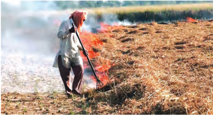
Stubble burning in Amritsar