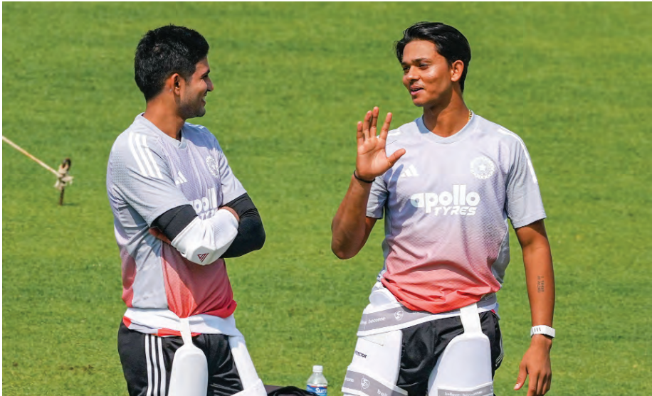
India's Yashasvi Jaiswal with captain Shubman Gill during a training session ahead of the first Test match between India and South Africa at Eden Gardens in Kolkata

Starting with spin, he faced Ravindra Jadeja and Washington Sundar, playing