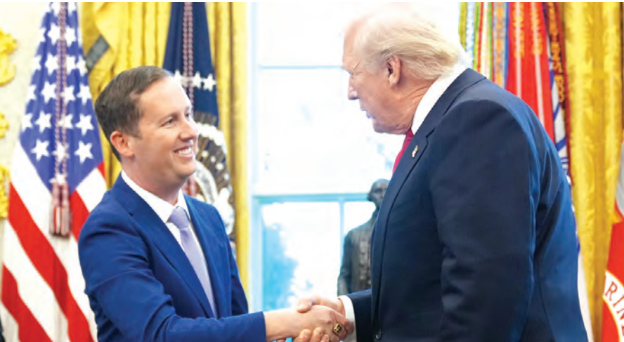
Donald Trump shaking hands with US Ambassador to India Sergio Gor in the Oval Office in Washington