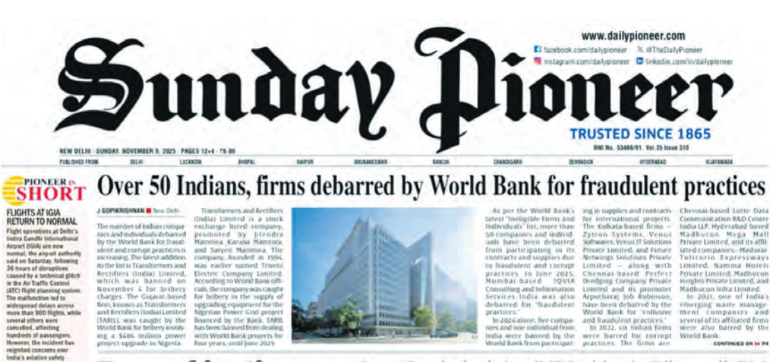
The Pioneer exclusive report on November 09, 2025 on World Bank debarring of Indian companies and individuals

Share price of Transformers and Rectifiers (India) Ltd (TARIL) extended their sharp fall on Tuesday, slipping 10 per cent to a one-year low of ₹282.80 on BSE. With this, the stock has lost nearly 28 per