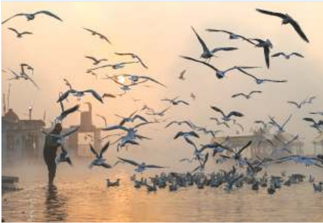
A captivating scene of gulls flying over the Narmada River at Gwarighat, Jabalpur, enlivening the sky.