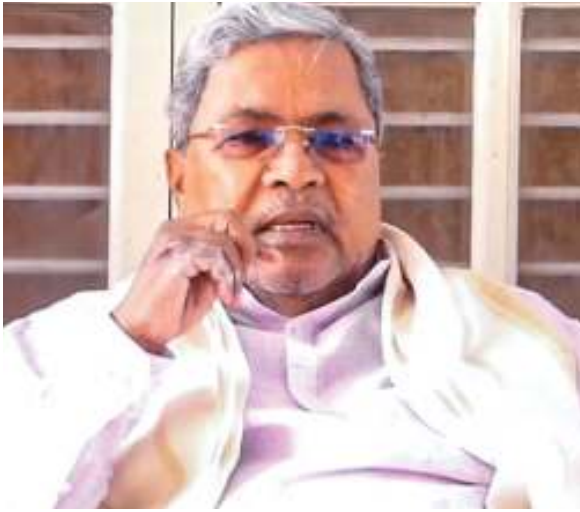
Karnataka Chief Minister Siddaramaiah addressing a press conference in Mysuru, Karnataka

Karnataka Chief Minister Siddaramaiah on Tuesday announced that the state Government is developing five world-class aerospace and defence parks in strategic locations across Bengaluru, Belagavi, Mysuru, Tumakuru and Chamarajanagar. He said the parks will offer "plug-and-play" facilities to drastically reduce setup time for industries. "We are developing five world-class Aerospace & Defence Parks in strategic locations — Bengaluru, Belagavi, Mysuru, Tumakuru and Chamarajanagar. These parks will offer 'plug-and-play' facilities to drastically reduce setup time for industries," Siddaramaiah said. He was speaking after inaugurating the Collins India Operations Centre developed by Collins Aerospace at the KIADB Aerospace Park in Devanahalli. The Chief