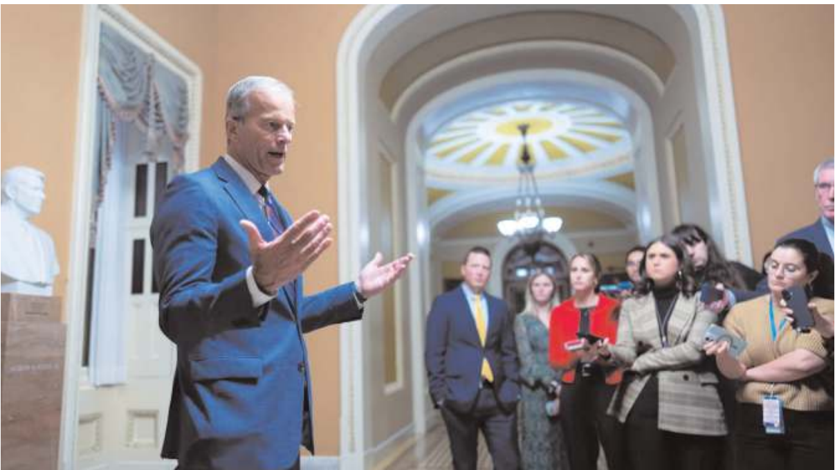
Senate Majority Leader John Thune speaking to reporters after final Senate passage of the stopgap funding bill