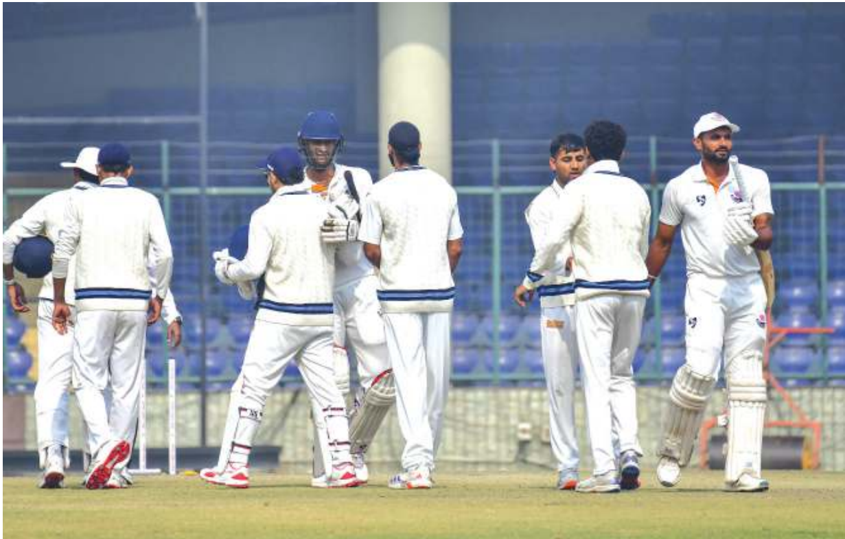
Players of Jammu & Kashmir and Delhi greet each other at the end of their Ranji Trophy 2025-26 cricket match at the Arun Jaitley Stadium in New Delhi