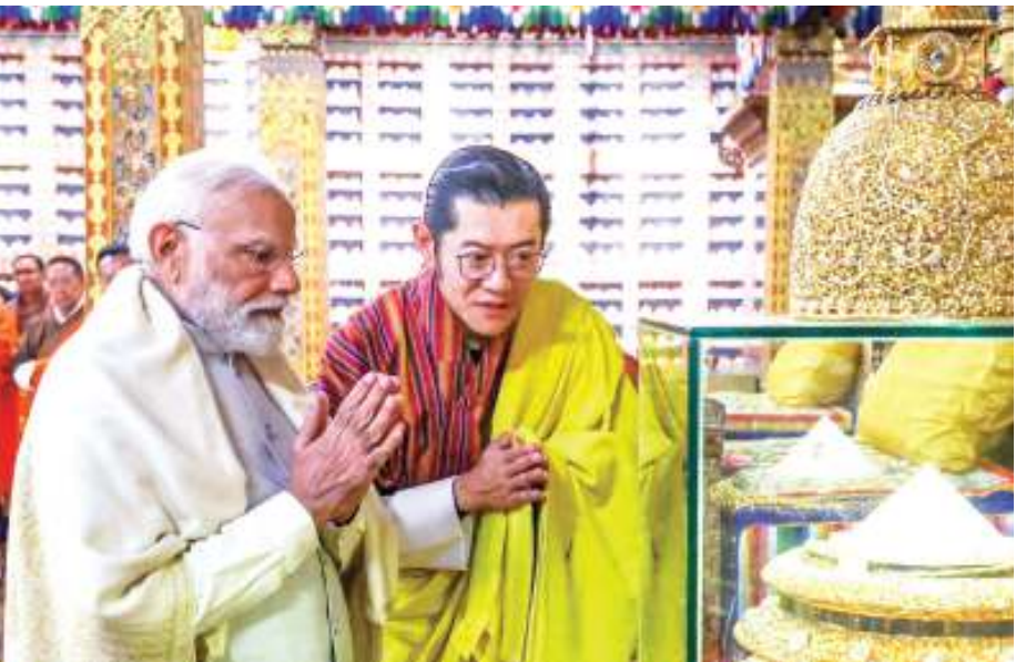
Prime Minister Narendra Modi with Bhutan King Jigme Khesar Namgyel Wangchuck offer prayers at the holy relics of Lord Buddha, at the Grand Kuenrey Hall in Tashichhodzong, Thimphu, Bhutan

The project is part of the broader Indo-Bhutan energy partnership that has made Bhutan a leader in renewable energy and the world's first carbon-negative country. Modi also confirmed that work would soon resume on