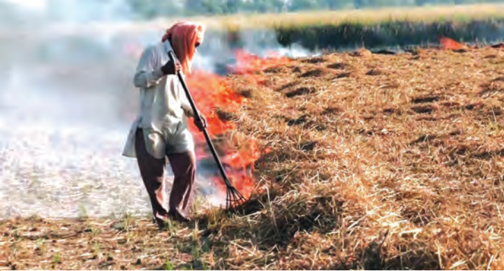
Stubble burning in Amritsar