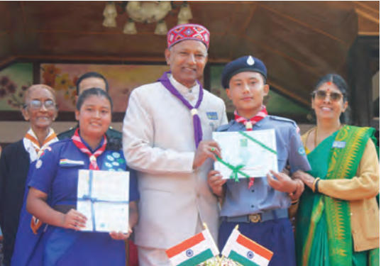
Meghalaya Bharat Scouts and Guides celebrated the 75th' Foundation Day and the Rajya Puraskar Rally at the lawn of the Raj Bhavan, Shillong. On this auspicious occasion, the Governor of Meghalaya CH Vijayashankar handed over the Rajya Puraskar (Governor's Award) Certificates, the highest State award for Scouts and Guides. A total of 305 recipients (80 Scouts and 225 Guides) from various schools around the State received the meritorious award for their dedication and perseverance

Shakti Pumps India Limited (SPIIL) reported a robust performance for Q2 and H1 FY26, delivering one of the highest quarterly revenues in its history despite operational challenges posed by an extended monsoon and raw material cost increases. The company posted consolidated revenue of ₹666.4 Crores in Q2 FY26, a 5 per cent YoY growth, taking H1 FY26 revenue to ₹1288.9 Crores, up 7.2 per cent YoY. EBITDA stood at ₹136 Crores for the quarter with margins at 20.4 per cent, impacted by a 3-4 per cent rise in prices of copper, steel and solar panels. PAT came in at ₹90.7 crores in Q2 and ₹187.5 crores for H1 FY26. Dinesh Patidar, Chairman & Managing Director, said, "Despite prolonged monsoon conditions and raw material inflation, we delivered one of the highest quarterly revenues in our history. Maharashtra has led strongly in order inflows and our pipeline across states remains robust. Our solar rooftop business is scaling rapidly and emerging segments are showing encouraging growth. With strong execution capabilities, a diversified order pipeline and strategic investments, we remain confident of delivering our FY26 guidance and sustaining long-term growth."