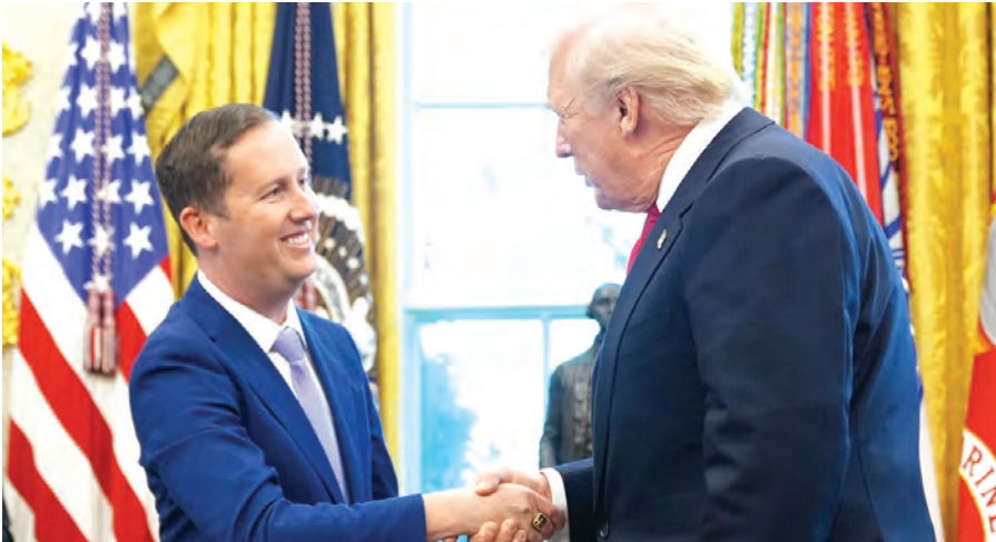
Donald Trump shaking hands with US Ambassador to India Sergio Gor in the Oval Office in Washington

“We’re making a deal with India, a much different deal than we had in the past. So right now, they don’t love me, but they’ll love us again,” Trump said on Monday without elaborating. He made the remarks during a ceremony in the Oval Office where Sergio Gor was sworn in as the US Ambassador to India by Vice President J D Vance. “We’re getting a fair deal, just a fair trade deal. We had pretty unfair trade deals. They’re very good negotiators, Sergio, so you have to take a look at that, if you would please,” Trump said. “But we’re getting close. Scott, I think we’re pretty