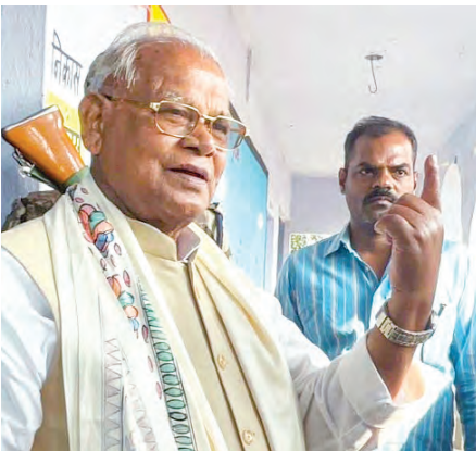
Union Minister Jitan Ram Manjhi