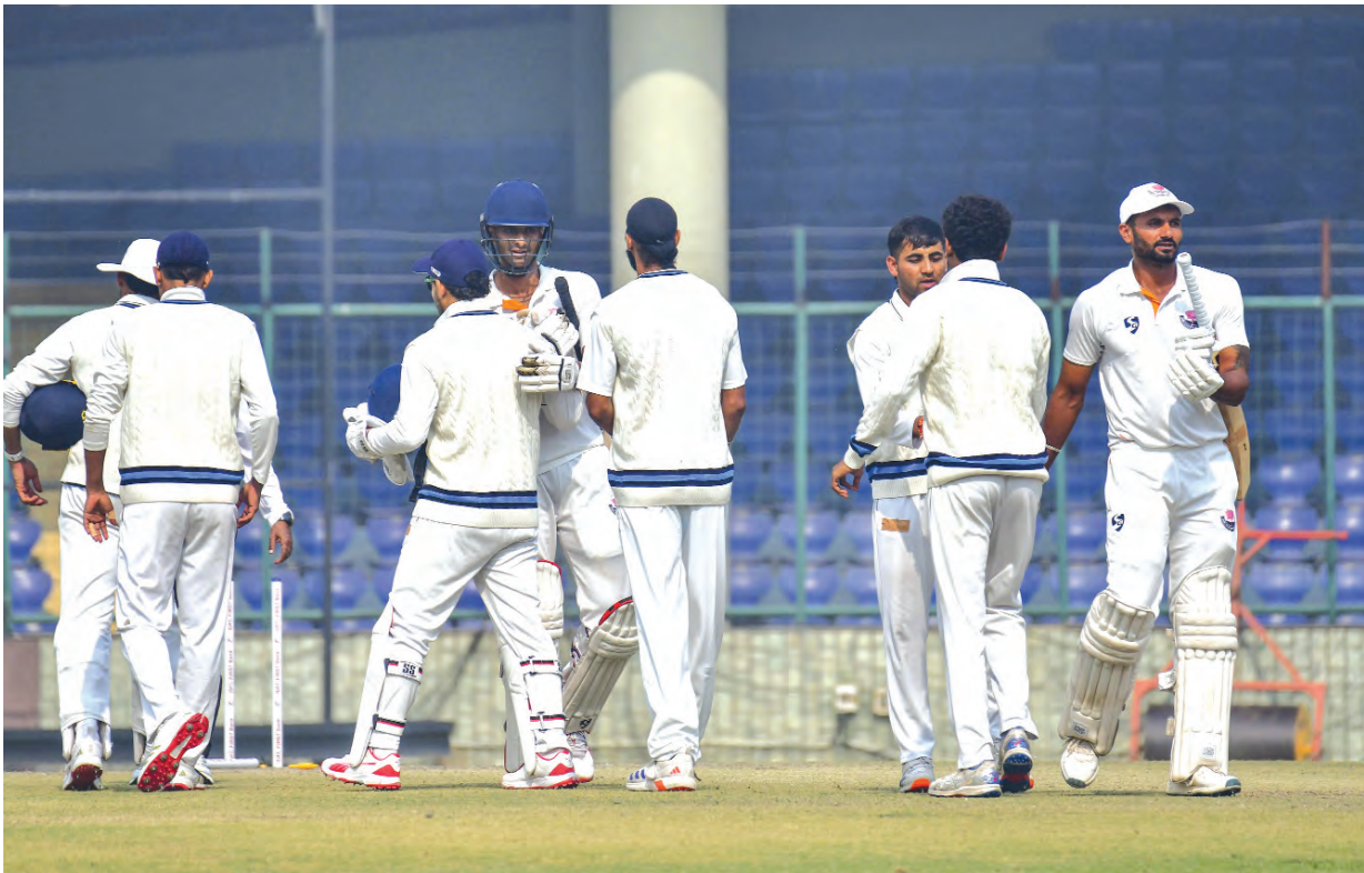
Players of Jammu & Kashmir and Delhi greet each other at the end of their Ranji Trophy 2025-26 cricket match at the Arun Jaitley Stadium in New Delhi