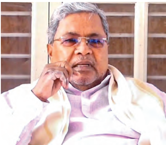
Karnataka Chief Minister Siddaramaiah addressing a press conference in Mysuru, Karnataka

Karnataka Chief Minister Siddaramaiah on Tuesday announced that the state Government is developing five world-class aerospace and defence parks in strategic locations across Bengaluru, Belagavi, Mysuru, Tumakuru and Chamaraanagar. He said the parks will offer ‘plug-and-play’ facilities to drastically reduce setup time for industries. “We are developing five world-class Aerospace & Defence Parks in strategic locations — Bengaluru, Belagavi, Mysuru, Tumakuru and Chamaraanagar. These parks will offer ‘plug-and-play’ facilities to drastically reduce setup time for industries,” Siddaramaiah said. He was speaking after inaugurating the Collins India Operations Centre developed by Collins Aerospace at the KIADB Aerospace Park in Devanahalli. The Chief