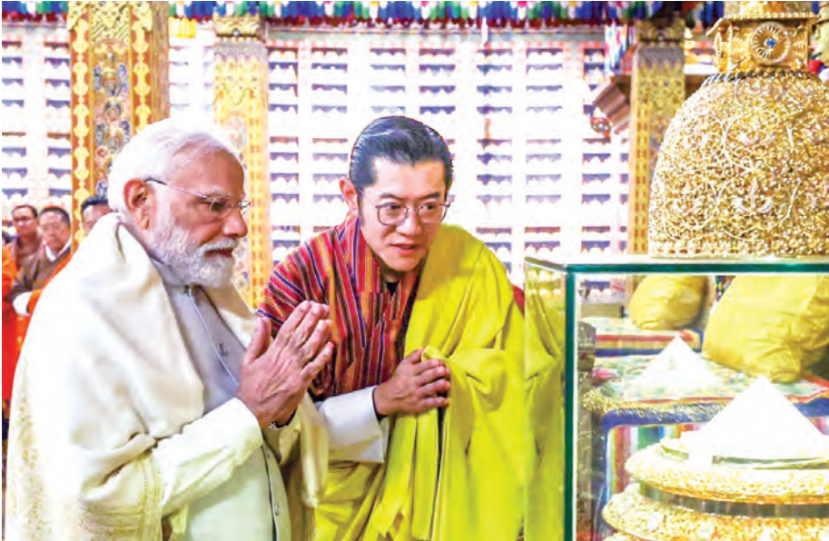
Prime Minister Narendra Modi with Bhutan King Jigme Khesar Namgyel Wangchuck offer prayers at the holy relics of Lord Buddha, at the Grand Kuenrey Hall in Tashichhodzong, Thimphu, Bhutan

The project is part of the broader Indo-Bhutan energy partnership that has made Bhutan a leader in renewable energy and the world’s first carbon-negative country. Modi also confirmed that work would soon resume on