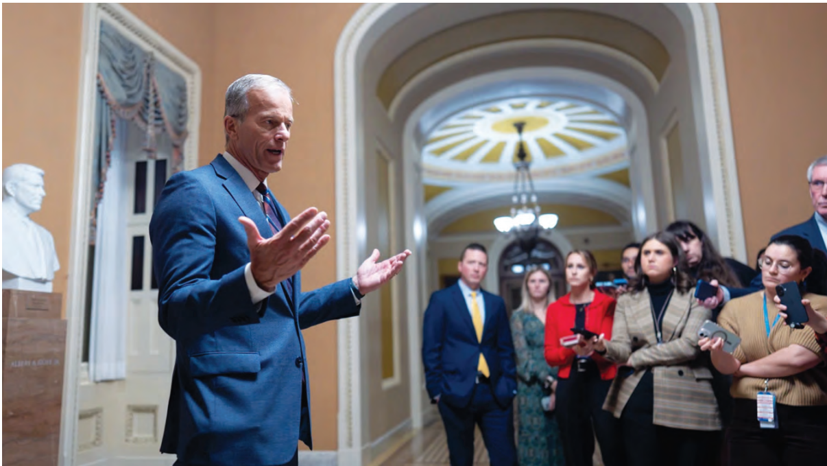
Senate Majority Leader John Thune speaking to reporters after final Senate passage of the stopgap funding bill

House Speaker Mike Johnson urged lawmakers to start returning to Washington "right now" given shutdown-related travel delays, but an official notice issued after the Senate vote said the earliest the House will vote is