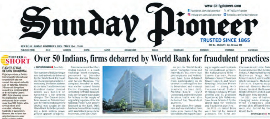
The Pioneer exclusive report on November 09, 2025 on World Bank debarring of Indian companies and individuals

Share price of Transformers and Rectifiers (India) Ltd (TARIL) extended their sharp fall on Tuesday, slipping 10 per cent to a one-year low of ₹282.80 on BSE. With this, the stock has lost nearly 28 per