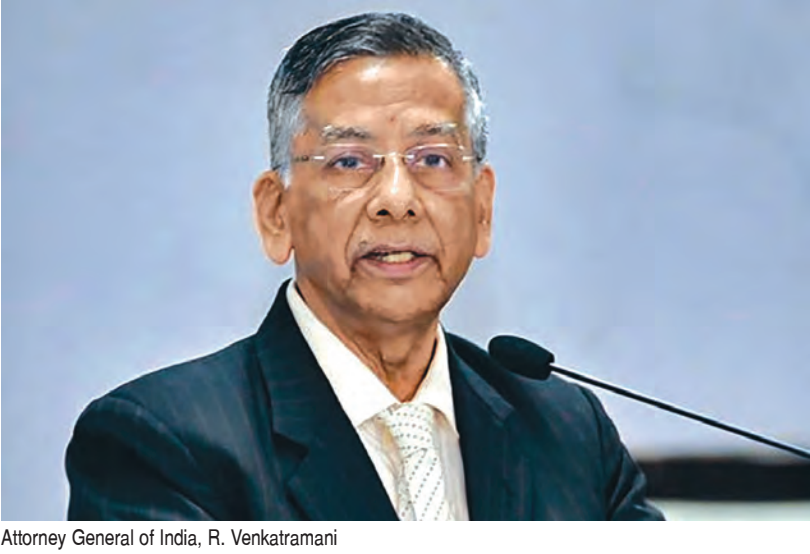
Attorney General of India, R. Venkataramani

political litigation, and the fast-evolving interface between law, technology and governance. Today’s legal landscape is no longer confined to conventional courtroom arguments. It extends into the realm of governance, diplomacy and public perception. The Attorney General’s office, as the principal legal advisor to the Government of India, stands at the intersection of law and politics. Every legal opinion or court submission has the potential to shape not only judicial outcomes but also political narratives. Venkataramani’s modesty and meticulous approach make him ideally suited for this high-stakes environment. His style, measured, reasoned and devoid of spectacle, has earned him both respect and trust in equal measure. The coming years will test his ability to navigate the complex and often turbulent waters of Indian politics and governance. The Modi administration, though led by one of the strongest polit-