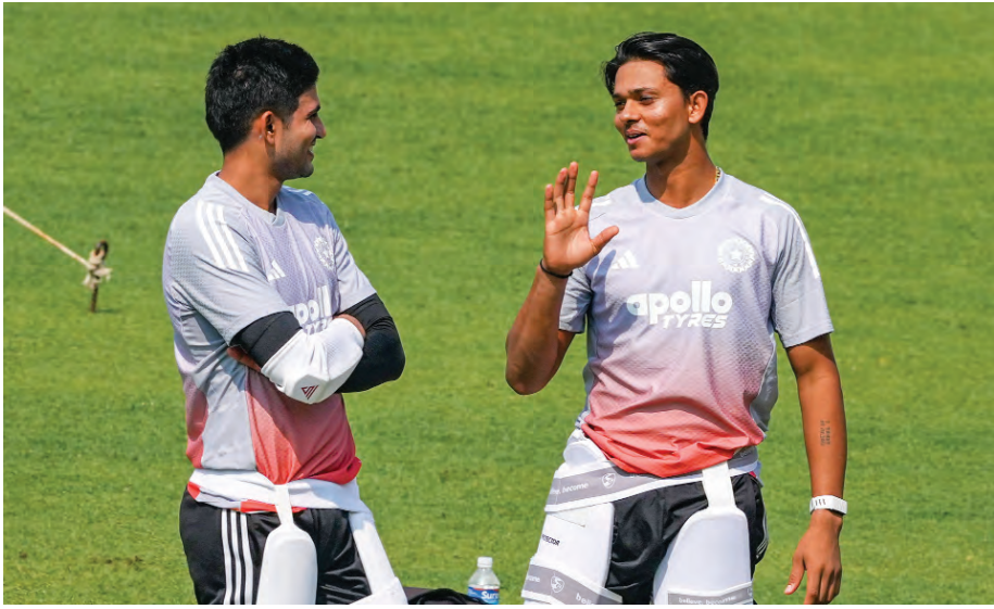
India's Yashasvi Jaiswal with captain Shubman Gill during a training session ahead of the first Test match between India and South Africa at Eden Gardens in Kolkata

Starting with spin, he faced Ravindra Jadeja and Washington Sundar, playing