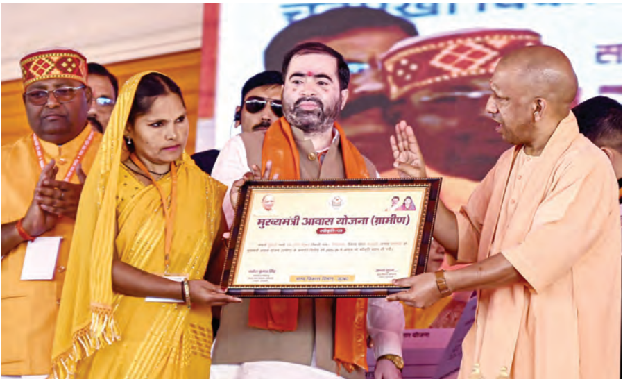
Uttar Pradesh Chief Minister Yogi Adityanath during the inauguration and foundation stone laying ceremony of various development projects, marking the 150th birth anniversary celebrations of Sardar Vallabhbhai Patel, in Barabanki, on Tuesday.

“The Mughal era and the British government shattered unity. India, which had remained united for millions of years, was fragmented one by one during the British period. The most unfortunate partition was on August 14, 1947, when the British dealt a major blow by separating the two arms of India.” He added that the intention of the Britishers was to divide India into many parts. The British government had declared that it would liberate India, but would divide it into two parts. The princely states would be given the freedom to join India or Pakistan as they wished, or they could maintain their independent existence, the chief minister said.