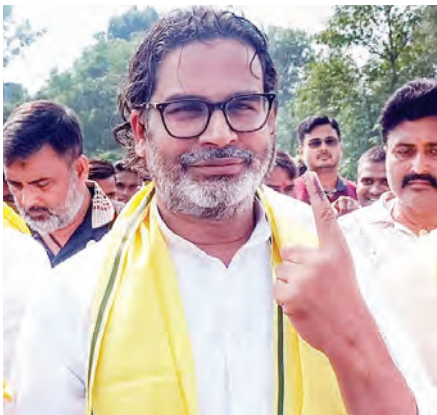
Jan Suraj leader Prashant Kishor