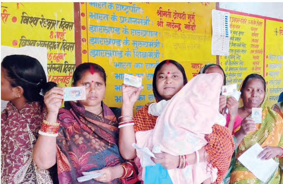
Voters standing in a queue to cast their votes at a polling station in Ghatshila on Tuesday