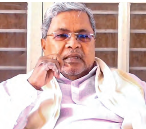
Karnataka Chief Minister Siddaramaiah addressing a press conference in Mysuru. Karnataka

Karnataka Chief Minister Siddaramaiah on Tuesday announced that the state Government is developing five world-class aerospace and defence parks in strategic locations across Bengaluru, Belagavi, Mysuru, Tumakuru and Chamaraajanagar. He said the parks will offer “plug-and-play” facilities to drastically reduce setup time for industries. “We are developing five world-class Aerospace & Defence Parks in strategic locations — Bengaluru, Belagavi, Mysuru, Tumakuru and Chamaraajanagar. These parks will offer ‘plug-and-play’ facilities to drastically reduce setup time for industries,” Siddaramaiah said. He was speaking after inaugurating the Collins India Operations Centre developed by Collins Aerospace at the KIADB Aerospace Park in Devanahalli. The Chief