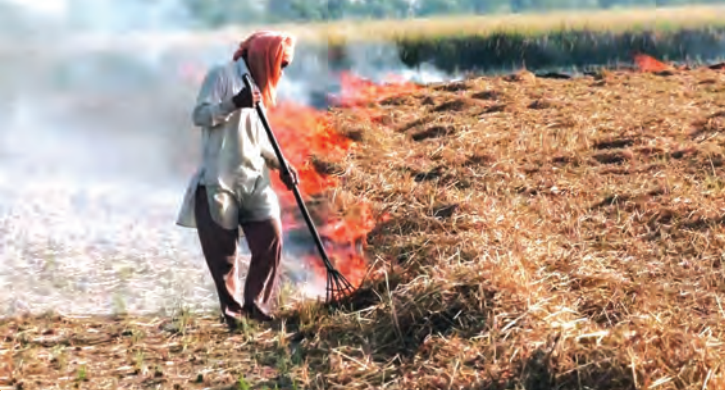
Stubble burning in Amritsar