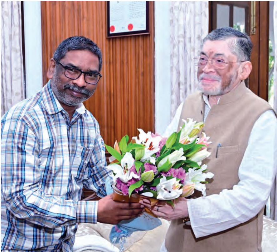
Chief Minister Hemant Soren meeting Governor Santosh Kumar Gangwar at Rajbhawan in Ranchi on Tuesday

The contribution of all match officials and referees involved in the tournament was highly commendable.