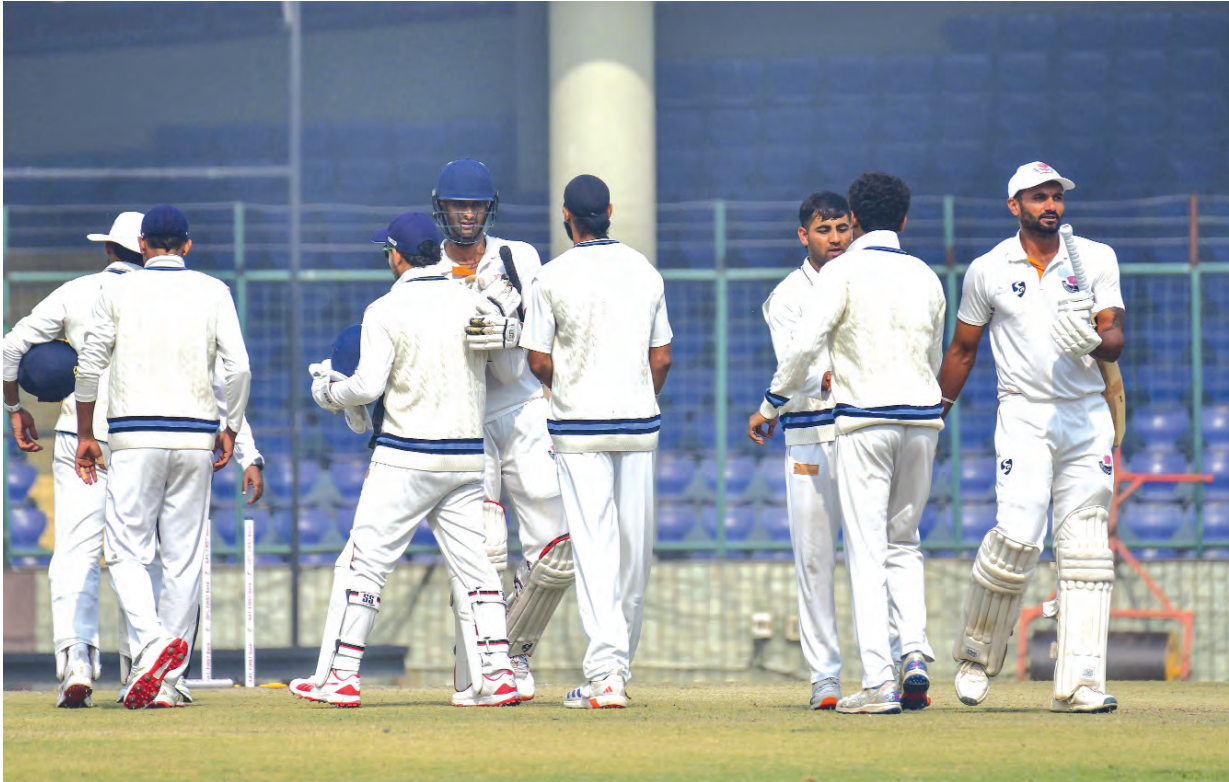
Players of Jammu & Kashmir and Delhi greet each other at the end of their Ranji Trophy 2025-26 cricket match at the Arun Jaitley Stadium in New Delhi