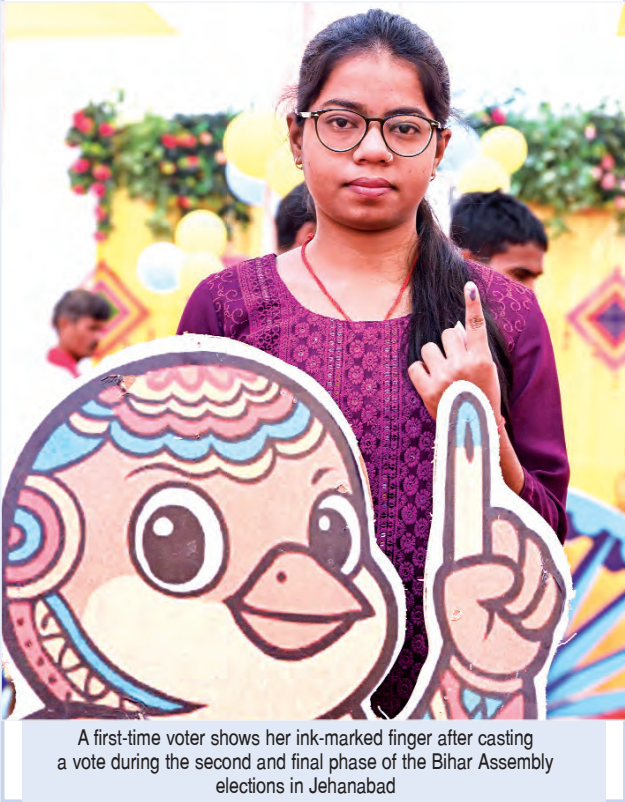
A first-time voter shows her ink-marked finger after casting a vote during the second and final phase of the Bihar Assembly elections in Jehanabad