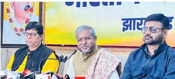
State BJP President Babulal Marandi along with others during a press conference at the party office in Ranchi on Tuesday