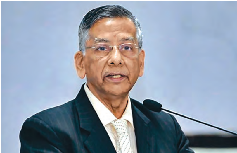
Attorney General of India, R. Venkataramani

political litigation, and the fast-evolving interface between law, technology and governance. Today's legal landscape is no longer confined to conventional courtroom arguments. It extends into the realm of governance, diplomacy and public perception. The Attorney General's office, as the principal legal advisor to the Government of India, stands at the intersection of law and politics. Every legal opinion or court submission has the potential to shape not only judicial outcomes but also political narratives. Venkataramani's modesty and meticulous approach make him ideally suited for this high-stakes environment. His style, measured, reasoned and devoid of spectacle, has earned him both respect and trust in equal measure. The coming years will test his ability to navigate the complex and often turbulent waters of Indian politics and governance. The Modi administration, though led by one of the strongest polit-