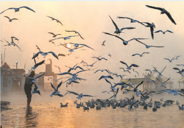
A captivating scene of gulls flying over the Narmada River at Gwarighat, Jabalpur, enlivening the sky.